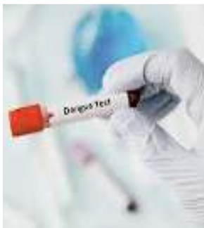
Over 4,000 dengue test kits distributed to Region Six

Skeldon, and Port Mourant Hospitals in Region Six have received additional resources to effectively handle any potential increase in hospitalizations resulting from the dengue surge.