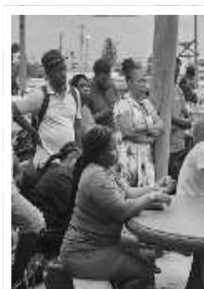
The meeting with the residents

Attorney General and Minister of Legal Affairs, Anil Nandlall, SC, made the announcement via social media, emphasising the transformative impact of land ownership. "These families have been living on these lands without titles for over five decades. The Government of Guyana is financing this initiative. In the end, each family will be issued with a transport for the land upon which their house stands,"