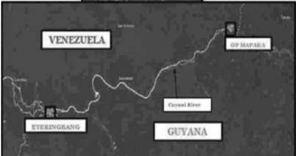
The map showing location of the incidents

“We remain resolute in our mission to protect Guyana’s territorial integrity and ensure the safety of our citizens and personnel,” he said.