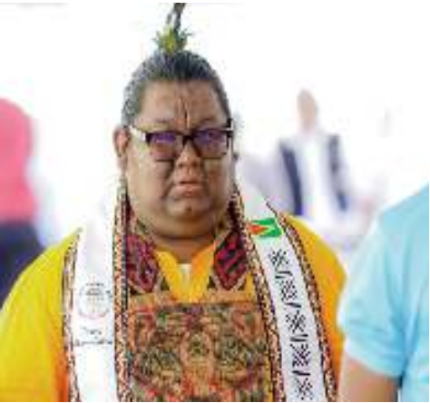
Scene from the engagement with the Tshaos at State House

To support community development, the Government will also expand its