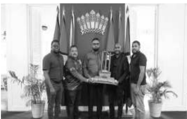
President Ali was presented with a unique, handcrafted trophy

The tournament is scheduled to commence on June 28 in Berbice,