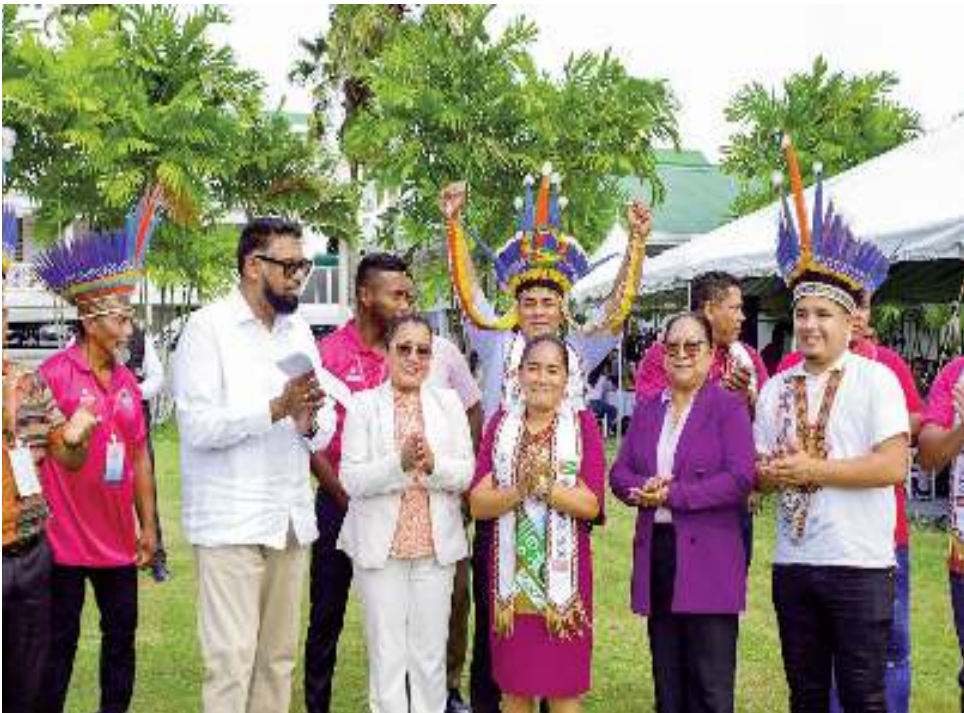
Original Certificates of Title for Manawarin and Sawariwau, along with extensions were handed over

indigenous people is shown through hard work, commitment, and a full understanding that your priority is our priority.” Moreover, the President announced that Amerindian community policing personnel serving at the borders will be sworn in as rural constables.