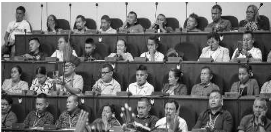
Toshaos at the 2025 NTC Conference