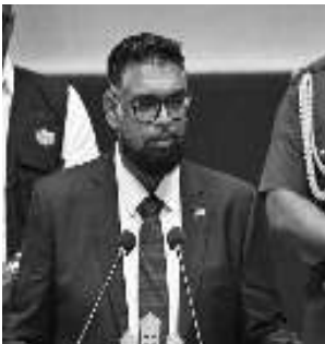
Scenes from the 39th Annual General Meeting and the Association of Caribbean Commissioners of Police (ACCP) Conference

President Ali specifically called on the ACCP to prioritise the development of a comprehensive communication strategy that tackles security and policing challenges throughout the Caribbean. He acknowledged a current