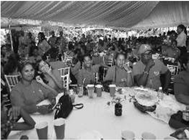
Scene from the brunch at State House

the first $50,000 of healthcare, and the