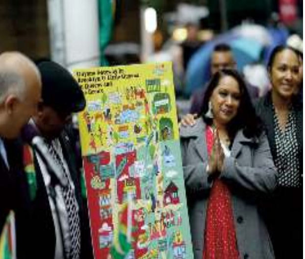
Scene from the event

“From Little Guyana in Queens to Flatbush and Canarsie in Brooklyn, New York City wouldn’t be the same without the passion and hard work of our Guyanese community. Today, we proudly raised the Guyanese flag at Bowling Green to honor their invaluable contributions to our