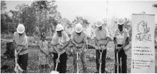
Minister of Education, Priya Manickchand alongside the contractor and regional officials turning the sod for the Micobie Secondary School in 2024

While acknowledging that some contractors face genuine obstacles, such as adverse weather conditions, the Minister was unequivocal about