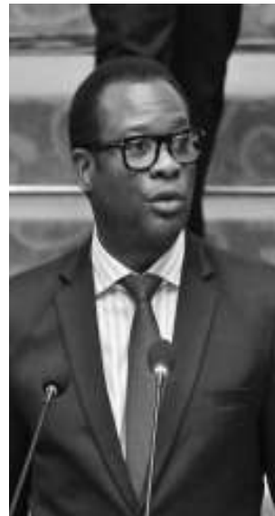
Minister of Foreign Affairs and International Cooperation, Hugh Todd

Minter Nandlall revealed that the motion was sent to the opposition nearly a week in advance with an open invitation