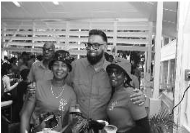
Scene from the brunch at State House

will do so not only by words. We will do so of reliable governance. He emphasised the