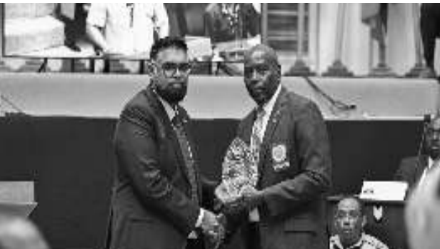
President Ali receiving a plaque for his robust leadership

President Ali also pointed to legislative reforms now underway. The Attorney General's Chambers is actively reviewing Guyana's crime-fighting laws, with the goal of reinforcing the legal foundation for broader regional security collaboration.