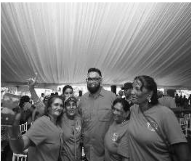
Scene from the brunch at State House

by actions, actions that we have proven in the last four years," President Ali stated, building on the theme