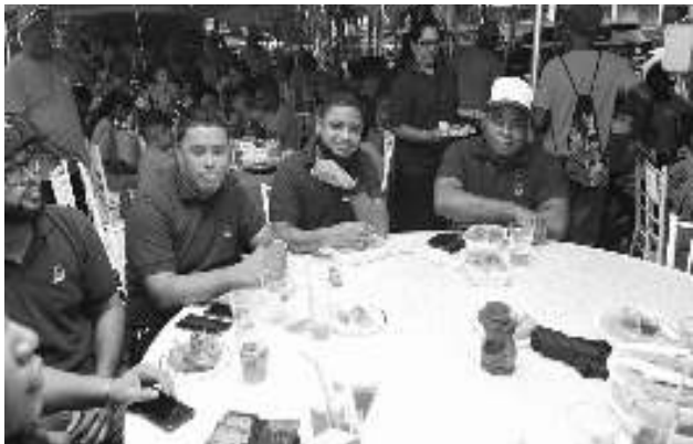
Scene from the brunch at State House

He concluded by pledging ongoing investments in critical infrastructure, community safety, reliable electricity, and public services, all contributing to the government's overarching goal of improving the quality of life for every Guyanese worker.