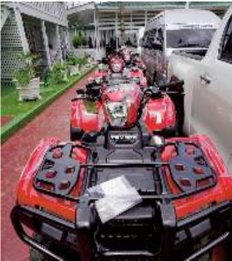
Transportation asset handed over to the Tshaos

plan on which the Government is advancing development. For us, food security is critical, especially for the hinterland.”