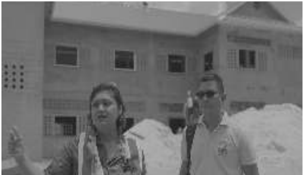
Minister of Education Priya Manickchand updating the media about the dormitory at Bartica Secondary School

hinterland areas. This commitment is further demonstrated by the ongoing construction of a $231 million secondary school in Jawalla, which will also feature a dormitory, teachers' quarters, and other essential amenities to accommodate 500 students in classrooms and 400 in dormitories upon completion.