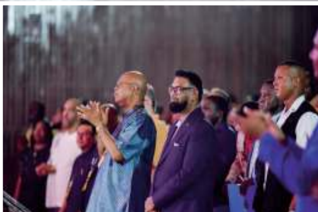
President Dr Mohamed Irfaan Ali at the Hope is Rising event at the National Cultural Centre

important role of religious institutions in promoting unity and national cohesion, stressing that they should acknowledge efforts in education, healthcare, infrastructure, and support for the