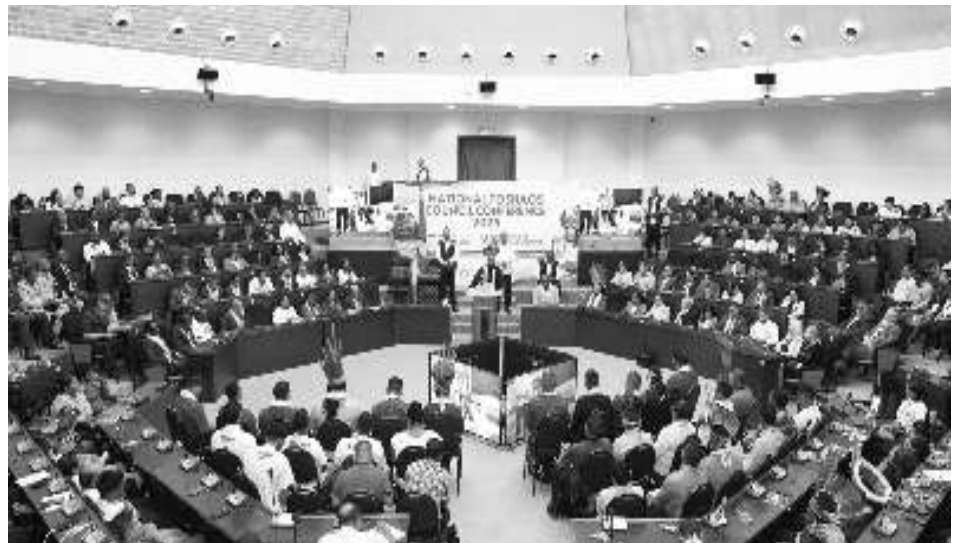
Opening day of the NTC Conference 2025

Guyana's full support from the International Court of Justice (ICJ) and the international community. The ICJ has warned Venezuela against any attempts to alter the status quo, under which Guyana administers the disputed region—a warning underscored by Venezuela's announcement of a "sham election" for Essequibo on May 25. Dr. Jagdeo issued a stern warning: Venezuelan nationals residing in Guyana who participate in the illegal vote will face deportation.