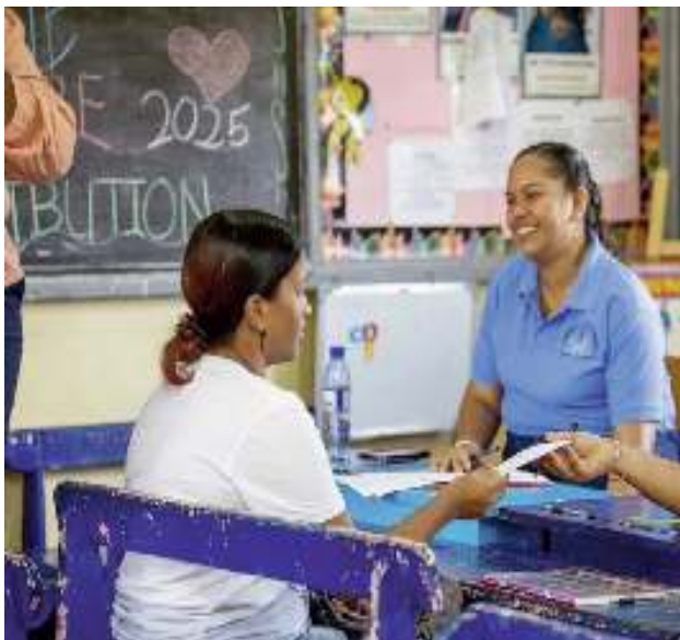
Recipient with the grant

As the initiative continues to unfold across Guyana, it not only provides tangible financial support to families but also reaffirms the government’s commitment to making education a national priority. By investing in students and empowering households, the ‘Because We Care’ grant plays a key role in shaping a more equitable and promising future for the next generation.