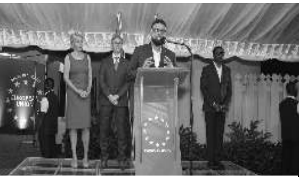
Scene from the Europe Day Reception

President Ali highlighted the importance of adapting this partnership to meet current global challenges, including rising economic protectionism and geopolitical instability. "In today's global landscape, it is essential that Guyana and the EU engage in deeper, strategic