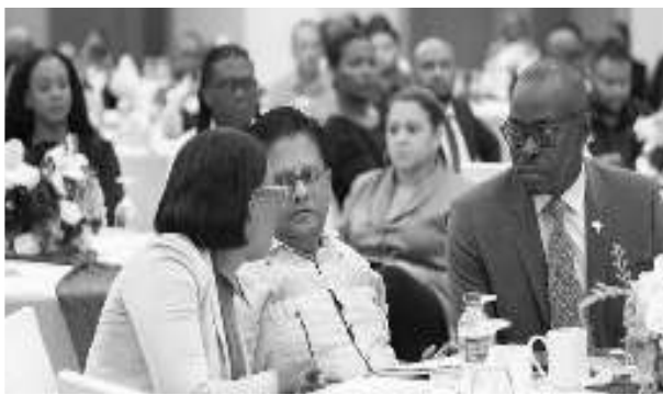
Scene from the launch of the financing facility to support local businesses in the oil and gas sector at the Marriott Hotel