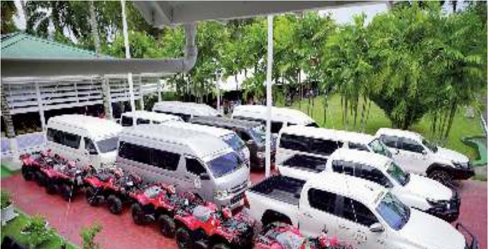
Transportation asset handed over to the Tshaos

To amplify education in the hinterland, the Government has established ICT hubs in many communities for residents to benefit from online classes.