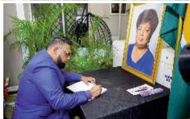
President Ali attends Janazah for former PNCR Minister Amna Ally

wore each with selfless dedication, but perhaps the role she embraced most naturally was that of a human being who