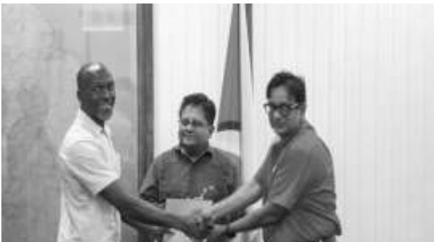
Government facilitates pay increases for GPL and GUYOIL workers in new multi-year agreements (1)

The first agreement, signed between GPL and the Guyana Public Service Union (GPSU), covers the years 2024 and 2025 and will see