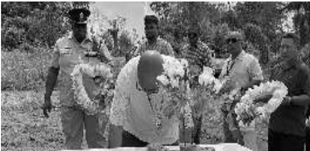
Minister of Public Works Bishop Juan Edghill laying a wreath

Families, friends, students, and national leaders came together in a moving tribute filled with songs, poems, prayers, and candlelight reflections. The ceremony served as a powerful reminder of both the deep pain caused by the tragedy and the strength and resilience of those left