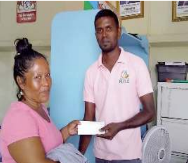
Recipient with the grant