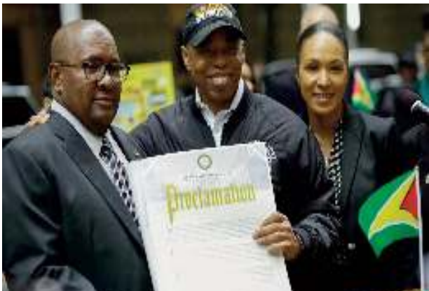
Scene from the event

The Golden Arrowhead was proudly raised at Bowling Green in New York City this week to honour the more than 40,000-strong Guyanese community and to commemorate Guyana’s 59th Independence Anniversary, observed on May 26.