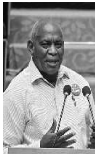
Minister of Home Affairs, Robeson Benn

its commitment to defending Guyana's territorial integrity. "The world is on our side. Our neighbours are on our side. International law, peace, and diplomacy are on our side," Minister Nandlall affirmed.