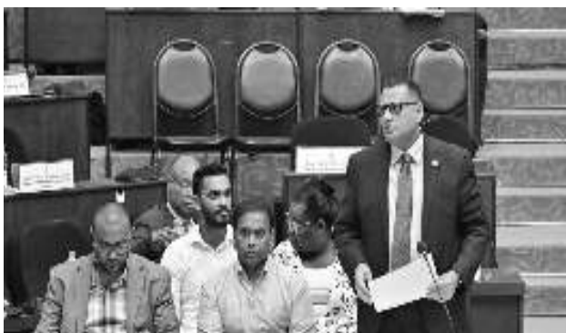
Government ministers successfully defended the allocations to their respective sectors

costs by 50% and provide reliable power for industry, manufacturing, and residential use.