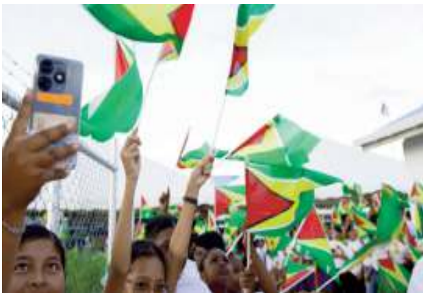
Guyanese showcasing their patriotism

to cross the fence. Don’t cross the fence.”