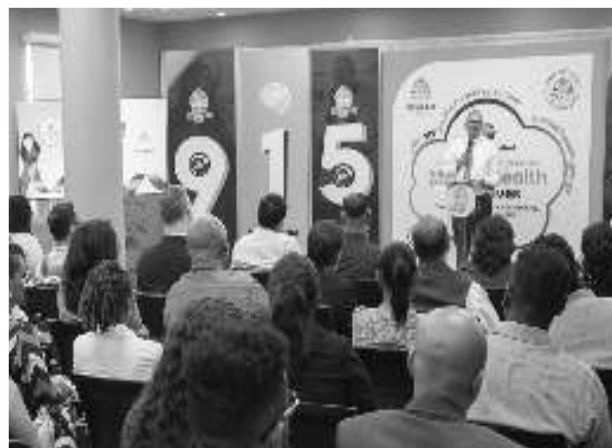
Minister of Health Dr. Frank Anthony addressing the launch