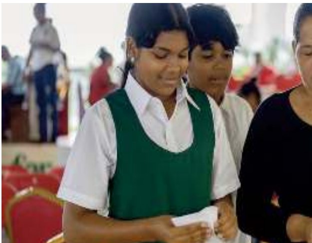
Recipient with the grant

The Ministry of Education has rolled out the 2025 edition of its flagship ‘Because We Care’ Cash Grant, with successful distributions already completed in Regions Two, Five, Seven, and Nine.