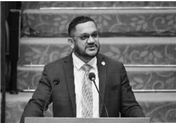
Minister of Natural Resources Vickram Bharrat

Together, these two laws represent a bold step forward in securing Guyana’s prosperity—both by protecting its offshore oil resources and by reinforcing its place as a strong, secure partner in regional and global security networks.