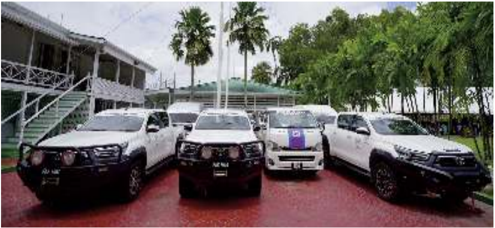
Transportation asset handed over to the Tshaos the communities themselves.”

“In this new era, we want not only to give you more resources. We want you more integrally involved in the building out of your community, in the improvement of your communities. We want to maximise your participation so that the benefits—the maximum benefits—from these projects remain in