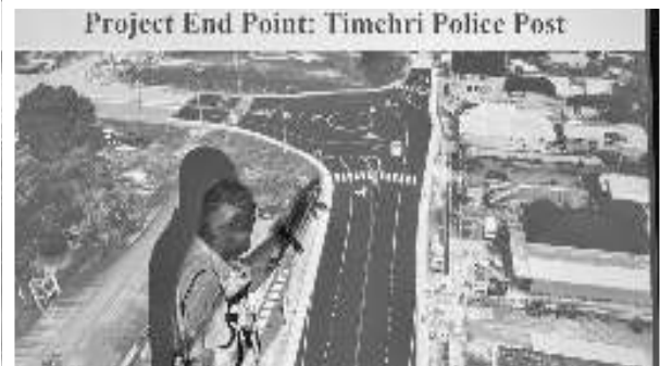
Ministry and Inter-Development Bank (IDB) conducting night audit

the Minister stressed the need for accelerated construction to keep the project on track. Following the consultation, officials from the Ministry of Public Works and the IDB conducted a night audit to evaluate