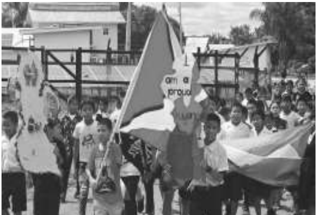
Pupils of Aishalton Primary, Region Nine marching and chanting “Essequibo is ours!” as part of Youth Week activities

The statement comes as Venezuela moves forward with plans to conduct elections aimed at asserting control over