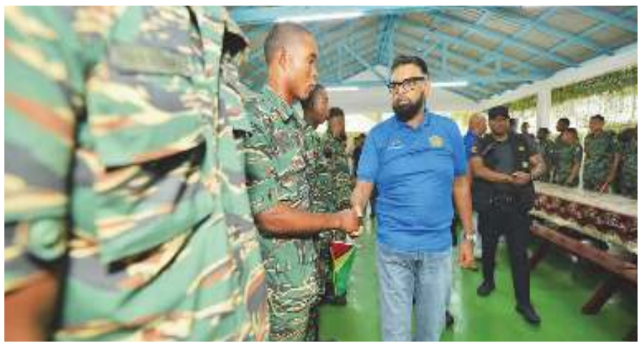
PRESIDENT ALI SALUTES JOINT SERVICES FOR UNWAVERING PATRIOTISM AND NATIONAL DEFENCE