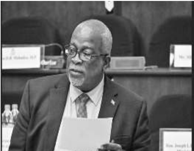
Prime Minister Brigadier (Ret'd) Mark Phillips

The National Assembly on May 23 reaffirmed Guyana's sovereignty over its 83,000 square miles of territory, unanimously passing a government-tabled motion that also condemned Venezuela's continued aggression. The move comes just days before Venezuela is set to hold a sham electoral process for Guyana's territory—an act deemed illegal by the International Court of Justice (ICJ).