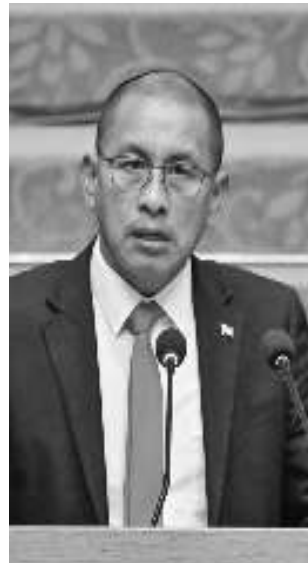
Government MP Alister Charlie

Despite the walkout, the government reiterated