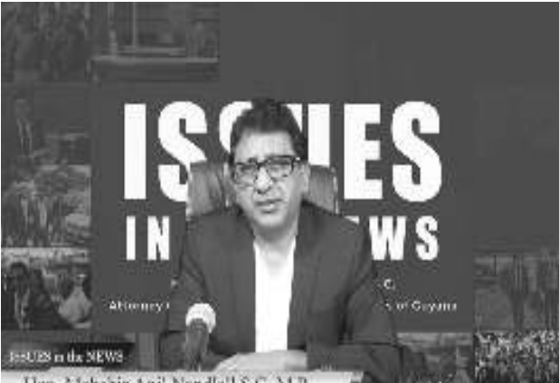
Attorney General and Minister of Legal Affairs, Mohabir Anil Nandall, SC