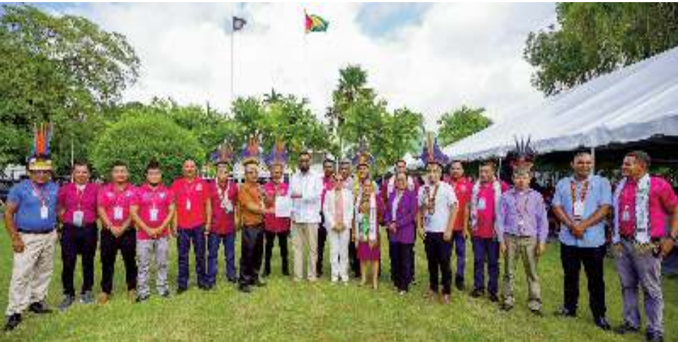
Original Certificates of Title for Manawarin and Sawariwau, along with extensions were handed over

Several Cabinet Ministers, Government officials, and members of the Joint Services were also present at the meeting.