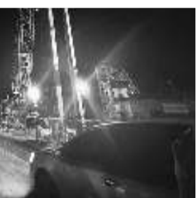
Ministry and Inter-Development Bank (IDB) conducting night audit

The current contract entails upgrading the corridor to two lanes, but the government is actively considering a future expansion to