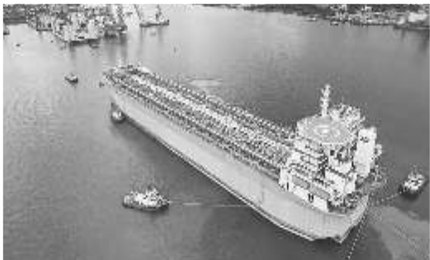
The One Guyana FPSO