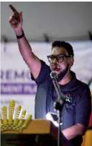
President Ali addressing Essequibians

- HEAD OF STATE AFFIRMS GUYANA’S SOVEREIGNTY OVER 83,000 SQUARE MILES