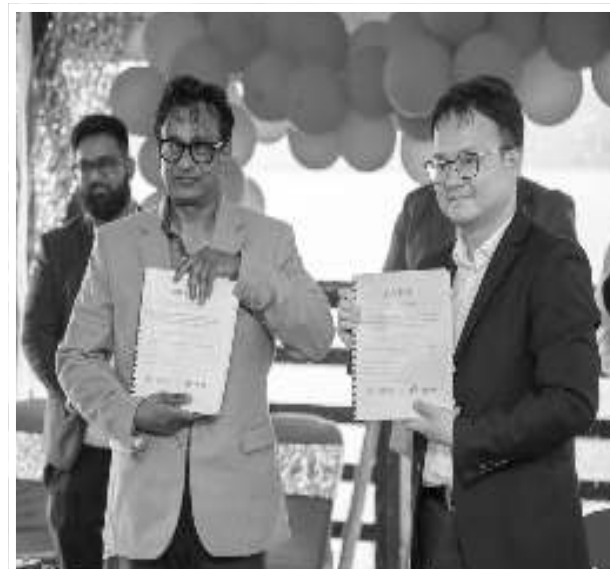
The signing of the contract

This initiative falls under the broader Guyana Utility-Scale Solar Photovoltaic (GUYSOL) programme and is funded through the Guyana REDD+ Investment Fund (GRIF)—a fund supported by Norway in recognition of Guyana's forest conservation efforts.