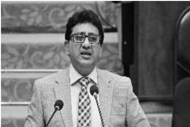
Attorney General and Minister of Legal Affairs Anil Nandlall

Attorney General and Minister of Legal Affairs Anil Nandlall underscored that the bill also supports local content development