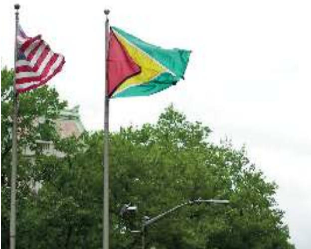
Scene from the event

In a Facebook post marking the occasion, Mayor Adams noted: