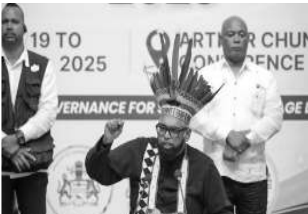
President Ali addressing the opening of the 2025 NTC Conference

The 2025 National Toshaos Council (NTC) Conference concluded on a high note after four days of dynamic engagement between over 250 Indigenous leaders and senior government officials. Held at the Arthur Chung Conference Centre under the theme “Robust Governance for Sustainable Village Development,” the event reaffirmed the People’s Progressive Party Civic (PPP/C) Government’s steadfast commitment to empowering Amerindian communities and fully integrating them into Guyana’s broader national transformation. Throughout the conference, the PPP/C’s model of inclusive governance was clear—delivering concrete results through decisive action rather than mere promises.