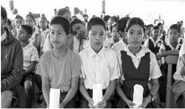
Students holding candles during the candlelight vigil

The memorial was a poignant moment of reflection, unity, and recommitment to protecting the lives and futures of Guyana’s children—so that such a tragedy is never repeated.