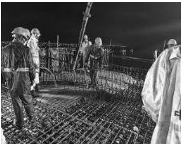
Pouring of concrete for segment seven

Key milestones achieved include the near completion (98