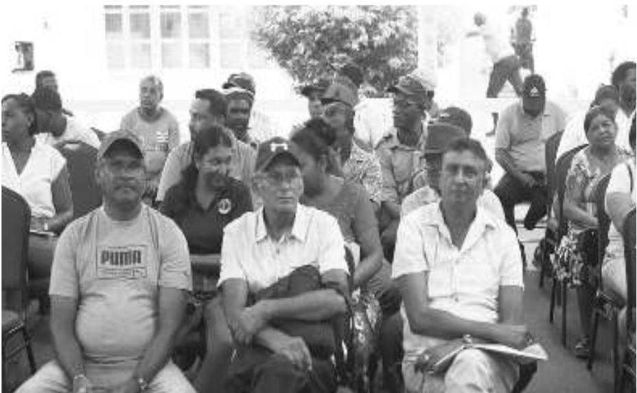
Legal Affairs Ministry leads talks on land acquisition for energy project