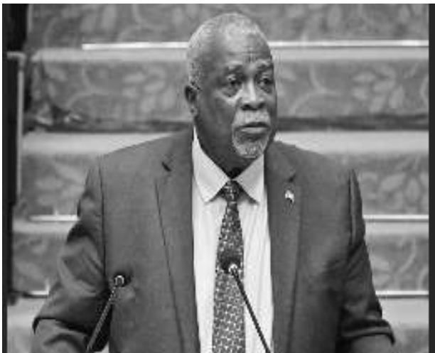
Prime Minister Mark Phillips passionately advocating for the oil soil legislation

Guyana has taken decisive steps to safeguard its natural resources and enhance national and regional security with the passage of two landmark bills by the National Assembly.