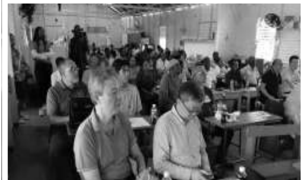
Stakeholders at the consultation

Minister of Public Works, Bishop Juan Edghill, made the announcement during a consultation on the East Bank Demerara Road improvement project in Timehri. He said the equipment, currently out for tender, forms part of a stricter enforcement strategy to hold truck