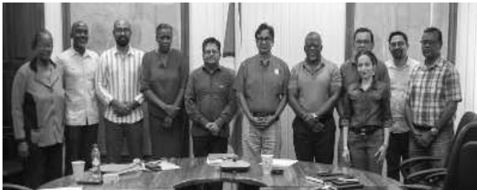
Government facilitates pay increases for GPL and GUYOIL workers in new multi-year agreements

These agreements follow similar deals concluded with the Guyana Teachers Union, public servants, university staff, and GAWU, underscoring the government's continued commitment to fair compensation and worker well-being across sectors.