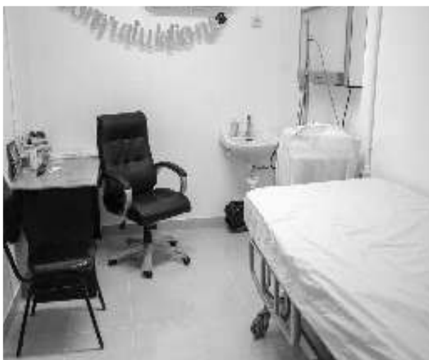
An interior view of Industry Health Centre