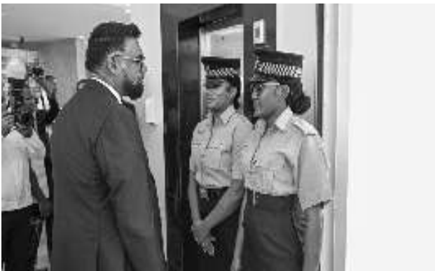
Scenes from the 39th Annual General Meeting and the Association of Caribbean Commissioners of Police (ACCP) Conference

combat the spread of false information. (ACCP) in Georgetown, President Ali emphasised