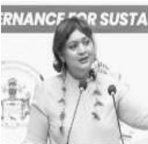
Minister of Education, Priya Manickchand

secondary school in Micobie grew stronger after the tragic Mahdia dormitory fire in 2023, which claimed the lives of 20 children. The school was seen as a vital part of improving access to education and safety for students in the Region Eight hinterland.