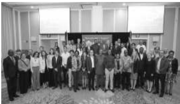
The high-level forum

economic development must be treated as complementary goals—not competing interests. “The FCLP must elevate forest action to the highest political level, so that forests