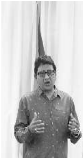
Legal Affairs Ministry leads talks on land acquisition for energy project

which is expected to significantly lower energy costs and improve reliability across the country. “This is a national development priority, and the Government intends to compulsorily acquire the required lands and pay market value in accordance with the law,” Minister Nandlall stated in a Facebook post following the engagement. He added that the process will mirror similar land acquisition exercises undertaken for other national projects. Reassuring residents, the Attorney General emphasised that affected individuals will be treated fairly and that their rights will be fully respected. “The government assures that every effort will be made to ensure compensation; and that they are accorded all the protective safeguards guaranteed to them by the Constitution and law,” he said. The transmission corridor will eventually stretch from the East Coast of Demerara to No. 53 Village on the Corentyne Coast, forming a critical part of the infrastructure required to deliver cleaner, more affordable energy to homes and businesses. The government’s proactive engagement with landowners signals its commitment to inclusive development and responsible project execution as the Gas-to-Energy initiative moves forward. Further consultations are expected as the project progresses through additional phases.