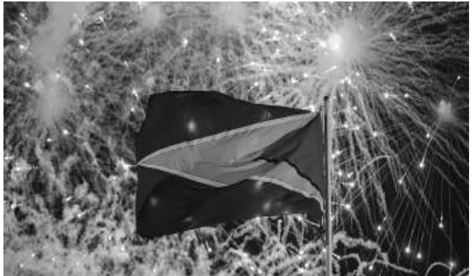
Guyana is celebrating 59 years as an Independent nation

Conference, which brought together over 240 Indigenous leaders under the theme 'Robust Governance for Sustainable Village Development'. The event provided a direct platform for leaders to engage with ministers and shape policy. "PPP governments have engaged these toshaos every single year and addressed their concerns. The opposition's sudden interest is purely