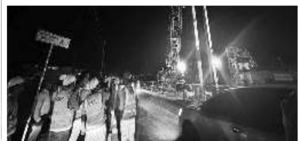
Ministry and Inter-Development Bank (IDB) conducting night audit

engaged residents and stakeholders, accompanied by officials from the Ministry, the China Road and Bridge Corporation (CRBC)—