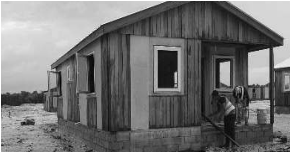
The Stabroek Block, located approximately 120 miles offshore Guyana

Homestead Programme. The initiative, launched by President Irfaan Ali, is designed to empower low-income families, particularly