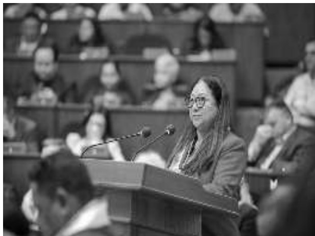
Minister of Amerindian Affairs Pauline Sukhai addressing the opening of the 2025 NTC Conference

From multi-billion-dollar sector investments to direct community grants, the 2025 NTC Conference highlighted the PPP/C Government’s proven track record of inclusion, action, and Indigenous empowerment. As President Ali reminded the leaders, “This is not