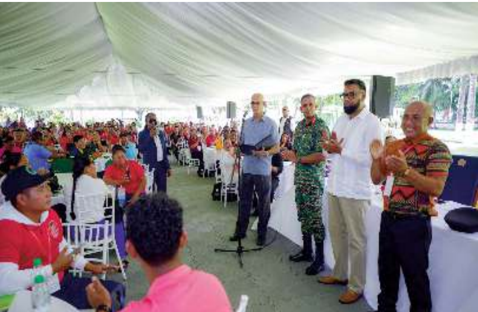
Scene from the engagement with the Tshaos at State House

“We intend to create an enabling environment to help all indigenous communities enhance their agricultural drive. Food security is an important