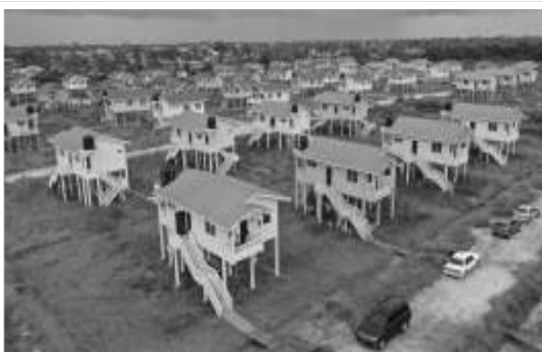
Higher mortgages, easier SME loans for Guyana

Ali stated. Previously, the maximum mortgage offered by NBS was GY$20 million with an interest rate starting at 5.7 percent. This new policy not only raises the borrowing ceiling by 50% but also ensures a more favorable interest rate for loans within the increased limit. While NBS does offer other mortgage rates as low as 3.50 percent, the government’s intervention guarantees that a significant segment of the housing loan market will now benefit from the GY$30 million