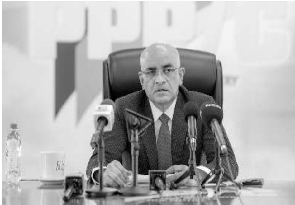
General Secretary of the People's Progressive Party (PPP), Dr Bharrat Jagdeo

PROTECT INDEPENDENCE, DEFEND PROGRESS As Guyana prepares to mark 59 years of independence on May 26, 2025, PPP General Secretary Dr. Bharrat Jagdeo is urging citizens to safeguard the nation's progress and recommit to unity and democracy. Addressing the media at Freedom House, Dr. Jagdeo called the anniversary a pivotal moment for reflection