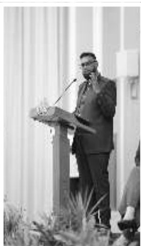
The high-level forum

Development and forest preservation are deeply intertwined and require accessible climate financing to succeed, declared President Dr. Mohamed Irfaan Ali at the inaugural meeting of the Forest and Climate Leaders' Partnership (FCLP) in Georgetown. Addressing delegates at the high-level forum, President Ali called on climate specialists to design practical, readily available financial solutions that support forest-rich nations. As co-chair of the FCLP alongside the United Kingdom, he emphasised that environmental protection and