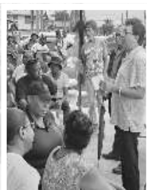
The meeting with the residents

credit, expanding their homes, or securing their inheritance. The