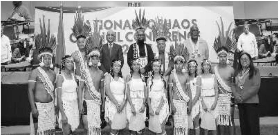
The conference allowed for dialogue between the Toshaos and the government

just about today. This is about building a future together.” With hundreds of projects underway and new initiatives just announced, Indigenous communities are not only being heard—they are being equipped to lead. The PPP/C Government’s vision for Guyana clearly includes every region, every village, and every voice.