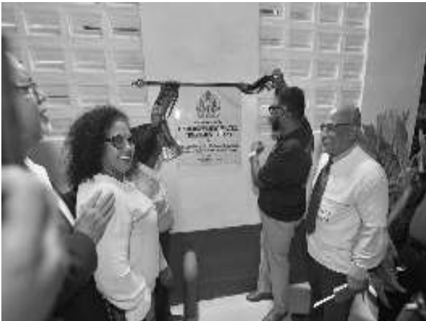
Scene from the commissioning

The plant serves more than 18,000 residents in communities including Supenaam, Good Hope, Spring Garden, Good Intent, Aurora, Dryshore/