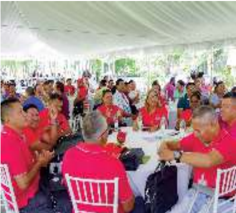
Scene from the engagement with the Tshaos at State House

During the engagement, the President spoke extensively about infrastructure development in indigenous communities. He announced that his Government will allocate an additional $1bn this year to further support hinterland road development. The plan, he explained, is to identify roads and bridges that can be repaired through community-led work.