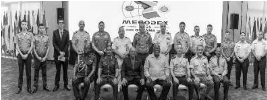
Prime Minister Mark Phillips at the opening of MECODEX

Now in its fourth edition, MECODEX has grown from a virtual tabletop exercise in 2022 to in-person drills in Ecuador (2023), Peru (2024), and now Guyana.