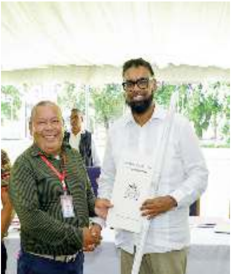
Original Certificates of Title for Manawarin and Sawariwau, along with extensions were handed over

To ensure the development of talented individuals within Amerindian communities, the President declared that his Government will allocate $1m to each community to develop or enhance its community grounds to help unearth young talents in sport and culture. This will complement the $3m allocated to each village to assist with housing development.