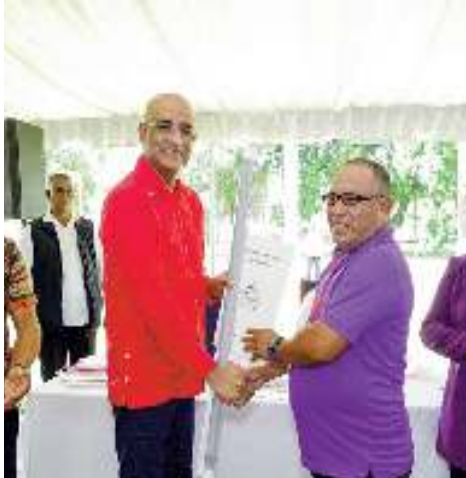
Original Certificates of Title for Manawarin and Sawariwau, along with extensions were handed over

As a result, a high-level task force comprising representatives from the NTC, CEOs of the telecommunications companies, the Ministry of Amerindian Affairs, and the Office of the Prime Minister will meet to devise a joint strategy for hinterland telecommunications expansion.