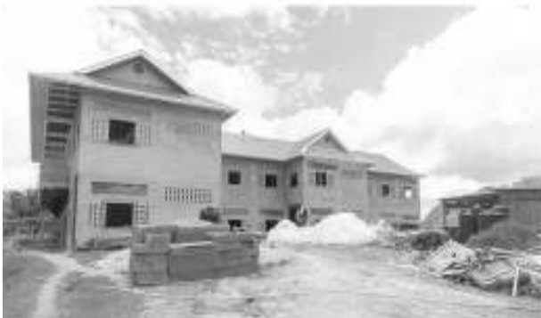
The new dormitory under construction at Bartica Secondary School

The development at Bartica Secondary aligns with the government's broader strategy to achieve universal secondary education in Region Seven and other