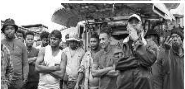
Affected truckers gathered in Linden

free trucks," Minister Edghill clarified. "Any concessions provided are limited to equipment used within quarry sites—not for transportation."