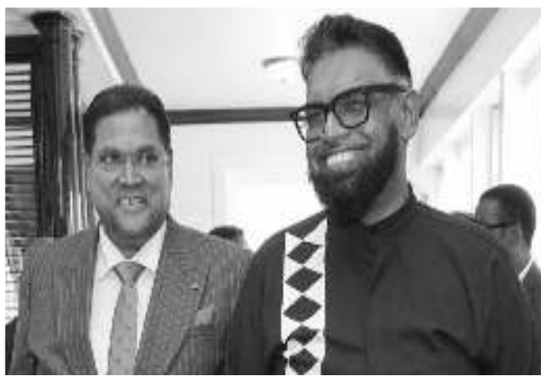
The meeting with the two presidents

President Dr. Irfaan Ali and President Chandrikapersad Santokhi of Suriname met at State House in Georgetown to advance