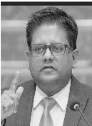
Government ministers successfully defended the allocations to their respective sectors

The National Assembly has approved a $57.5 billion Supplementary Appropriation Bill, paving the way for continued implementation of major government initiatives in housing, electricity, infrastructure, and agriculture.