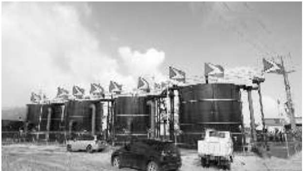
Scene from the commissioning

Nationally, the government has invested $40 billion to construct seven large water treatment plants, with the goal of reaching 90% treated water coverage by the end of 2025. Additionally, 12 existing plants are being upgraded, 200 km of transmission mains installed, and 18 small treatment plants built across Regions Two, Four, Five, and Six.