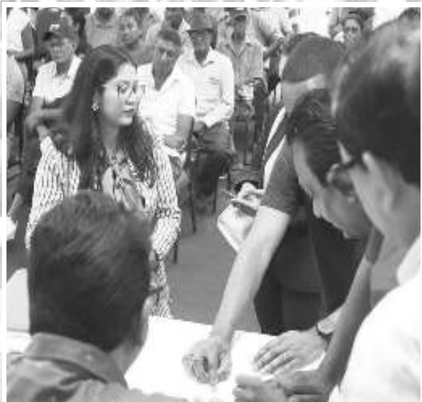
Legal Affairs Ministry leads talks on land acquisition for energy project

As Guyana’s transformative Gas-to-Energy project progresses, the government has begun consultations with landowners whose properties fall along the planned transmission route. Attorney General and Minister of Legal Affairs, Anil Nandlall, SC, met with more than 70 affected residents from Goedverwagting to Columbia, Mahaicony. The meeting is part of the Government’s approach to ensure transparency, fairness, and collaboration as it undertakes compulsory land acquisition to facilitate the installation of power transmission cables. These cables will carry electricity generated from the Gas-to-Energy project, that the process is consultative and fair; that the affected persons receive adequate