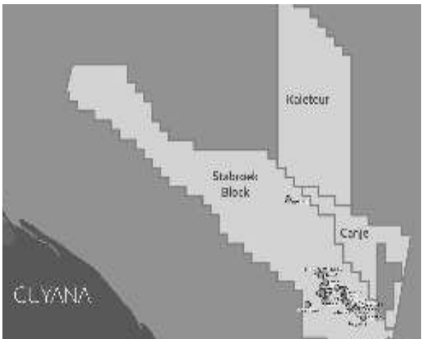
The Stabroek Block, located approximately 120 miles offshore Guyana