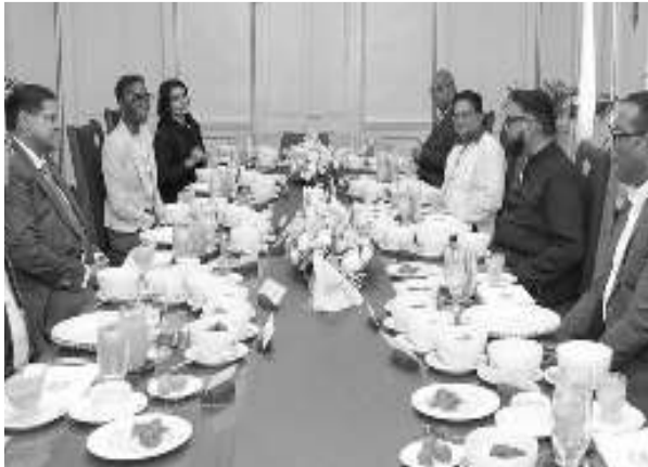
The meeting with the two presidents