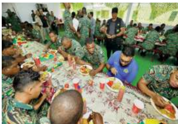
Guyanese showcasing their patriotism

Speaking from Essequibo, President Ali reaffirmed the government’s resolve to maintain peace across the entire territory. “We will ensure that peace continues to be