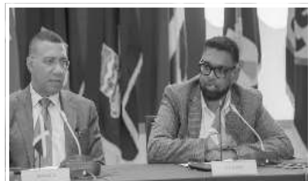
President Ali addressing a closing press conference on the final day of the 48th CARICOM Heads of Government meeting in Barbados

reflect the commitment of Caribbean nations and their international partners to foster collaboration in critical sectors, ensuring a more resilient and interconnected region for the future.