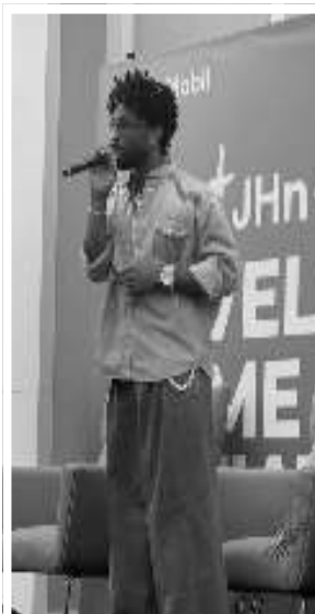
Grammy-winning music sensation Saint Jhn addressing the event

Saint Jhn's involvement goes beyond mere appearances. He actively engaged with