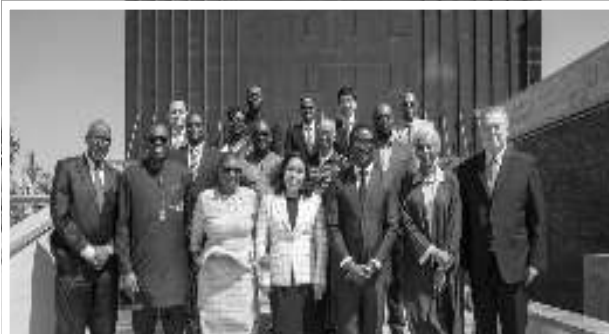
Minister of Foreign Affairs and International Cooperation Hugh Todd

African and Caribbean nations within the UN framework.