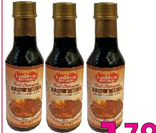
Caribbean Dreams Browning 147 ml