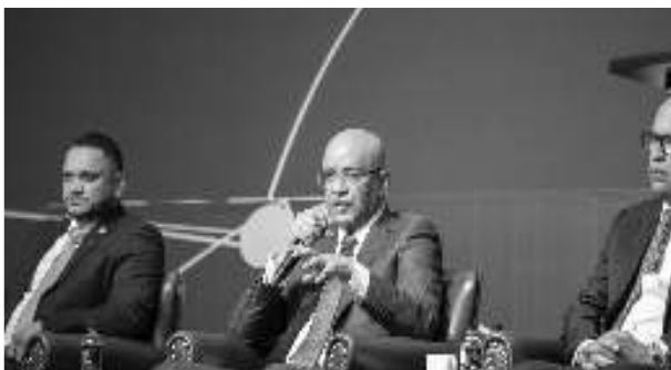
Vice President Jagdeo answering questions posed by students

Vice President (VP), Dr Bharrat Jagdeo engaged in a wide-ranging discussion with students at the Guyana Energy Conference and Supply Chain Expo, addressing their questions and concerns about the nation's energy future, educational opportunities, and the government's broader vision for youth development.