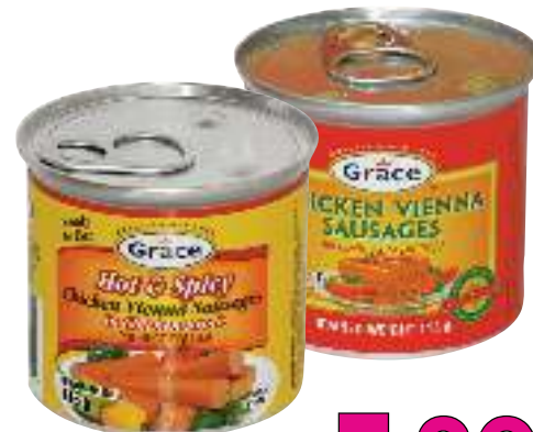
Grace Vienna Sausage Assorted 130 g