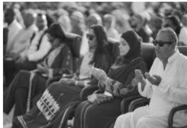
Scene from the event

As one of the five pillars of Islam, Ramadan is observed worldwide through fasting, prayer, and community involvement. In Guyana, the Ramadan Village serves as an important venue for citizens to immerse themselves in the spiritual essence of