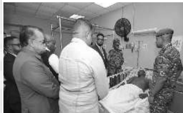
President Ali visiting the injured Guyana Defence Force soldiers

The timing of the attack is particularly sensitive, occurring on the 59th anniversary of the 1966 Geneva Agreement, which provides the framework for resolving the border controversy between the two nations. Guyana has called on Venezuela to embrace peace and respect for its sovereignty and territorial integrity.