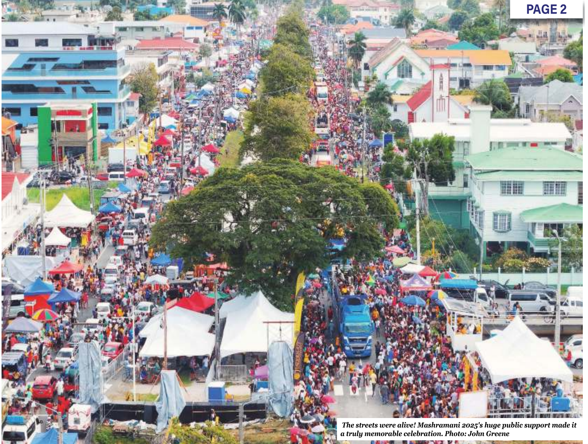
The streets were alive! Mashramani 2025's huge public support made it a truly memorable celebration.