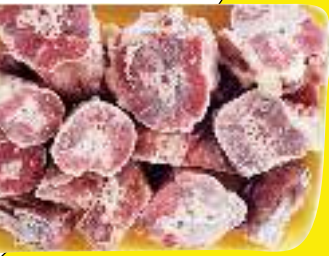
Frozen Square Cut Turkey Neck