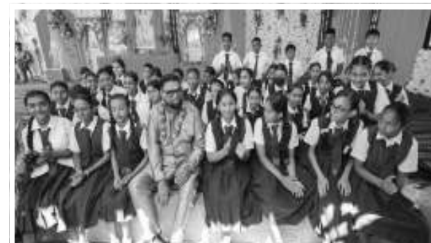
Scene from the Maha Shivaratri celebration at the Cove and John Ashram

diversity as a source of strength, President Ali encouraged the public