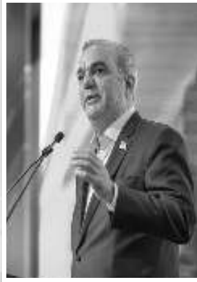
Dominican Republic President Luis Abinader

Abinader's remarks come amidst growing ties between the Dominican Republic and