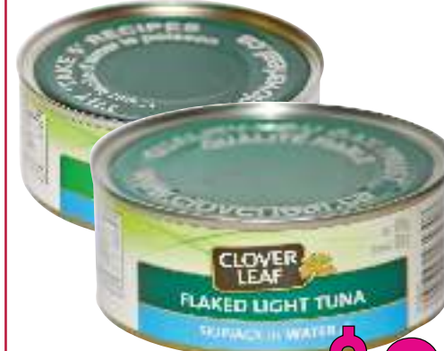
Clover Leaf Chunk Light or Flake Light Tuna 170 g