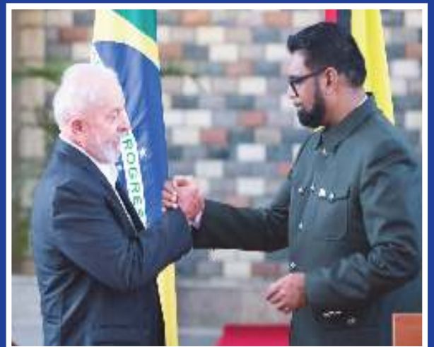
GUYANA EYES NORTHERN BRAZIL; TRADE MISSION SET FOR 2025 TO BOOST ECONOMIC TIES