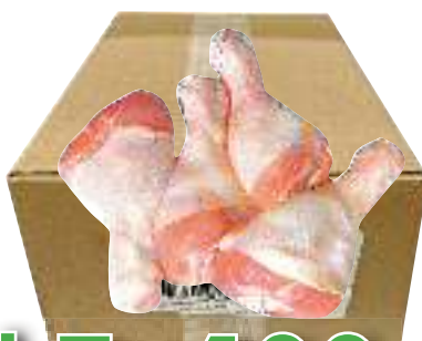
Frozen Exceldor Chicken Drumsticks