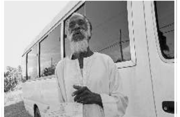
A recipient with their cash grant

points. Another issue involves inconsistencies in the documentation required for cheque collection. Dr Jagdeo cited instances where citizens who registered with passports were later told they needed ID cards. He attributed this to varying interpretations of the rules by staff and pledged to provide clearer guidelines. Despite these