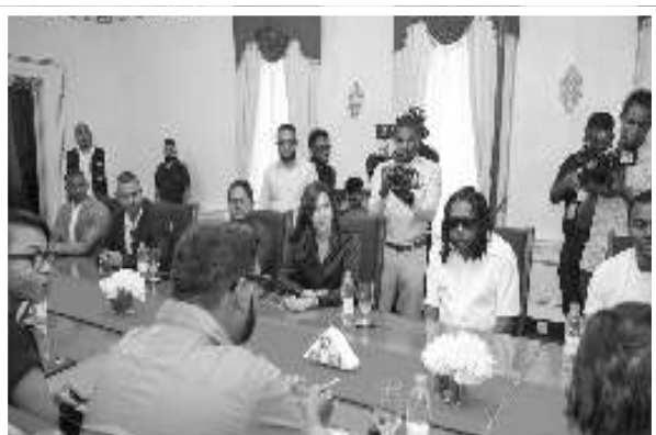
Vybz Kartel at State House

Kartel's visit, beyond the rum launch, signals a significant investment in the Guyanese music scene, aiming to elevate local talent onto the global stage through collaboration and mentorship.