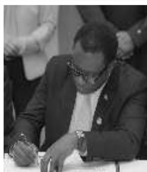
The first MoU, signed by Guyana's Minister of Foreign Affairs, Hugh Todd

The event, held at the prestigious summit, was attended by European Commission President Ursula von der Leyen, Barbados's Prime Minister and current CARICOM chair, Mia Mottley, and Prime Minister of Grenada, Dickon Mitchell.