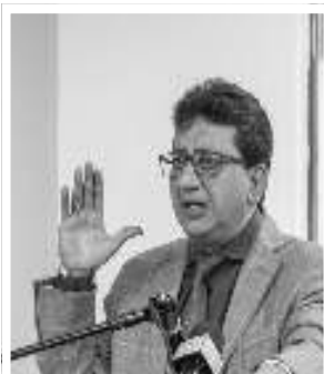
Attorney General and Minister of Legal Affairs, Mohabir Anil Nandlall, SC

The initiative, launched by Attorney General and Minister of Legal Affairs, Mohabir Anil Nandlall, SC, saw investigators, prosecutors, and other legal professionals