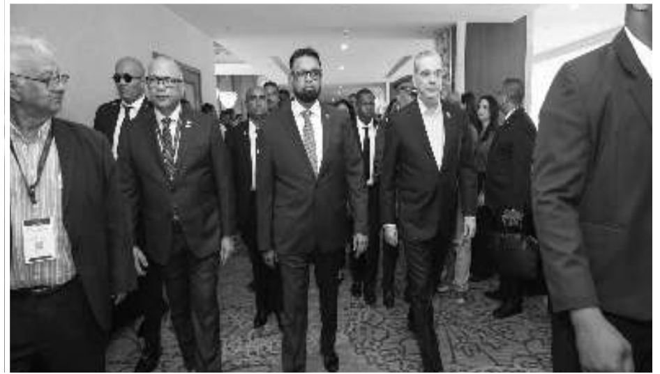
President Ali with Dominican Republic President Luis Abinader

with Guyana’s broader strategy to diversify its economy and promote sustainable tourism development. By partnering with a more established tourism