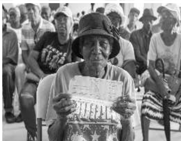
A recipient with their cash grant

Dr Jagdeo appealed to the public for cooperation, stressing that cheques will be available after verification and that large gatherings before cheque readiness only complicate matters. He also addressed misinformation circulating about cheque validity. The government clarified that the $100,000 cash grant cheques are valid for six months from the date of issuance, dispelling rumors of a shorter validity period. It was emphasised that there is no need to rush to banks, as cheques can be deposited at ATMs. Citizens were urged to disregard any misinformation and follow official guidelines for a smooth and orderly process, reiterating the government's focus on getting grants to eligible citizens quickly and efficiently.