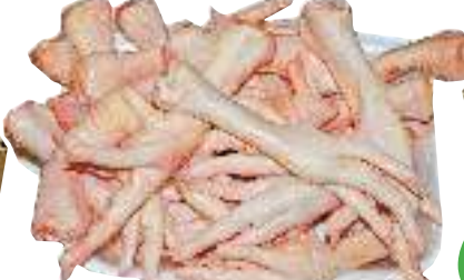
Fresh Large Chicken Feet