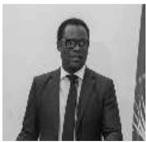
Minister of Foreign Affairs and International Cooperation Hugh Todd

Guyana has solidified its growing role in international affairs by hosting the annual Retreat of the African Member States Plus (A3 Plus) in the United Nations Security Council. The event, held at the Pegasus Suites and Corporate Centre in Kingston, Georgetown, marked a significant step in strengthening collaboration between African and Caribbean