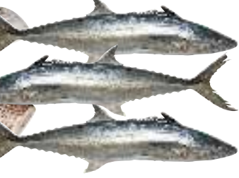
Frozen Whole King Fish