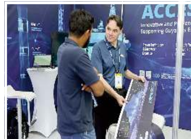
The 2025 Guyana Energy Conference and Supply Chain Expo

A key component of Guyana's sustainable growth strategy was highlighted at the conference with Dr. Jagdeo announcing that revenue from carbon credit sales will fund 1,700 social and economic projects in indigenous communities over the next two years. These projects aim to empower local