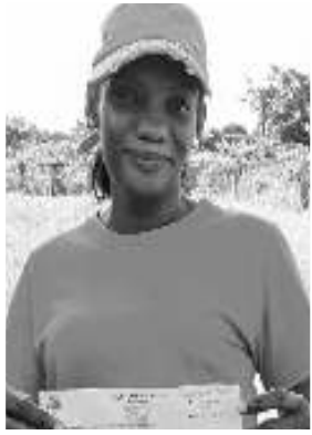
A recipient with their cash grant

Hundreds of thousands of Guyanese citizens have already received their $100,000 cash grant cheques, marking significant progress in the government's distribution programme. While acknowledging some remaining logistical challenges, Vice President Bharrat Jagdeo emphasised the scale of the operation and the positive impact the grants are having on families.