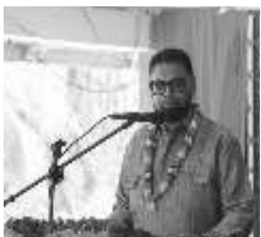
Scene from the Maha Shivaratri celebration at the Cove and John Ashram

President Dr. Mohamed Irfaan Ali emphasised the importance of unity and religious harmony during the Maha Shivaratri celebrations at the Cove and John Ashram. Addressing a large gathering of