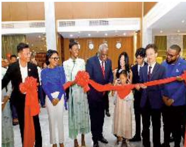
Prime Minister Brigadier (Ret'd) Mark Phillips officially opening the hotel with Minister of Tourism, Industry and Commerce, Oneidge Walrond

Minister of Tourism, Industry and Commerce, Oneidge Walrond presided over the opening ceremony, emphasising the government's commitment to expanding the country's room stock. Minister Walrond explained that increasing capacity is