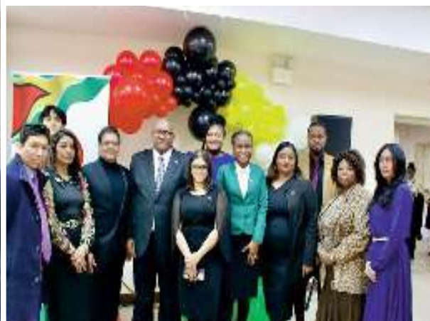
The reception to celebrate Guyana’s 55th Republic Anniversary in New York

day until March 1, showcasing the nation’s achievements to a global audience. Brotherson pointed to Guyana’s “extraordinary” economic trajectory, noting its position as one of the fastest-growing economies worldwide, driven largely by the oil