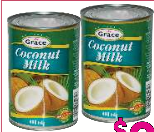
Grace Coconut Milk 400 ml

We're simply the best West Indian store in town.