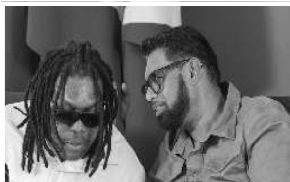
Vybz Kartel and President Dr. Irfaan Ali at State House

The gathering, which included a casual cooking