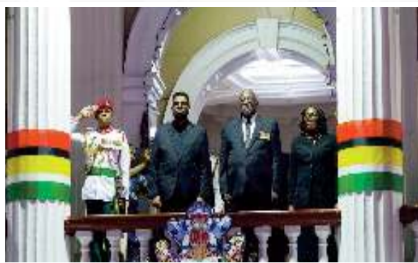
Scene from the 55th Republic Anniversary Flag Raising ceremony at Public Buildings in Georgetown

The President was joined by Prime Minister, Brigadier (Ret’d) Mark