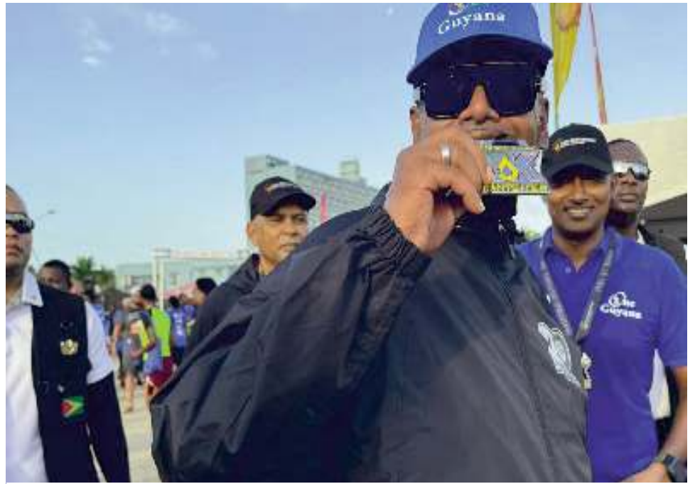
The Guyana Energy Conference and Supply Chain 5K Run 1