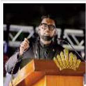
President Ali addressing the audience during the 55th Republic Anniversary ceremony

“Guyana’s best days are ahead,” declared President Dr. Mohamed Irfaan Ali as the nation celebrated its 55th Republic Anniversary on February 23. In a powerful address delivered on the lawns of Parliament Building on the eve of Republic, President Ali called for