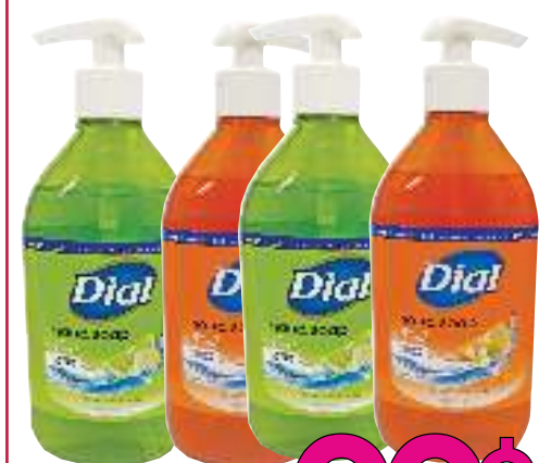
Dial Hand Soap 385 ml