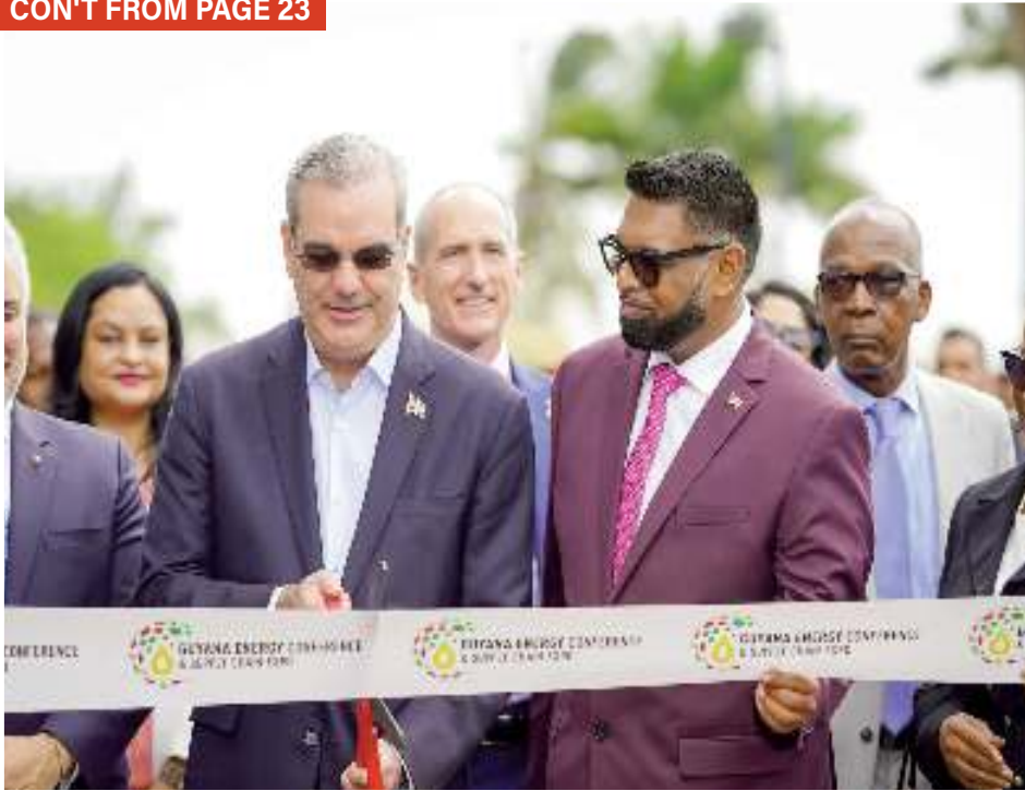
The 2025 Guyana Energy Conference and Supply Chain Expo

sinks. Dr. Jagdeo emphasised the government's commitment to balancing economic growth with environmental protection through the Low Carbon Development Strategy (LCDS). Guyana's successful carbon credit sales, including the world's largest carbon deal in 2022 valued at US$750 million, have been instrumental in supporting climate adaptation and community-driven