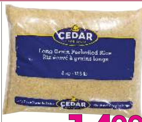
Cedar Parboiled Rice Product of USA 8 kg