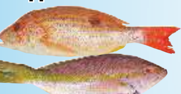
Fresh Lane or Yellow Tail Snappers 1/2-1 lb size