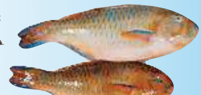
Fresh Parrot Fish