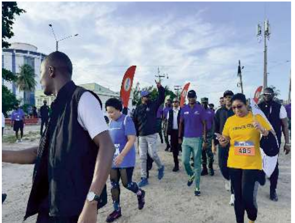
The Guyana Energy Conference and Supply Chain 5K Run

Energy Conference and Supply Chain Expo has cemented the country's position as a regional and global leader in energy, agriculture, and sustainable development.