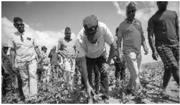
Government to support the expansion of red beans and black eyed peas production in the Berbice River

President Dr. Mohamed Irfaan Ali announced that the government will bring 1,000 acres of land into production before the end of 2025 to significantly expand the cultivation of red beans and black-eyed peas in the Berbice River region. This initiative aims to provide farmers with an additional income stream and boost national production of these important legumes.