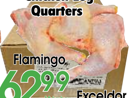
Fresh Chicken Leg Quarters

62.99 18 kg box 65.99 ≥ 18 kg box With Purchase of 2 cases or More Thursday To Sunday Only