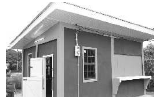
New meat centre opened in Citrus Grove

The facilities were officially commissioned by Minister of Housing and Water, Collin Croal, and Minister of Amerindian Affairs, Pauline Sukhai. Minister Croal praised the Citrus Grove Community Development Council (CDC) for their initiative and encouraged other communities to invest