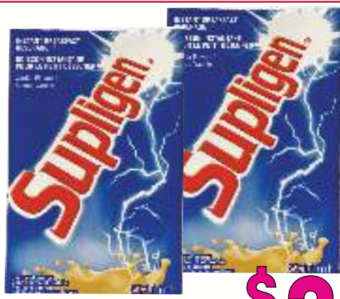
Supligen Instant Breakfast Beverage 250 ml