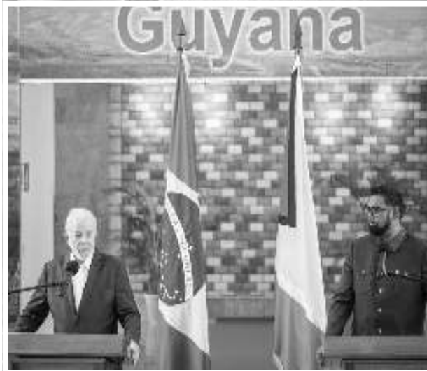
President Ali and President Lula during a discussion

The delegation will engage with key stakeholders in Boa Vista and Manaus, including state governors, industry federations, and trade authorities, to foster stronger partnerships