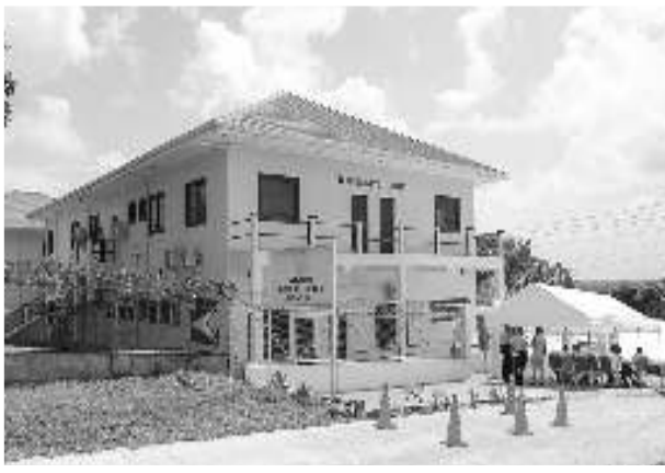
The new court