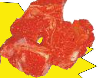
Salted Beef Short Ribs