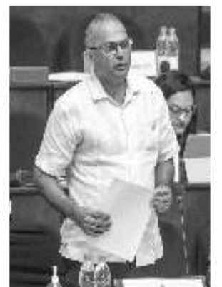
Minister of Health Dr. Frank Anthony

claims. He highlighted the significant increase in the number of medical practitioners, from 690 under the previous administration to 1,382 in 2023. He also provided details on the number of obstetrics and gynaecology specialists currently stationed at various hospitals, stating that the system now has more consultants and registrars. Further reinforcing the government's commitment, Dr. Anthony announced plans to add 18 more