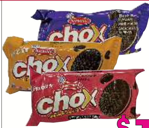
National Chox Sandwich Cookies assorted 36 g