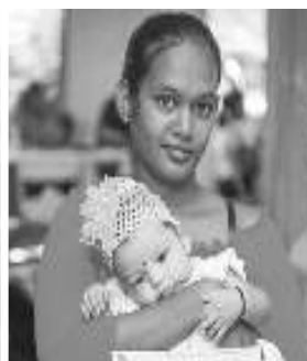
A recipient with their cash grant

verification before a cheque is printed, which has sometimes led to discrepancies between registrations and available cheques. This has caused delays, particularly in larger communities where news of the distribution has led to a surge in people arriving at distribution