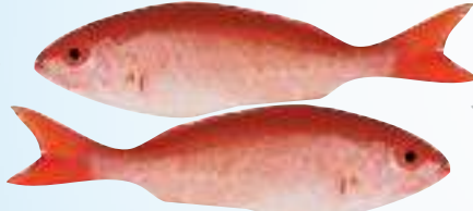
Fresh Florida Red Snappers