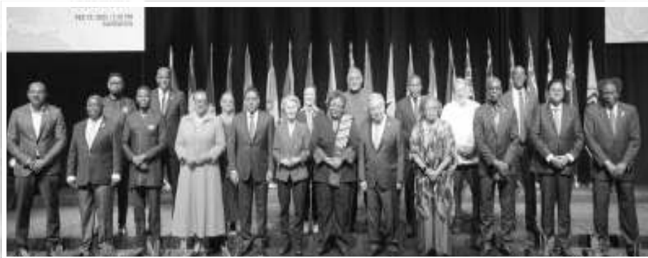
Caribbean leaders at a recent Heads of Government meeting in Barbados

"Heads of Government underscored that the convening of any