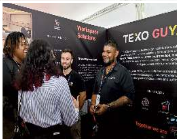
The 2025 Guyana Energy Conference and Supply Chain Expo

groundbreaking projects poised to reshape the nation's energy sector and drive broader economic growth throughout the region.