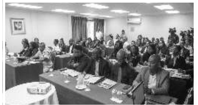
Stakeholders at the training

Minister Nandlall emphasised the importance of the training in ensuring legal professionals are prepared to implement the new Act effectively. He highlighted that these two pieces of legislation are at the