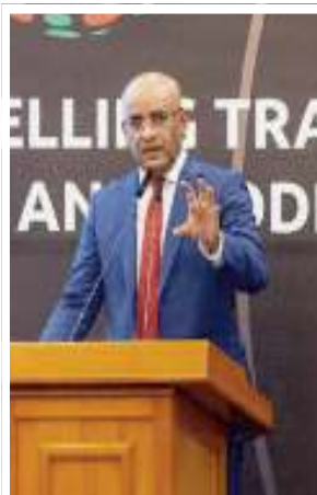
Vice President Dr Bharrat Jagdeo

network, stimulating growth in maritime, transport, and logistics sectors. The government is also exploring a