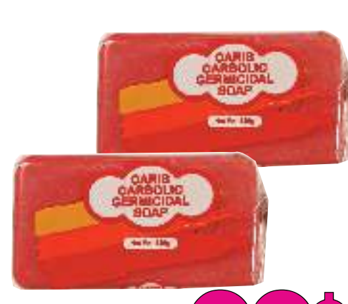
Carib Original Carbolic Soap 125 g