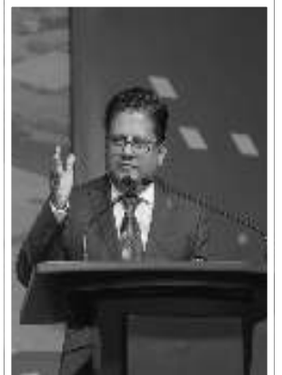
Senior Minister in the Office of the President with Responsibility for Finance and the Public Service Dr. Ashni Singh

Within the oil and gas sector, which is a significant contributor to the country's economic boom, Dr. Singh highlighted the local content legislation, which encourages joint ventures and partnerships with local companies and nationals. He concluded his address with a powerful call to