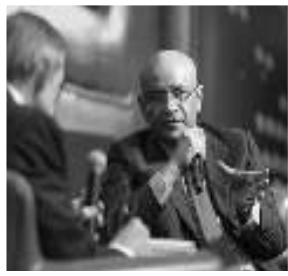
Vice President, Dr Bharrat Jagdeo

Vice President Dr. Bharrat Jagdeo has expressed unwavering confidence in Guyana's political stability ahead of the 2025 General and Regional Elections, firmly rejecting international narratives that suggest the country is prone to instability.