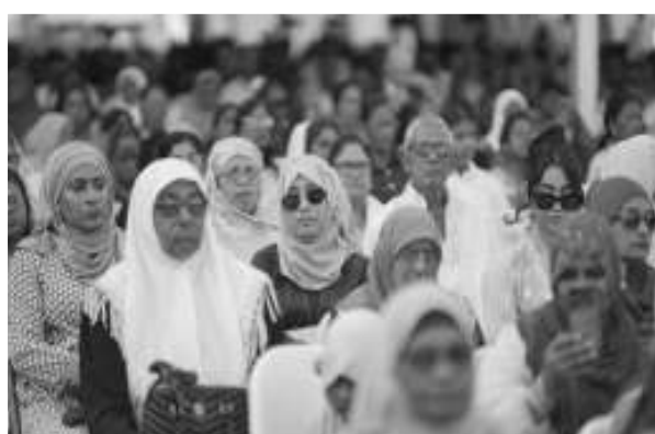
Scene from the event

the month. In his remarks, President Ali celebrated the diverse cultural makeup of Guyana, praising the nation's ability to unite different communities. "We are placed here for a specific purpose, and just maybe that purpose is to demonstrate to a