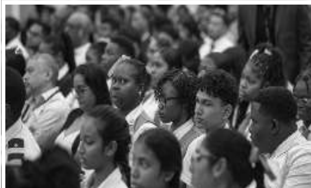
Scores of youths convened at the Guyana Marriott Hotel to engage Vice President, Dr Bharrat Jagdeo on the government's policies in the oil and gas

equipping young people with the skills they need to thrive in a modern economy. "There is no restriction