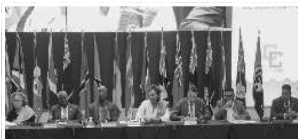
President Ali, along with other regional leaders, participating in the closing press conference at the 48th Regular Meeting of Heads of Government of CARICOM

President Irfaan Ali held high-level bilateral talks with European and Saudi Arabian leaders during the 48th Regular Meeting of the Conference of Heads of Government of CARICOM, held in Barbados from February 19-21. The discussions focused on strengthening partnerships and advancing cooperation in key areas such as carbon credits, trade, education, and regional