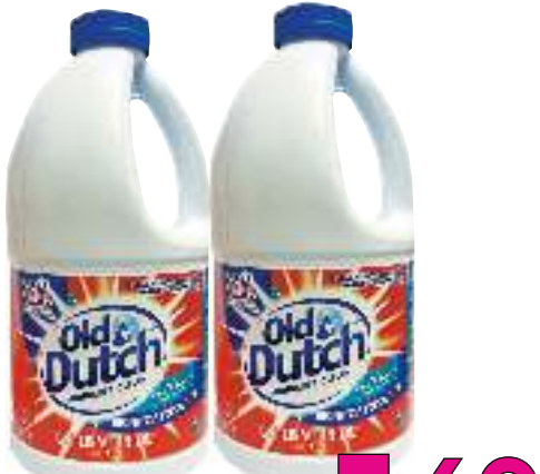
Old Dutch Liquid Bleach 1.27 L