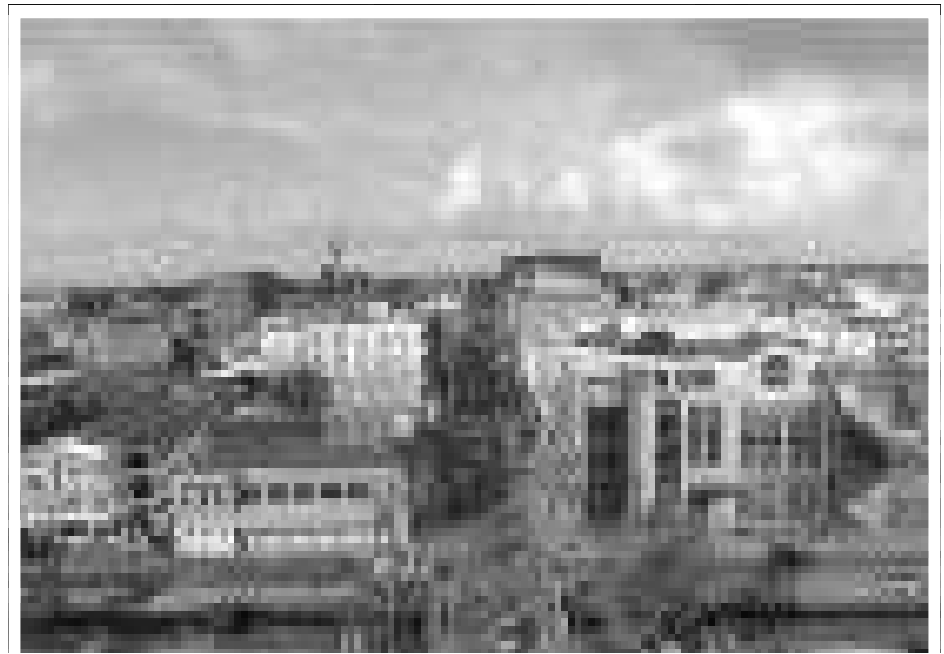
Properties in Georgetown

In a final warning, Dr. Jagdeo denounced plans for private negotiations between the Mayor and taxpayers over unpaid taxes, calling it a "recipe