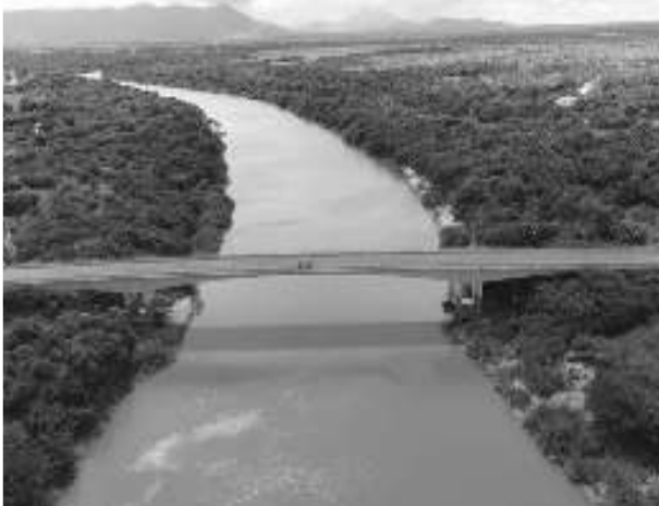
Completed in 2009, the Takutu River Bridge is a bridge across the Takutu River, linking Lethem in Guyana to Bonfim in Brazil

A proposed railway linking Guyana’s coast to the town of Lethem and onward to Brazil has the