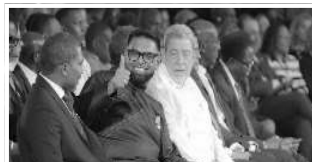
President Ali attending of the CARICOM Heads of Government meeting

critical regional issues, including the free movement of people, trade barriers, regional transportation, food and energy security, and upcoming elections. President Ali emphasised the urgency