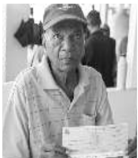
A recipient with their cash grant

of thousands" have benefited, he stated. He acknowledged, however, that the distribution process has encountered some obstacles.