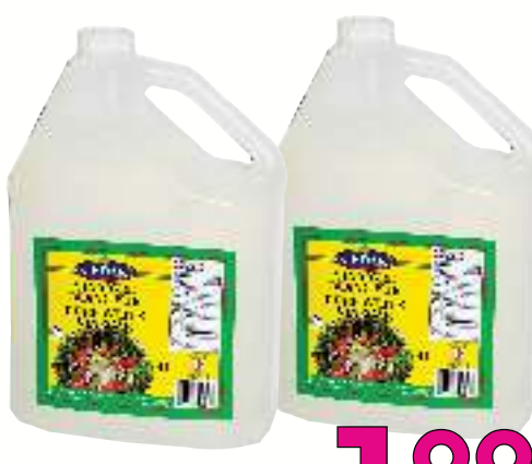
Cedar Pure White Vinegar 4 L