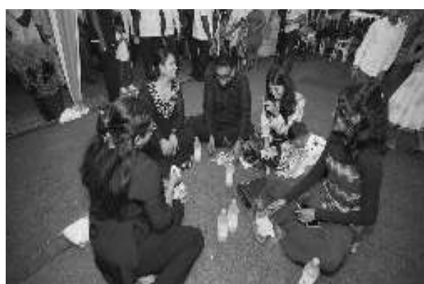
Scene from the event

The president also reaffirmed his government's commitment to uplifting people's living standards, ensuring the dignity of the elderly, and safeguarding the future of children.