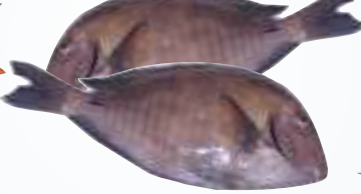
Fresh Doctor Fish 3/4-1 lb