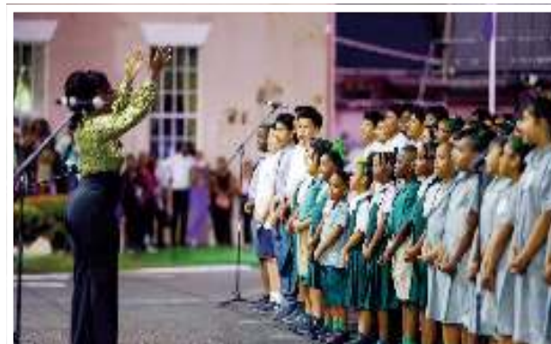
Scene from the 55th Republic Anniversary Flag Raising ceremony at Public Buildings in Georgetown

The President also showcased advancements in energy and technology, such as the installation of 30,000 solar home systems in remote to approximately 20,000 citizens. He also highlighted significant investments in healthcare and education, including training for over 3,000 health workers and the construction of new schools. President Ali reiterated the government’s commitment to strengthening systems, improving transparency and accountability, and investing in technology to support effective and responsible policing. He emphasised the importance of a secure and hospitable environment for all Guyanese.