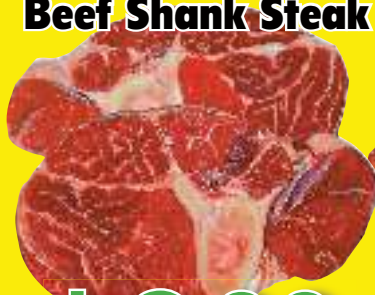
Fresh or Frozen Centre Cut Beef Shank Steak