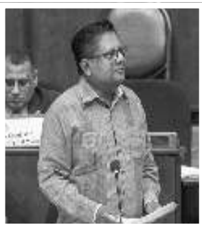
Senior Minister of Finance Dr. Ashni Singh piloted the bill

Senior Minister of Finance Dr. Ashni Singh piloted the bill, emphasising its importance in strengthening the legal and regulatory framework. He explained that these representative offices will bring valuable international experience and cutting-edge technology to Guyana, showcasing a wider range of financial