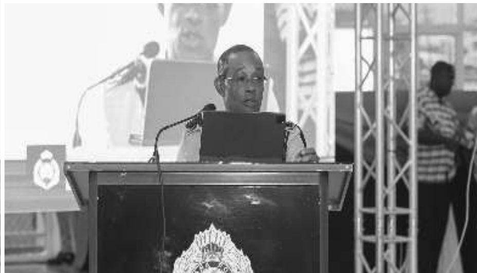
Commissioner of Police Clifton Hicken delivering remarks

The establishment of an AI unit demonstrates the GPF's proactive approach to leveraging technological advancements for improved policing. These