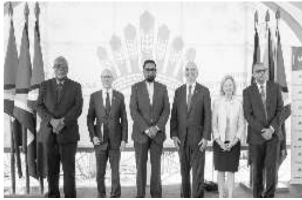
In 2022, President Ali launched a national healthcare initiative with Mount Sinai and Hess to improve healthcare quality and access

"We're not only looking at diagnostics, but building facilities for treatment," President