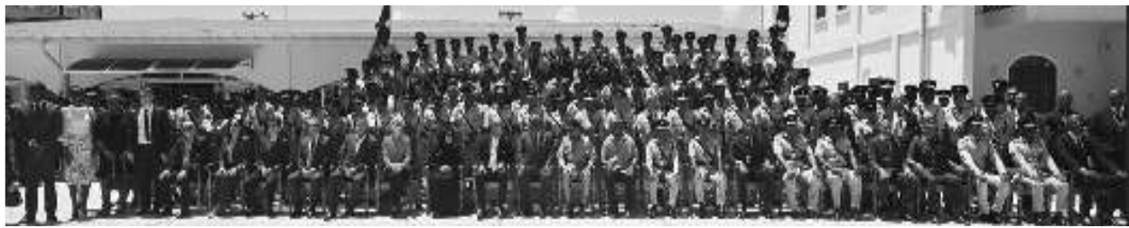
President Ali along with senior officers of the Guyana Police Force

The government is launching a major technological overhaul of its crime prevention strategy, injecting significant investment into the Guyana Police Force (GPF).