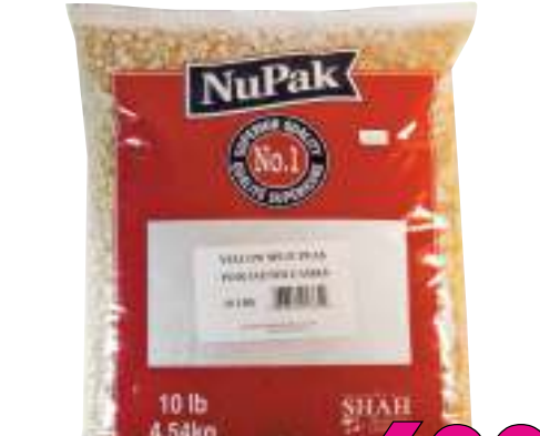
Nupak Yellow Split Peas 10 lb