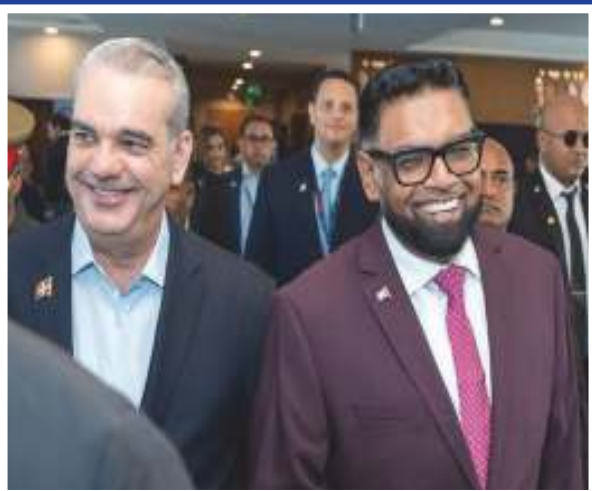
DOMINICAN REPUBLIC PRESIDENT APPLAUDS GUYANA'S GROWTH