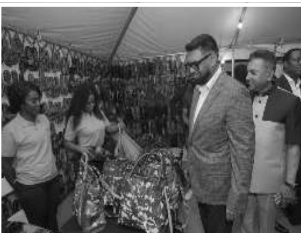
Guyanese entrepreneurs and businesses showcasing their products at the expo

Guyanese businesses made significant impact at the Barbados Agro-