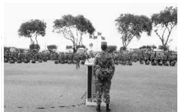
GDF officers promoted