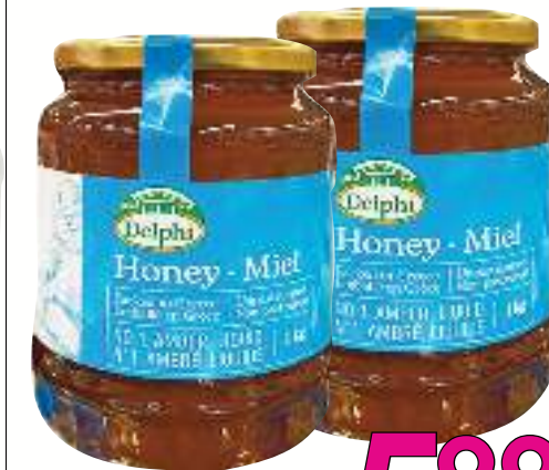
Delphi Honey 1 kg