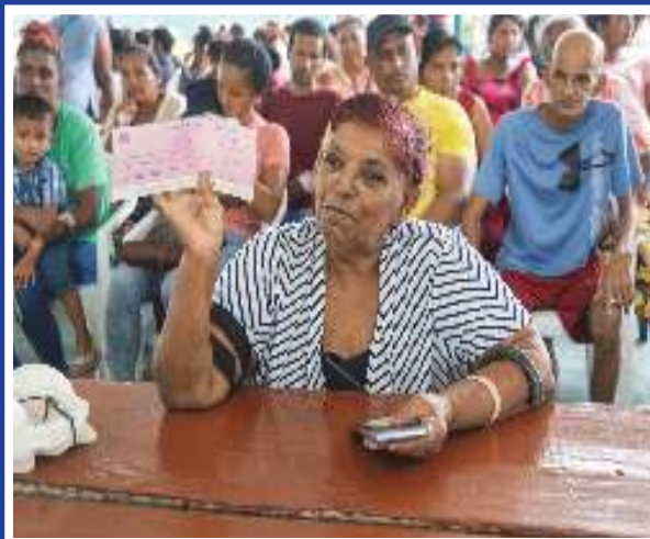
100K CASH GRANT DISTRIBUTION UNDERWAY ACROSS SEVERAL REGIONS