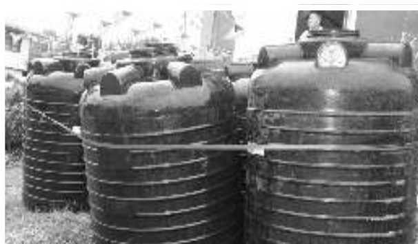
Five 450-gallon water tanks were also distributed to the community

a laundromat will be opened in Citrus Grove this year, further expanding services available to residents and visitors. In addition, five 450-gallon water tanks were distributed to the community to improve access to a consistent water supply.