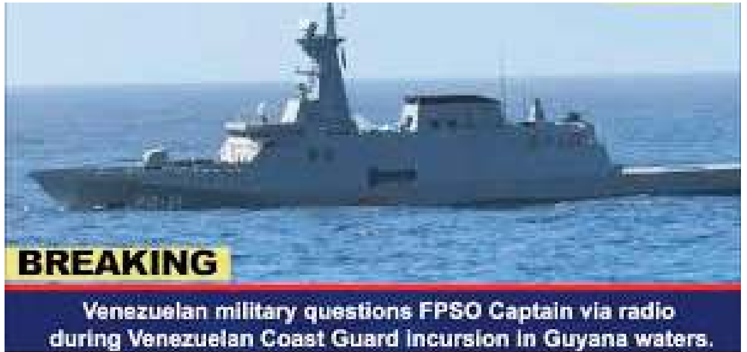
The Venezuelan vessel that threatened a Guyanese FPSO in the Stabroek Block on March 1