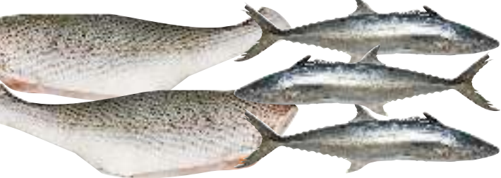
Frozen Headless Bangamary