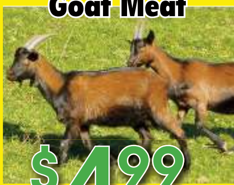
Grown From Australia Free Range Goat Meat