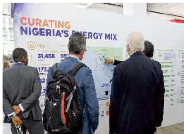
The 2025 Guyana Energy Conference and Supply Chain Expo

The development includes storage facilities and a regional fuel supply