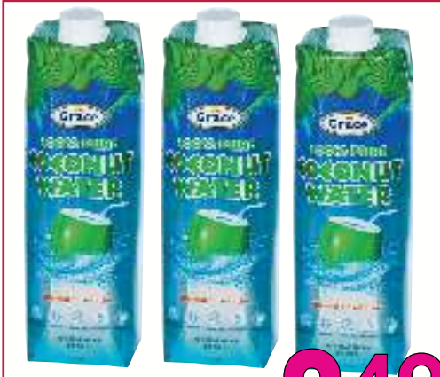
Grace 100% Coconut Water 1 L