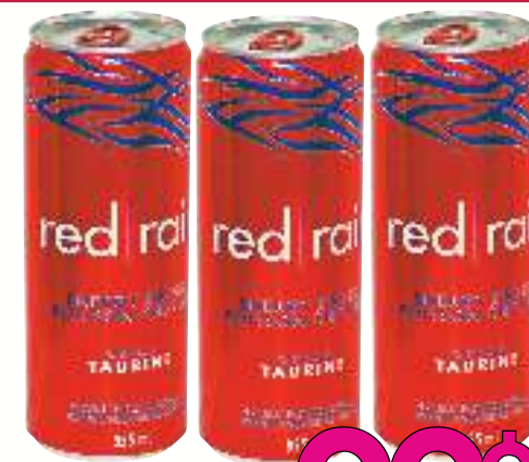
Red Rain Energy Drink 355 ml