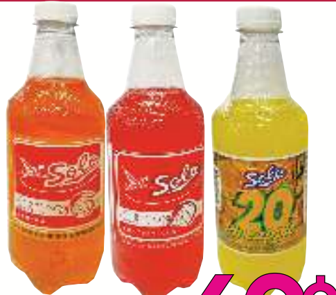
Solo Carbonated Beverage assorted 590 ml