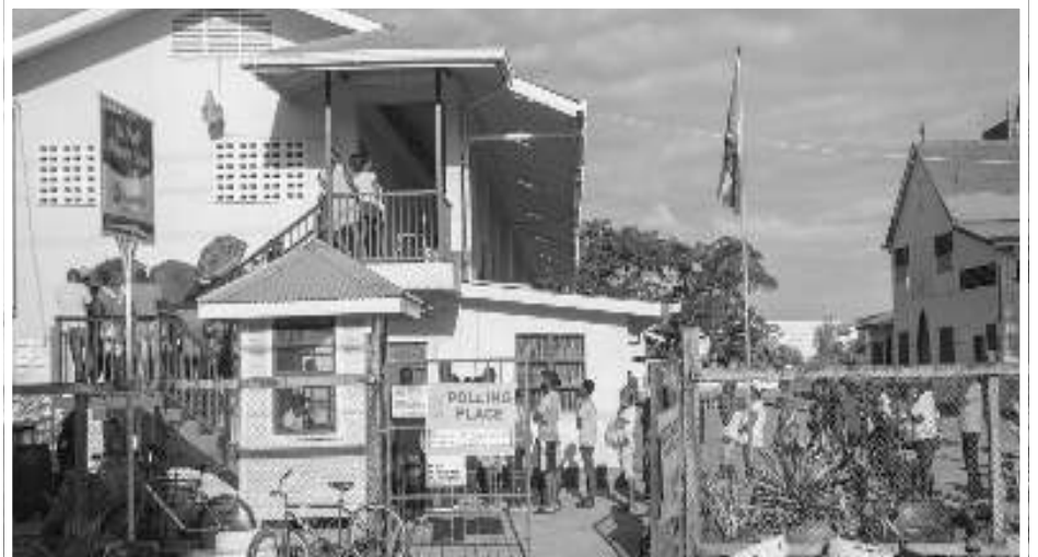
General and Regional Elections are due this year

external fears of instability. "We've achieved significant progress