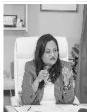
Minister of Human Services and Social Security, Dr. Vindhya Persaud

The RRT is scheduled to be launched by mid-April 2025 and will initially be piloted in