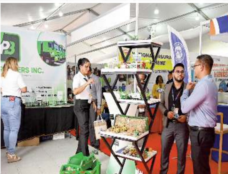
The 2025 Guyana Energy Conference and Supply Chain Expo

development. The government is also investing heavily in renewable energy, including solar, wind, hydro, and gas-to-energy projects, to diversify its energy mix and reduce reliance on fossil fuels.