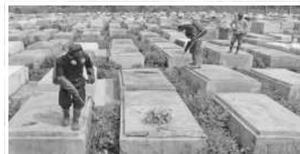
Plans on stream for cemetery upgrades nationwide

Minister Edghill reminded the Assembly that the Georgetown Mayor and City Council (M&CC) is legally responsible for the