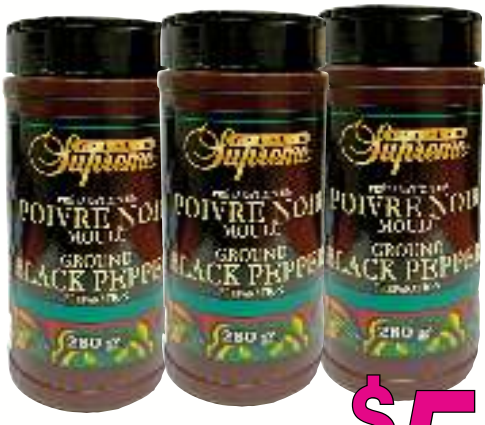
Club Supreme Ground Black Pepper 280 g