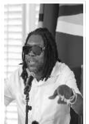
A recipient with tVybz Kartel at State House

Alongside President Ali, the event was attended by Minister of Tourism, Industry and Commerce Oneidge Walrond and Minister