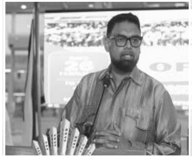
President Ali delivering the feature address at the Police Officers' Conference 2025

immigration and reducing human error. The GPF will also implement a GPS tracking system for its new fleet of vehicles, ensuring accountability and responsiveness. Furthermore, 400 intelligence video camera systems have been deployed nationwide, with 320 more planned for this