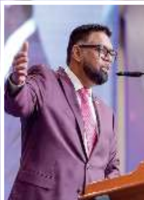
President Ali addressing the opening of the 2025 Guyana Energy Conference and Supply Chain Expo at the Guyana Marriott Hotel

A HUB OF MULTIMILLION-DOLLAR INVESTMENTS AND REGIONAL COLLABORATION