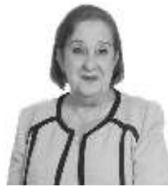
Minister of Parliamentary Affairs and Governance, Gail Teixeira, addressed the limitations of the CPI.

Adding to the debate, Minister of Parliamentary Affairs and Governance, Gail Teixeira, addressed the limitations of the CPI. She emphasised that it's a perception-based index. "The CPI is not an empirical or scientific measure of corruption levels," Teixeira stated, clarifying that it reflects public perceptions of