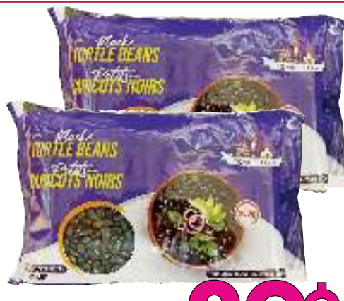
Somis Farm Black Turtle Beans 900 g