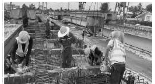
Construction ongoing on the bridge

Upon completion, the new Demerara River Bridge is expected to significantly improve connectivity for thousands of commuters. The bridge promises to deliver cost and time savings, while also reducing waiting times for maritime traffic navigating the Demerara River. The