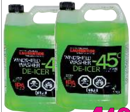
Laurentide Windshield Washer -45 3,78 lt