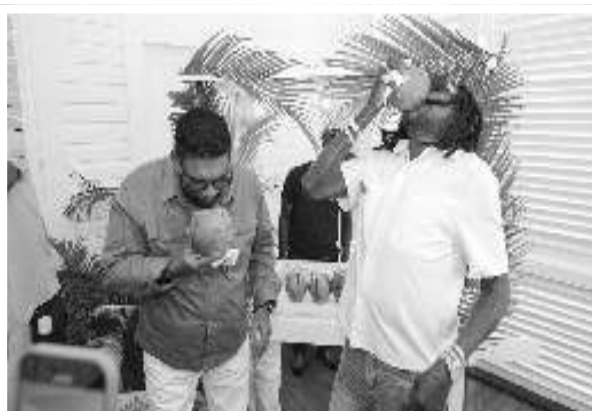
Vybz Kartel and President Dr. Irfaan Ali at State House

"The Government of Guyana will back it 100%."