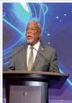
Prime Minister, Brigadier (Ret'd), Mark Phillips

HUB President Irfaan Ali announced a major