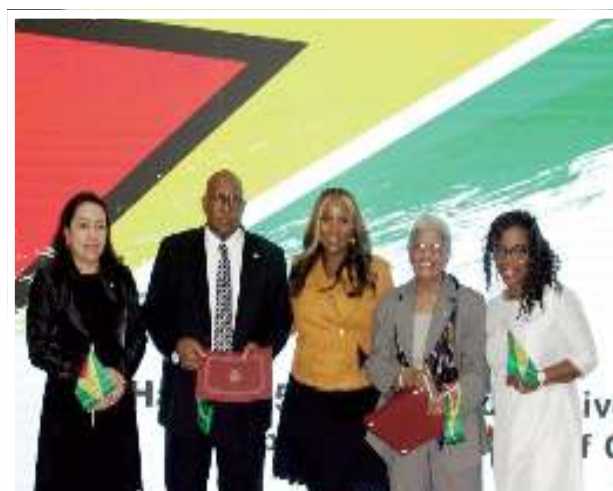
The reception to celebrate Guyana’s 55th Republic Anniversary in New York

and gas sector. He emphasised the government’s strategic investments in diversifying the non-oil economy for sustainable growth. He also highlighted President Ali’s “Vision 25 by 2025” initiative,