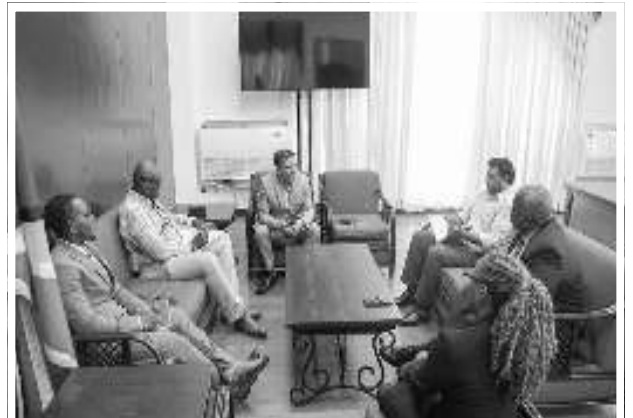
General Secretary of the People's Progressive Party (PPP), Dr. Bharrat Jagdeo

affected customers to submit formal complaints to the Public