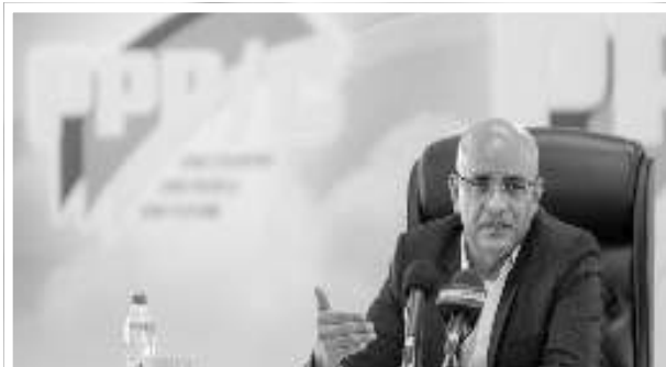
General Secretary of the People's Progressive Party (PPP), Dr. Bharrat Jagdeo

Dr Jagdeo also pointed to the silence of prominent social organisations, including Transparency Institute Guyana Inc. (TIGI) and Red Thread, questioning why they