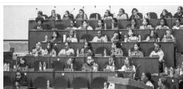
Nearly 300 companies educated on Guyana's labour laws

said, "Stuff that you didn't know you can gain more knowledge about and you can improve in your working environment...to be very honest, I knew a little and now today,