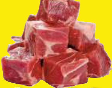
Frozen Square Cut Mutton Leg Meat