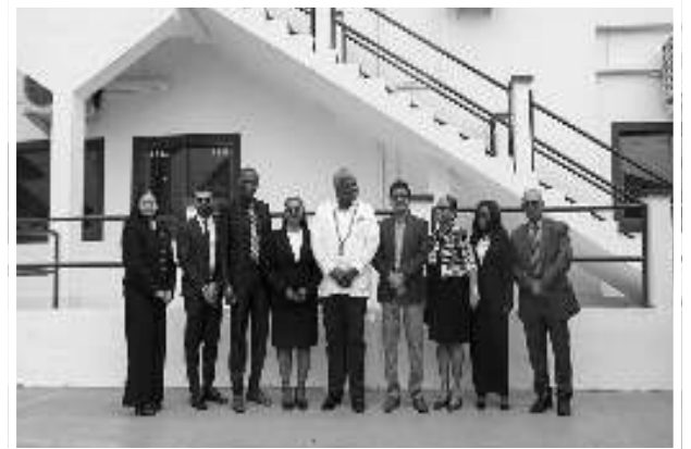
Officials at the opening of the new Mabaruma Magistrate's Court

Minister Nandlall emphasised that the new court meets international standards, featuring modern amenities such as audio/visual recording and virtual hearing capabilities. He also noted investments in software for electronic litigation and recent legislative advancements like the Criminal Procedure (Plea Discussion,