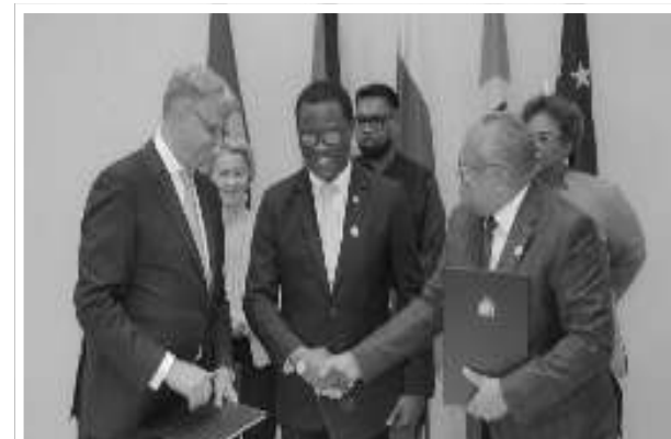
President Ali oversaw the execution of two significant Memoranda of Understanding (MoUs) on the sidelines of the meeting

During the signing ceremony, President Ali, President von der Leyen, Prime Minister Mottley, and Prime Minister Mitchell emphasised the significance of these agreements in advancing regional cooperation. They underscored