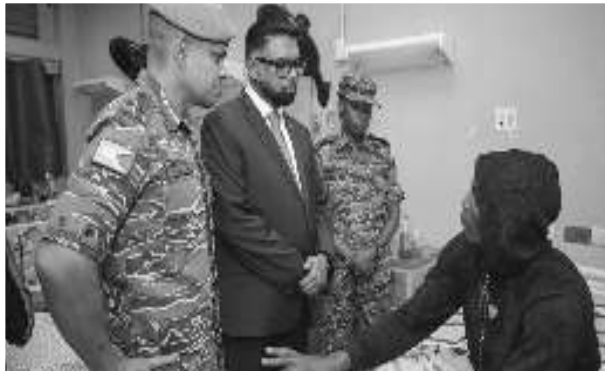
President Ali visiting the injured Guyana Defence Force soldiers