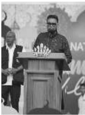
Scene from the event

President Dr. Mohamed Irfaan Ali has called Ramadan a time of mercy, blessings, and justice, emphasizing its role in promoting reflection, empathy, and unity. Speaking at the launch of the National Ramadan Village, he drew from the teachings of the Holy Quran to highlight the values of righteousness and justice during the holy month.