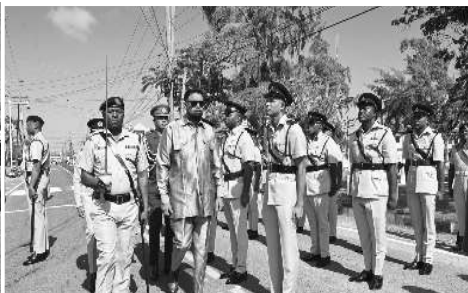
The promotions encompass a wide range of ranks

Approved by the Police Service Commission, the promotions encompass a wide range of ranks, from Assistant Superintendent to Senior Superintendent, with several officers ascending to the highly regarded position of Assistant Commissioner.