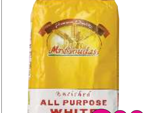
Mr Goudas All Purpose Flour 8 kg