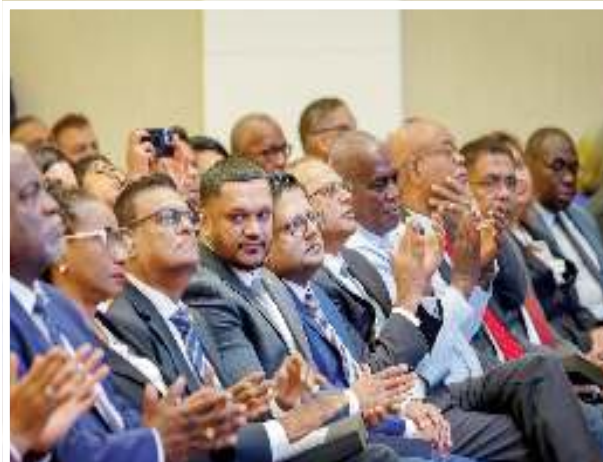
The 2025 Guyana Energy Conference and Supply Chain Expo

emphasised that global demand for fossil fuels would remain strong,