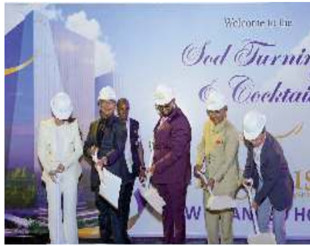
The break grounding for a new 13-storey internationally branded five-star hotel in the Pegasus compound

The new 13-storey hotel is set to be a key