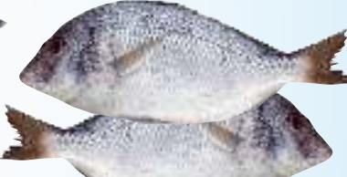
Fresh Porgy Fish