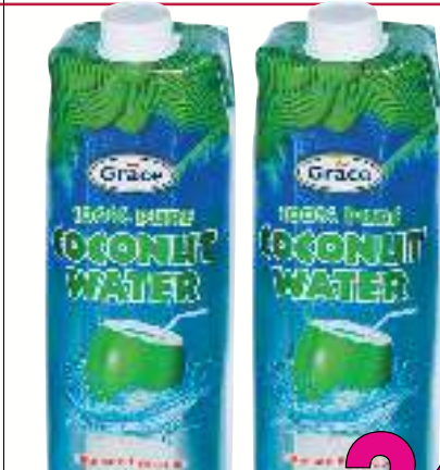
Grace 100% Coconut Water 1 L