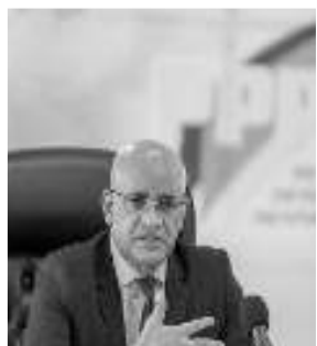
General Secretary of the People's Progressive Party, Dr Bharrat Jagdeo

Export-Import (EXIM) Bank has granted final approval for a $526 million loan to support Guyana's transformative Gas-to-Energy (GtE) Project. President Dr. Mohamed Irfaan Ali received confirmation of the decision on December 26 during a phone call with EXIM Bank President and Chair, Ms. Reta Jo Lewis.