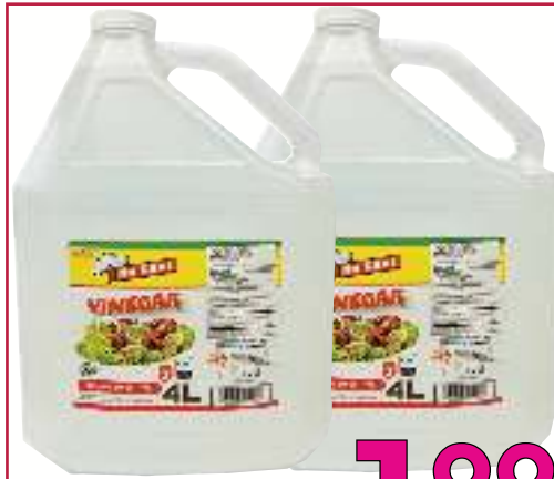
Nu Chef Vinegar 4 L