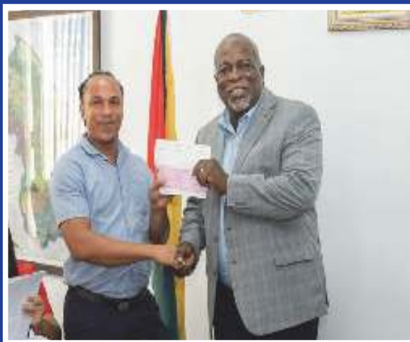
PUBLIC SERVANTS AND PENSIONERS RECEIVE $100,000 CASH GRANT NATIONWIDE