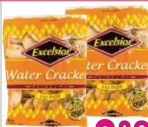
Excelsior Cinnamon Water Crackers 356 g