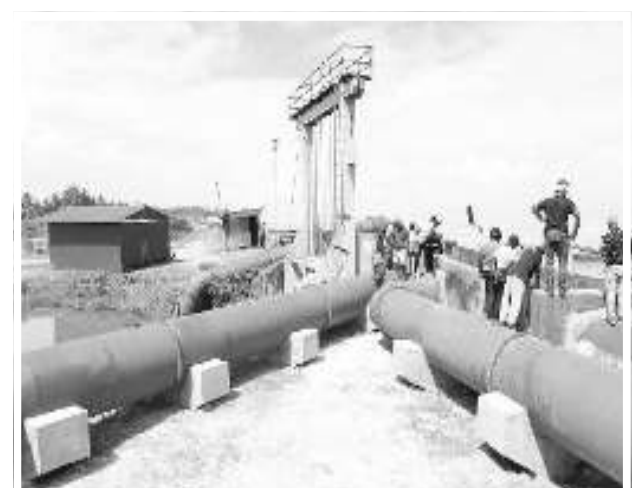
The commissioning of the pump

up of water in this region when rain falls, however, with a caring government and a sector like the Ministry of Agriculture, we can proudly say that we are catered for and farmers are now in a better position," she noted.