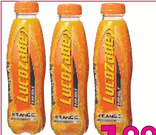
Lucozade Energy Glucose Drink Orange Only 380 ml