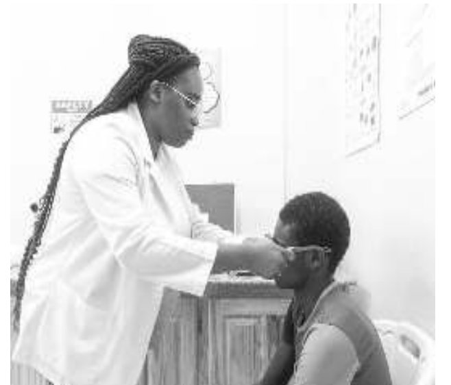
Health screening programme expanding to secondary schools

US$22 million grant programmes for to enhance pandemic recreation and preparedness, with education. initiatives such as: Digital literacy