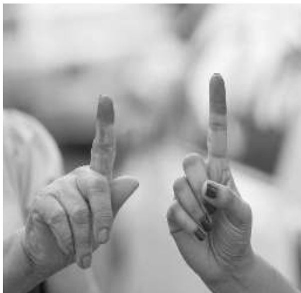
The next elections slated for 2025

"In an election year, I expect GECOM will require additional resources, and the budget will fully address those needs. I am confident GECOM is already