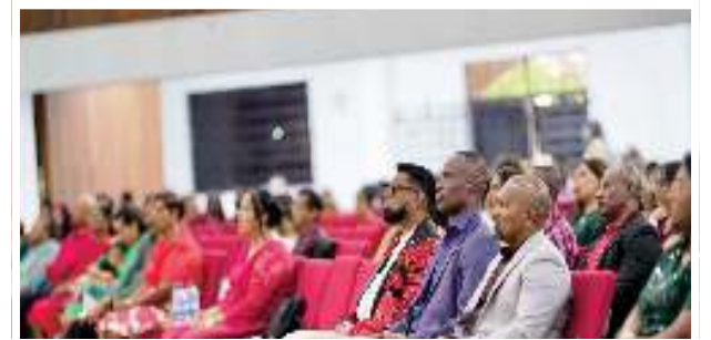
Christmas Day Service at the Lifespring Ministry in Chateau Margot on the East Coast of Demerara

The president's message underscored his administration's ongoing work to promote unity, equality, and a brighter future for every Guyanese family.