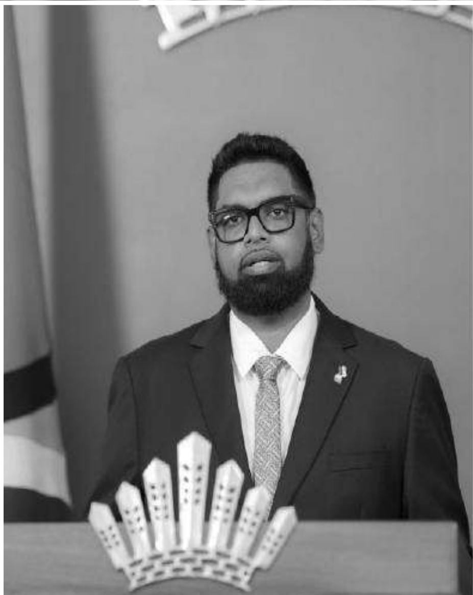
President Dr Mohamed Irfaan Ali making the New Year address

In his New Year's address, President Dr Mohamed Irfaan Ali heralded 2025 as a landmark year for Guyana, unveiling ambitious plans to transform lives and strengthen the nation's global standing. With bold initiatives in education, healthcare, infrastructure, and economic empowerment, the President vowed to deliver tangible benefits to every citizen while safeguarding democracy and sovereignty. "This is no ordinary year," he declared, promising unprecedented progress and opportunity as Guyana enters one of the most transformative periods in its history.