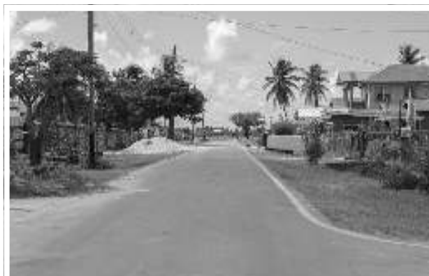
Road in Region Two

while most roads in populated areas have been addressed, several significant projects remain.