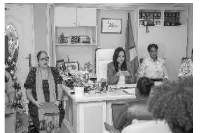
Minister of Human Services and Social Security, Dr Vindhya Persaud at the Ministry's year-end press conference

Restored water and electricity subsidies. Weekly community