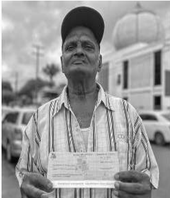
Pensioners countrywide celebrate new year with their government cash grant 2

This initiative underscores the government's commitment to improving the lives of