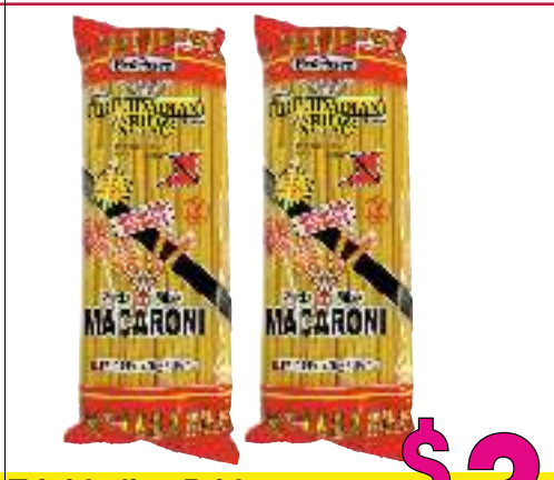
Trinidadian Pride Macaroni 400 g