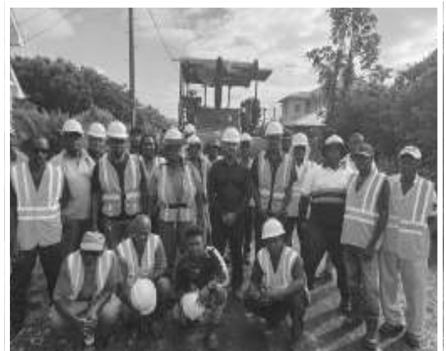
The Ministry of Public Works' Special Projects Unit

the government's commitment to enhancing infrastructure nationwide.