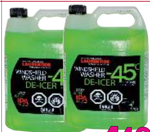
Laurentide Windshield Washer -45 3,78 lt