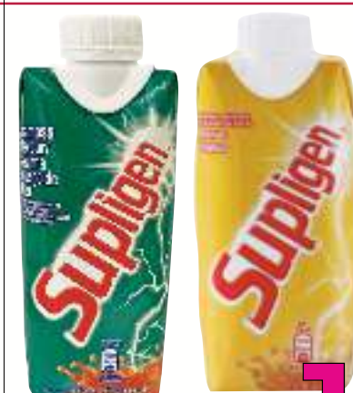
Supligen Meal Supplement Peanut or Seamoss Flavour 330 ml