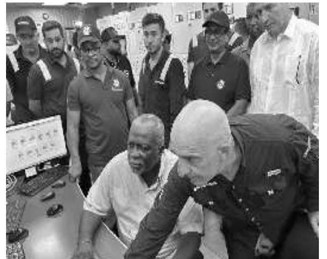
Prime Minister, Brigadier R'td, Mark Phillips on a site visit to GPLs New Georgetown Substation and the Power Ship

transformative projects on the horizon, the government is laying the foundation for a modern, reliable, and affordable energy grid. This effort is critical for supporting Guyana's growing economy, ensuring that the nation's future energy needs are met sustainably while