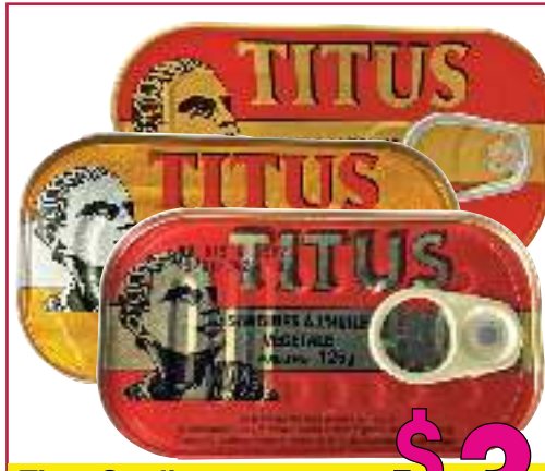
Titus Sardine In Soya Oil Assorted 125 g