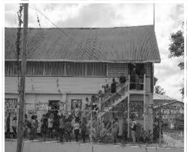
Guyana's last General and Regional Elections, held on March 2, 2020

Through these efforts, President Ali reaffirms his administration's steadfast dedication to democracy and development, signalling