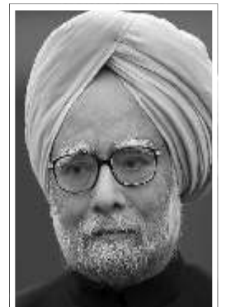
India's former Prime Minister Manmohan Singh

for their contributions to the global pursuit of democracy, development, and peace.