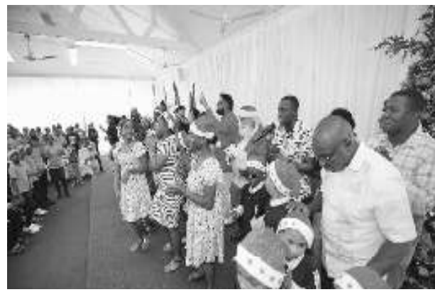
Scene from the annual children Christmas social at State House

a priority on our calendar," he shared. "We find the greatest joy in sharing this occasion with you, and I want you to know that this is your home too. We are all together, united as