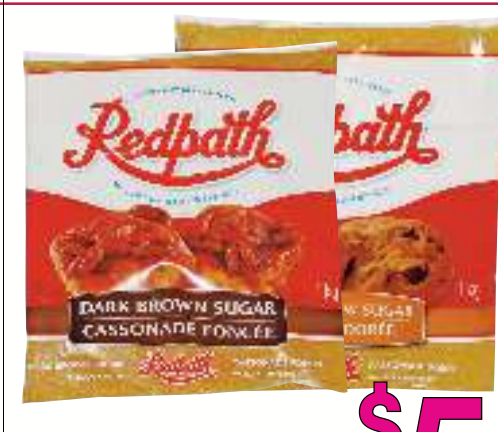
Redpath Golden Yellow or Dark Brown Sugar 1 kg