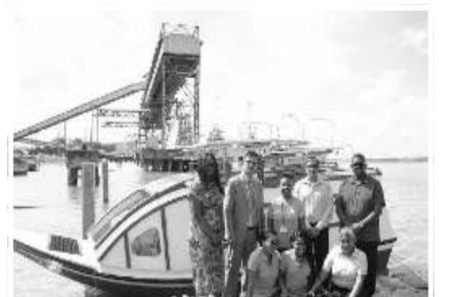
The handover of the maternal boats