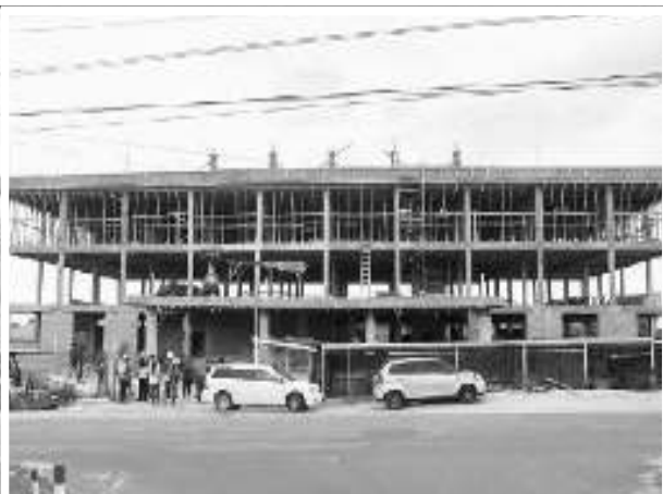
Ongoing works at the CJIA

"This building must be operational by June 30, 2025," the minister declared. "If we see signs by