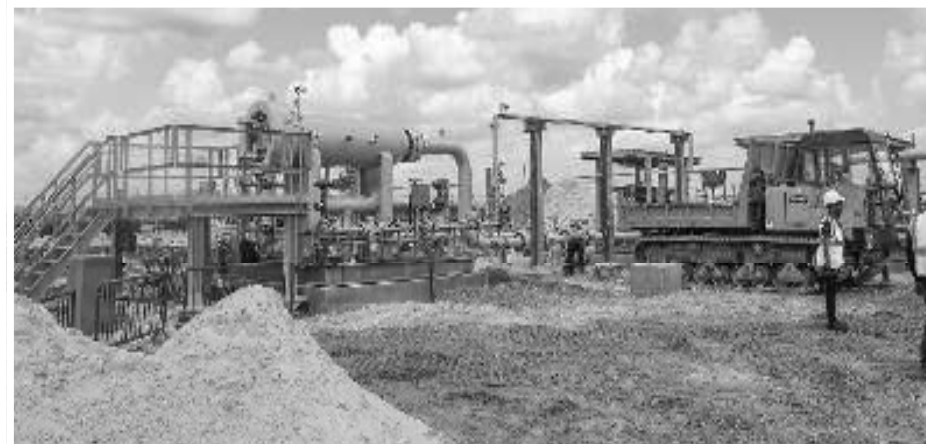
The Gas-to-Energy project at the Wales site

A centerpiece of the project is the construction of an integrated gas processing facility at Wales, West Bank Demerara, in Region Three. Natural gas will be transported from the Stabroek Block's Liza oilfield offshore, marking a significant milestone