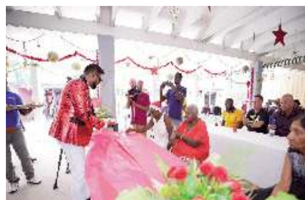
President Ali with residents of the Dharm Shala (Home of Benevolence for all races) in Albouystown.