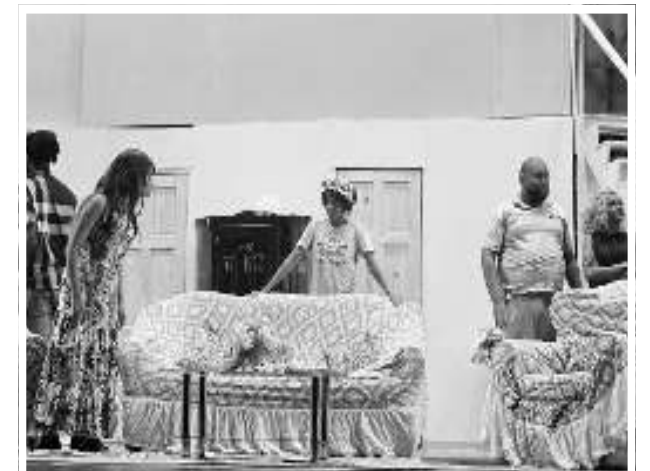
Play Requiem for the Living was a hit