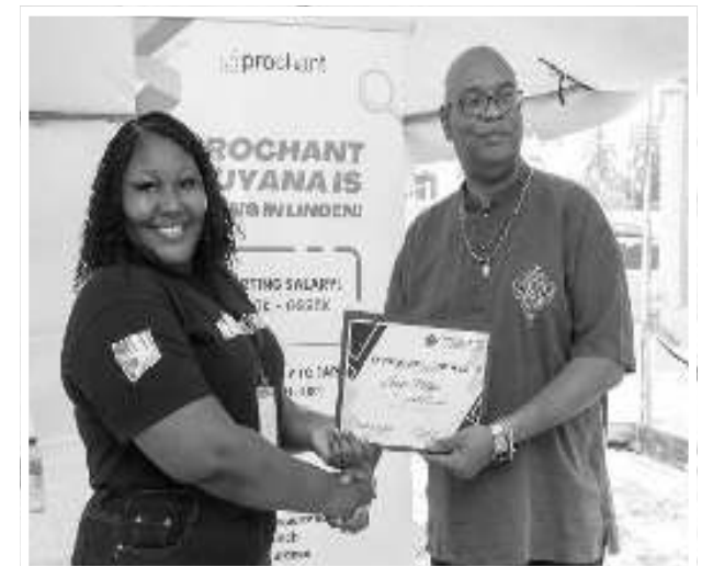
Minister of Public Works, Bishop Juan Edghill handing over a certificate to one of the graduates

This successful graduation signifies a new chapter for Linden, positioning the town as a hub for highly skilled BPO professionals. As Prochant continues to invest in the region, this programme is expected to create sustainable