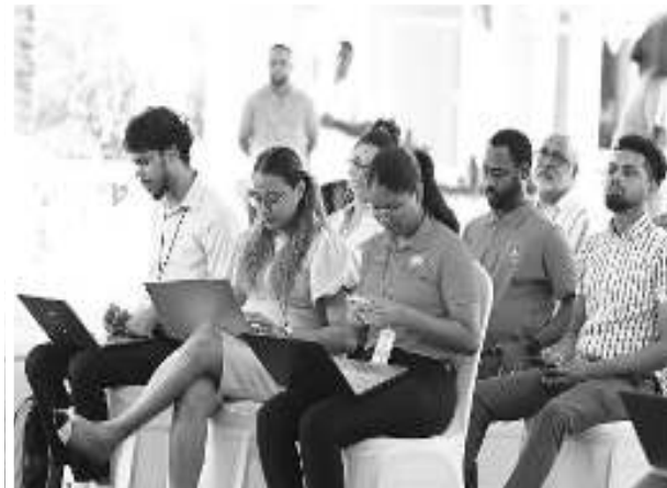
Media personnel at the end-of-year press conference at State House

"We are determined to build a future where every citizen benefits from the nation's growth. There is no room for failure in achieving this vision," he stated.