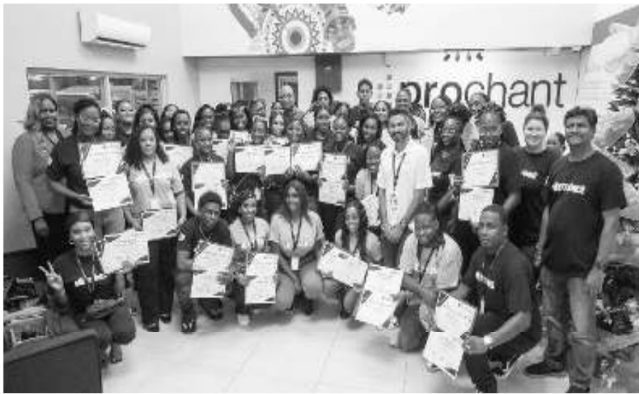
Prochant certifies first batch of patient interaction specialists in Linden