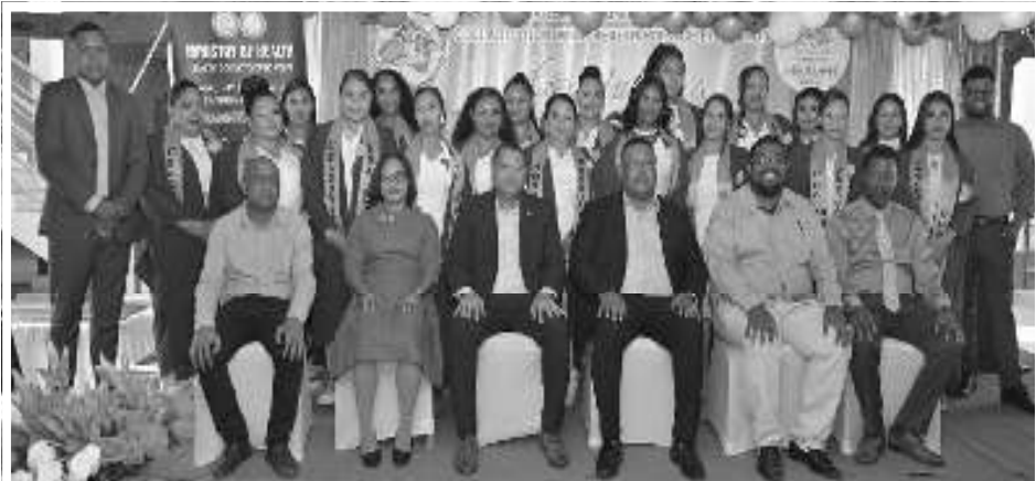
84 new healthcare professionals added to Region One's healthcare workforce

The healthcare workforce in Regions One and Two has received a significant boost with the graduation of 175 new healthcare professionals, a testament to the government's commitment to enhancing healthcare services across Guyana's hinterland communities.