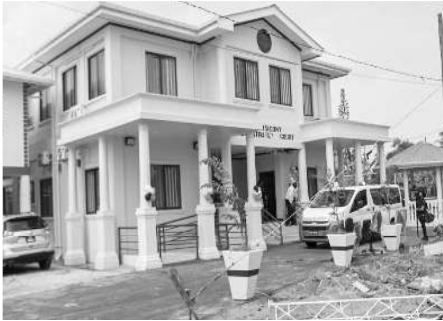
The Mahaicony Magistrate's Court

poor condition. "This new facility signifies a remarkable transformation in our legal