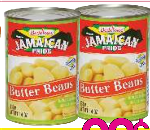
Jamaican Pride Butter Bean 398 ml