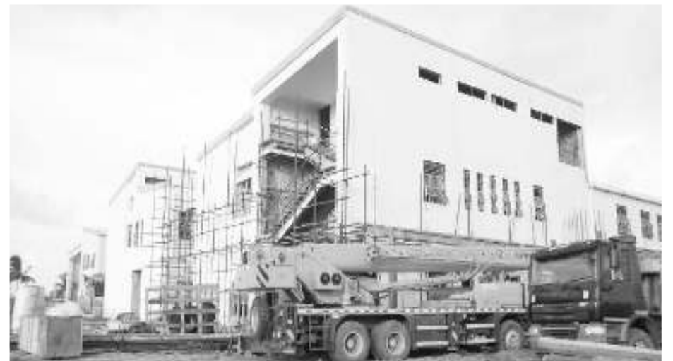
Regional hospitals, telemedicine, and nursing schools to improve access and quality.

We are building a One Guyana that is both democratic and