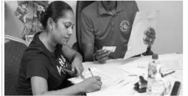
Contract signing for drainage and irrigation work in Region Two

for small contractors to showcase their skills and contribute meaningfully to their communities.