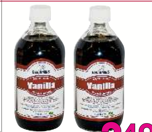
Benjamin's Vanilla Flavoring 480 ml