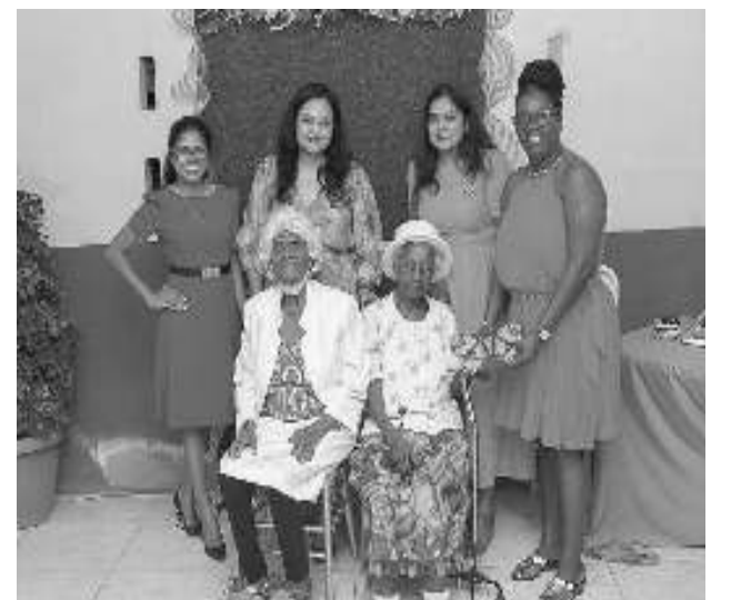
Minister of Human Services and Social Security, Dr Vindhya Persaud with senior citizens

The Ministry of Human Services and Social Security is making bold strides toward a prosperous and self-sufficient future. With continued investments and innovative strategies, the nation is well-positioned for transformational growth.