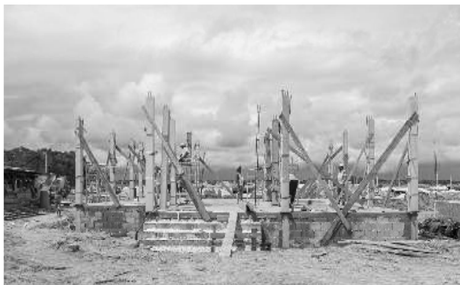
Progress on house lot distribution and homeownership initiatives.

Happy New Year to you all! May 2025 be a year of health, happiness, and extraordinary progress for you and your loved ones. Together, let us continue to lift Guyana to greater heights.