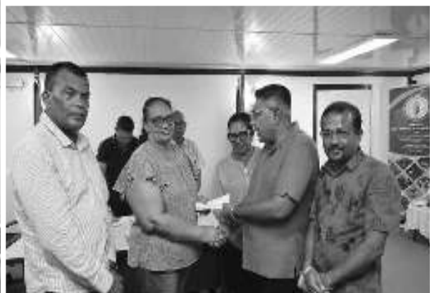
$437M paid to Region Two farmers and millers for PetroCaribe Rice Deal Debts

This payout follows a similar resolution earlier this year when the government, through the Guyana Rice Development Board (GRDB) and the Ministry of Legal Affairs, settled an issue involving rice exported to Panama in 2018. Payments for that deal, which were also delayed under the previous administration, were finally transferred to the GRDB accounts and distributed to the respective millers and farmers.