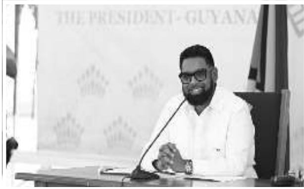
President Dr. Mohamed Irfaan Ali

President Dr. Mohamed Irfaan Ali has reaffirmed his government's unwavering commitment to improving the lives of all Guyanese, emphasising that every policy, initiative, and investment is designed with the people at its core.