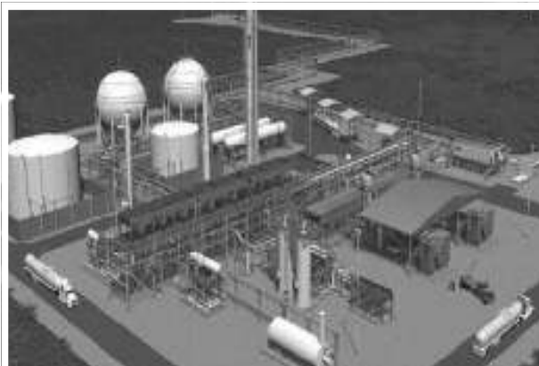
US EXIM Bank grants final approval for $526M Gas to Energy loan to Guyana

This approval, Dr. Jagdeo asserted, dispels misinformation from critics and reinforces the credibility of the government's development agenda. As Guyana moves forward, the GtE Project is set to revolutionise the energy sector, delivering affordable and sustainable power to drive economic growth and improve the quality of life for all citizens.