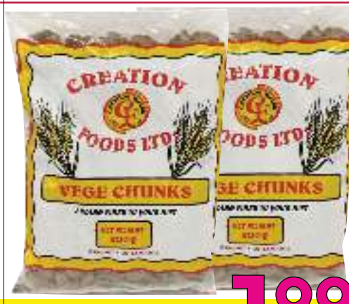
Creation Food Veggie Chunks assorted 200 g