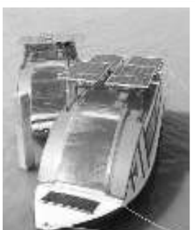
One of the maternal health boats

In addition, four villages in Region One (Morawhanna/Smith Creek, Barima Koriabo, Hobodiah, and Katchicamo) received boats valued at $1.4 million each to improve healthcare access.