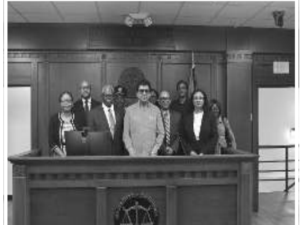
The commissioning of the Mahaicony Magistrate's Court

The AG recalled his own experiences at the