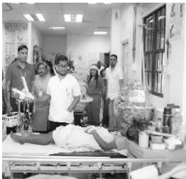
GPHC recorded fewer deaths, saved 79 women in 2024

Government Investment: A $97.6 billion injection