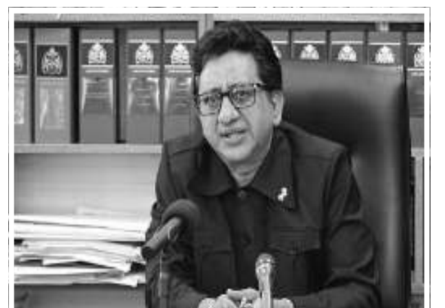
Attorney General and Minister of Legal Affairs, Anil Nandlall, SC

The Integrity Commission Act, enacted in 1997, aims to deter corruption and promote transparency and accountability in public life. The amendments will further strengthen the Commission's ability to fulfill its mandate.