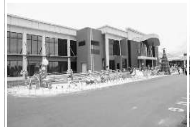
Ongoing works at the CJIA

In addition, the minister reviewed ongoing works on the in-line baggage handling system and