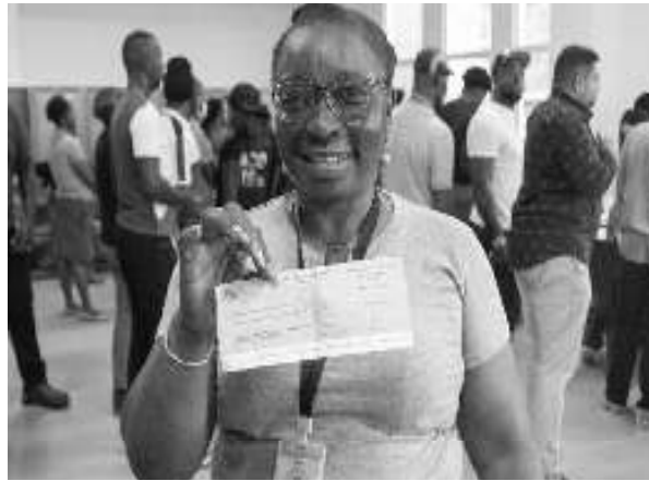
Public Servants begin receiving the $100,000 cash grant

Pensioners and public servants across Guyana, including teachers, health workers, and members of the Disciplined Services, have received their $100,000 cash grant. This grant, part of a government programme involving key institutions such as the Ministry of Finance, the Bank of Guyana, the Auditor General's Office, and the 10 Regional Democratic Councils (RDCs). General Secretary of the People's Progressive Party (PPP), Dr. Bharrat