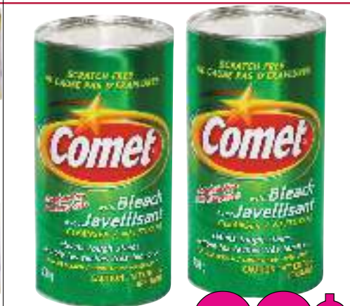
Comet Powder Cleanser 400 g