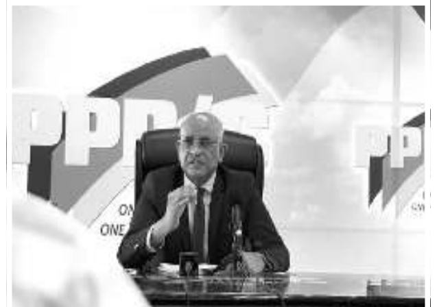
Vice President Dr. Bharrat Jagdeo speaking at a party press conference

Dr. Jagdeo also reflected on the PPP's achievements since 1992. "Before 1992, we were one of the poorest and most