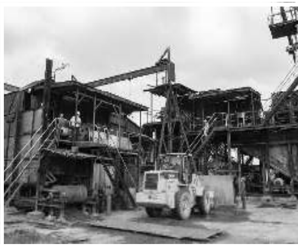
The sugar industry is a important pillar of Guyana's economy

"We sat down with them [GuySuCo management] and supported their investment plan to restore factory efficiency. I made