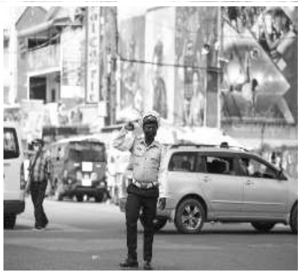
A police officer conducting mobile patrol in Georgetown

Notably, the clearance rate for murders reached an impressive 71%, meaning