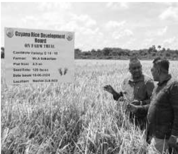
Minister of Agriculture, Zulfikar Mustapha at the launching of the new GRDB 18 rice variety

As 2024 drew to a close, government officials highlighted significant milestones achieved across various sectors during year-end press conferences. From record-breaking advancements in agriculture to groundbreaking improvements in healthcare, Guyana has made remarkable strides in its journey toward progress and prosperity.