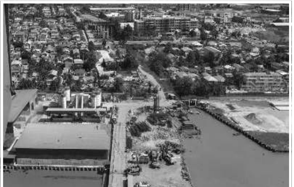
A vision of unity, prosperity, and global integration.

We are committed to ensuring that our people benefit from the proceeds derived from the exploitation of their natural resource