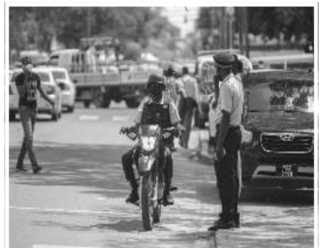
Decreasing fatalities and serious accidents

Looking forward, the government is set to expand its traffic safety initiatives, with plans to introduce a demerit point system for drivers and further amend the Motor Vehicles and Road Traffic Act. These measures are aimed at enhancing enforcement and ensuring greater transparency and accountability on the roads.