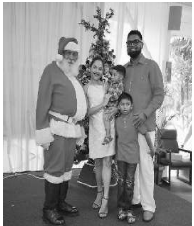
Scene from the annual children Christmas social at State House

The event concluded with the children receiving a delightful array of toys, adding to the festive cheer.