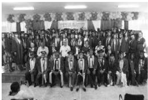
Region Two gets 91 new healthcare workers

He encouraged the graduates to serve their communities with passion and compassion, stressing that healthcare is a team effort.