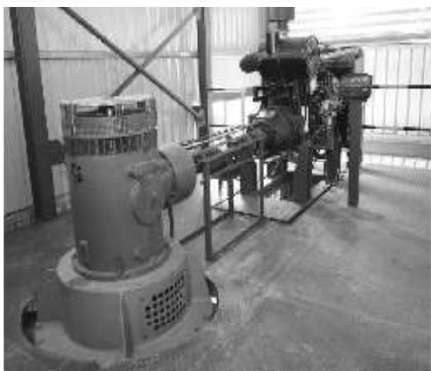
The commissioning of the pump

Agricultural production in Region Two will be significantly boosted with the commissioning of a new $528 million pump station in Andrews. The facility, equipped with two powerful solar-powered pumps, will greatly improve drainage and irrigation for farmers.