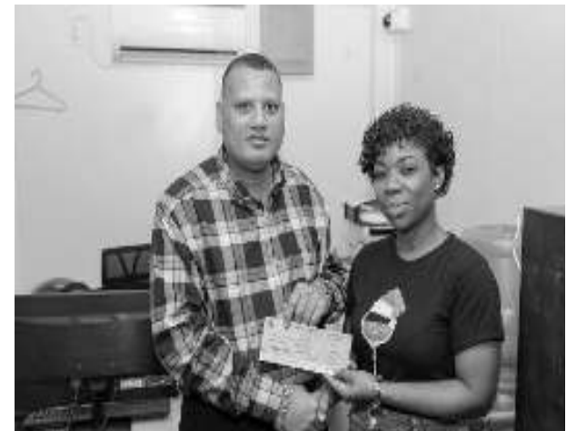
Public Servants begin receiving the $100,000 cash grant

Applicants must present valid identification and photographs to confirm eligibility.