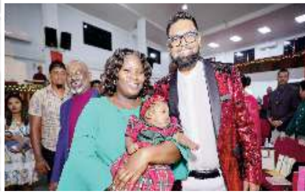
Christmas Day Service at the Lifespring Ministry in Chateau Margot on the East Coast of Demerara

Addressing the congregation, President Ali emphasised that the government's focus is on the nation's most vulnerable populations, ensuring that no one is left behind as the country progresses toward a brighter, more inclusive future.