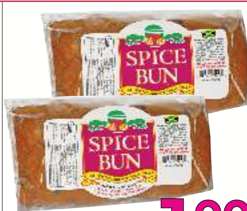
HTB Spice Bun 340 g