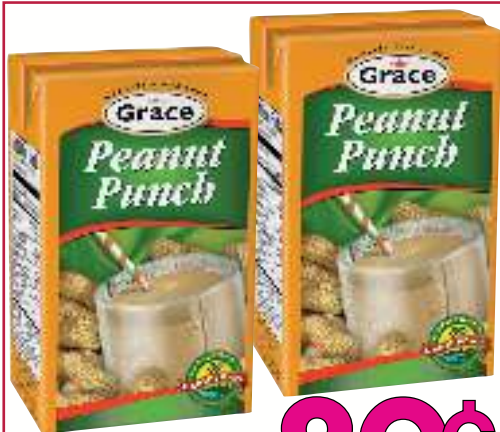
Grace Peanut Punch 240 ml

We're simply the best West Indian store in town.