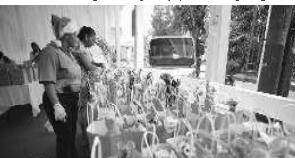
Scene from the annual children Christmas social at State House