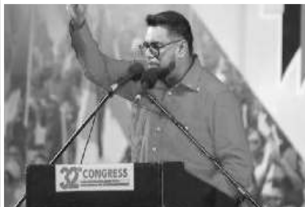
President Ali addressing the PPP's 32nd congress