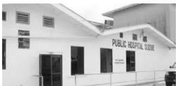
84 new healthcare professionals added to Region One's healthcare workforce

modern, world-class infrastructure at Guyana's premier airport.