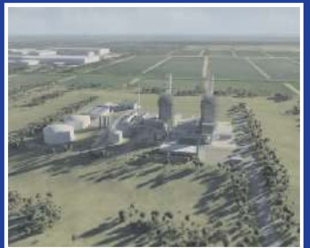
US EXIM BANK APPROVES $526 MILLION LOAN FOR GAS-TO-ENERGY PROJECT