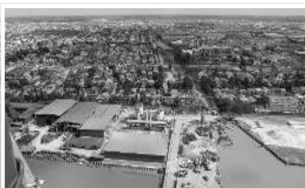
Construction of the new bridge is moving apace

Construction of the New Demerara River Bridge (NDRB) has advanced significantly, with the East Bank site at Peter's Hall now fully cleared for the continuation of works.