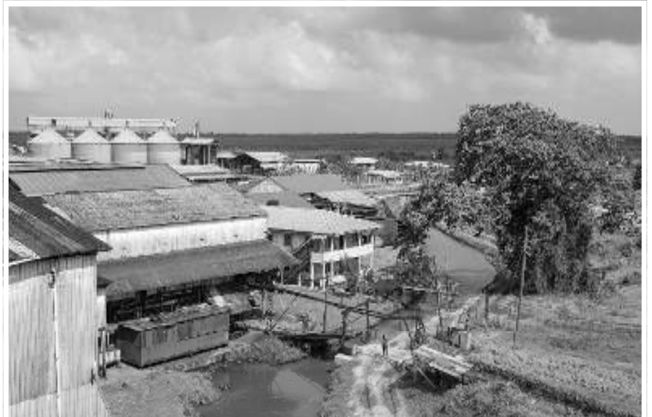
The sugar industry is a important pillar of Guyana's economy

This decisive approach signals that the government is unwilling to allow past mismanagement to undermine its efforts to rebuild a stronger, more resilient sugar industry for Guyana.