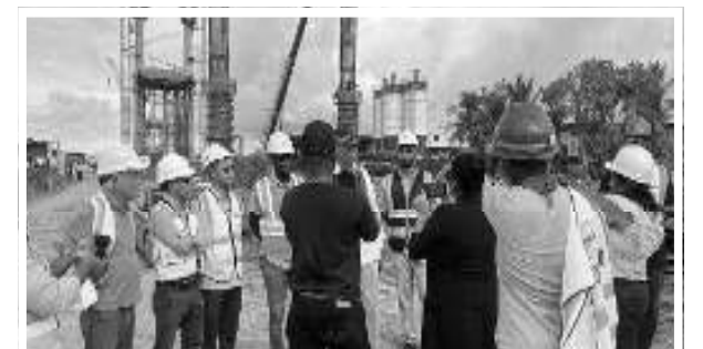
Minister of Public Works, Bishop Juan Edghill visiting the construction site on East Bank end of the New Demerara River Bridge (NDRB) at Peter's Hall

and improve the movement of goods and services, reflecting the government's commitment to modernising Guyana's infrastructure.