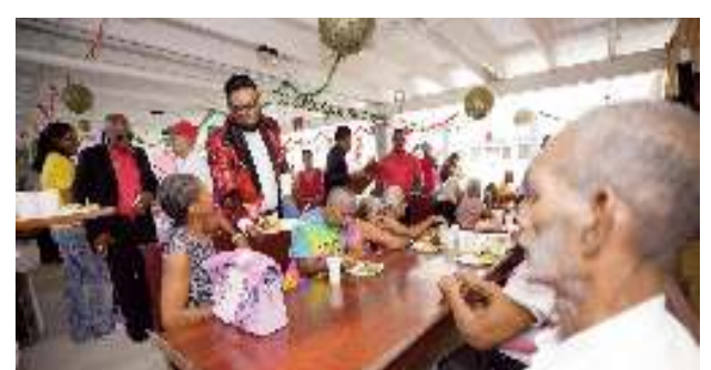
President Ali with residents of the Dharm Shala (Home of Benevolence for all races) in Albouystown.