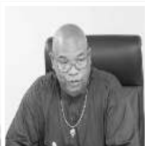
Minister of Public Works, Bishop Juan Edghill at the contract signing ceremony in Region Two

Minister of Public Works, Bishop Juan Edghill, has announced a complete rehabilitation