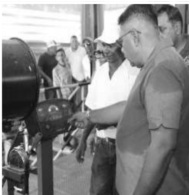
The commissioning of the pump

The project was undertaken by H. Nauth and Sons Construction Company. Work started in September 2021 and concluded in August 2024.