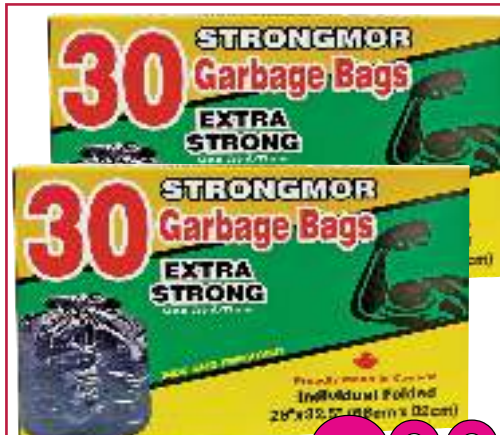
Strongmor Garbage Bag 30's