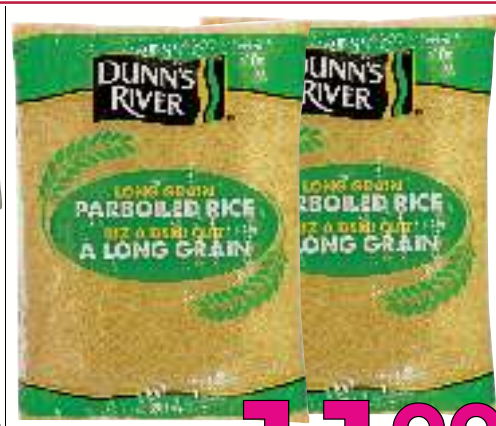
Dunn's River Parboiled Rice 8 kg