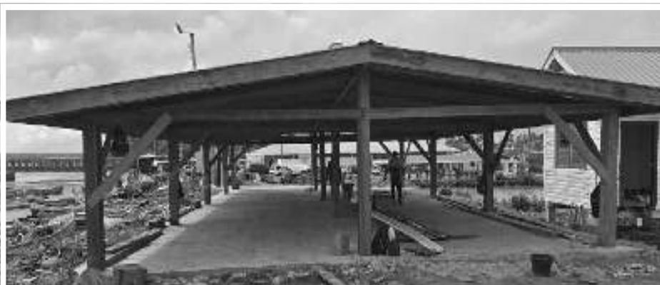
Construction of landing facility and shed nearing completion for fisherfolk at D'Edward Village, West Coast Berbice

The new facilities will provide much-needed shelter for fisherfolk as they mend fishing gear and conduct daily activities, enhancing safety and efficiency, especially during early morning operations.