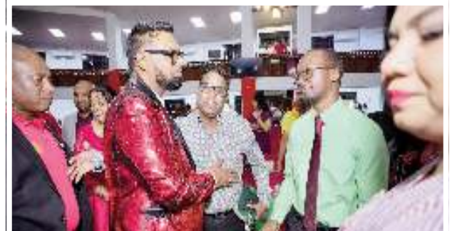
Christmas Day Service at the Lifespring Ministry in Chateau Margot on the East Coast of Demerara