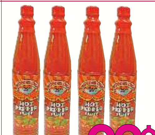
Governor's Choice Hot pepper Sauce 88 ml