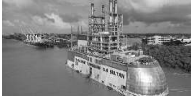
At approximately 1545 hrs on Monday, December 23, 2024, 60 Megawatts (MWs) of Generation was been added to the grid.

President Dr. Irfaan Ali has delivered a stern warning to the management of Guyana Prime Minister Brigadier (Ret'd) Mark Phillips, who visited the newly activated