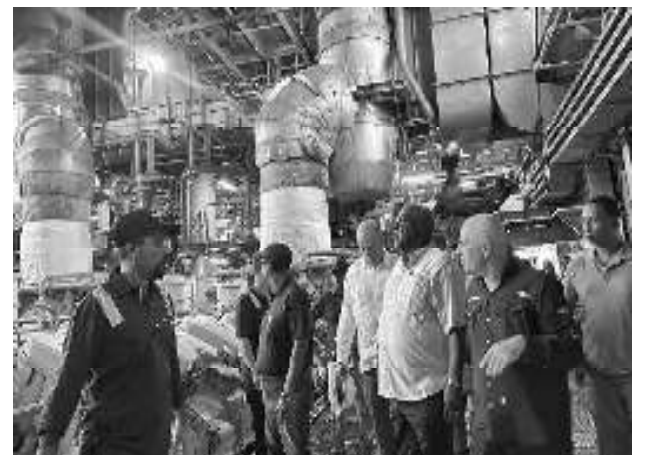
Prime Minister of Guyana, Brigadier R'td, Mark Phillips on a site visit to GPLs New Georgetown Substation and the Power Ship

Dr. Jagdeo also voiced the government's expectations, stressing