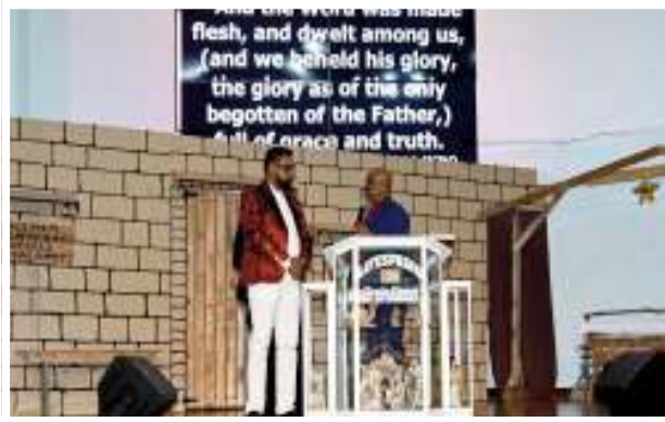
Christmas Day Service at the Lifespring Ministry in Chateau Margot on the East Coast of Demerara

At the Christmas Service at Life Spring Ministries Church on the East Coast of Demerara, President Dr. Mohamed Irfaan Ali reaffirmed the government's commitment to building a united and equitable Guyana, where prosperity and equality are accessible to all.