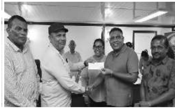
$437M paid to Region Two farmers and millers for PetroCaribe Rice Deal Debts

The PetroCaribe deal, a bilateral agreement between Guyana and Venezuela, allowed for