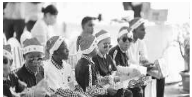
Scene from the annual children Christmas social at State House

one." Encouraging acts of love and kindness beyond material gifts, President Ali urged the children to embrace the true spirit of the season. "Let us recognise the importance of love, the simple act of sharing a smile, extending kindness,