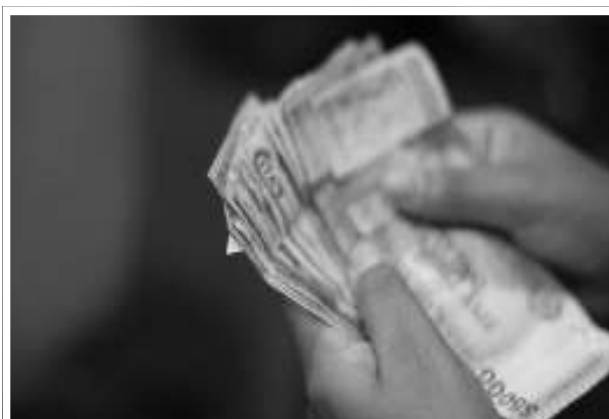
Approximately 69,000 public servants benefited

Earlier this year, teachers also received a 10% salary increase