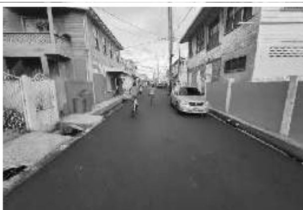
Completed road work

• East Bank Demerara: $1.39 billion was invested to upgrade 47.4 kilometres of roads in communities such as Eccles, Farm, Mc Doom, Timehri, Golden Grove, and Diamond.