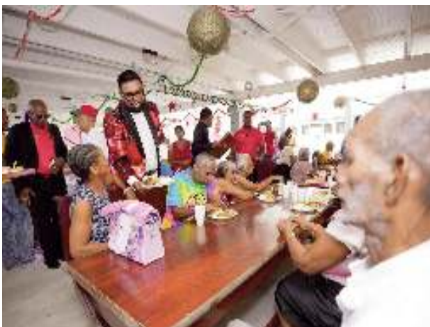
President Ali with residents of the Dharm Shala (Home of Benevolence for all races) in Albouystown.

On Christmas Day, President Dr. Mohamed Irfaan Ali reaffirmed the government's commitment to the Dharm Shala, announcing a $1 million contribution to support the institution's operations.