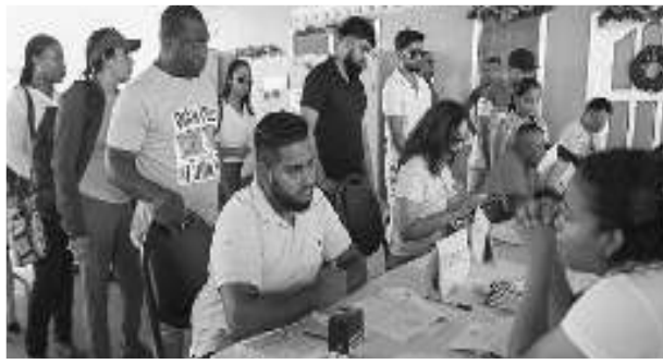
Staff from Ministry of Public Works facilitating the signing of contracts in Region Five

In Region Five, 108 small contractors signed contracts valued more than $1.5 billion to execute road construction and upgrades. Minister of Public Works, Bishop Juan Edghill, who oversaw the signing, highlighted the initiative's impact