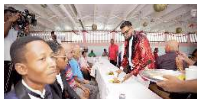
President Ali with residents of the Dharm Shala (Home of Benevolence for all races) in Albouystown.