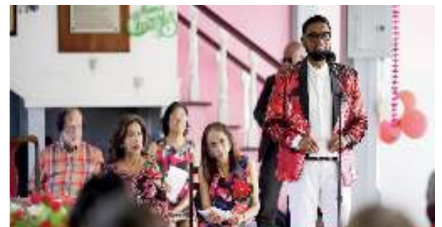
President Ali with residents of the Dharm Shala (Home of Benevolence for all races) in Albouystown.