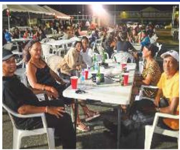
ONE GUYANA, ONE CELEBRATION- OLD YEAR'S NIGHT BRINGS COMMUNITIES TOGETHER