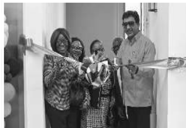
The commissioning of the Mahaicony Magistrate's Court