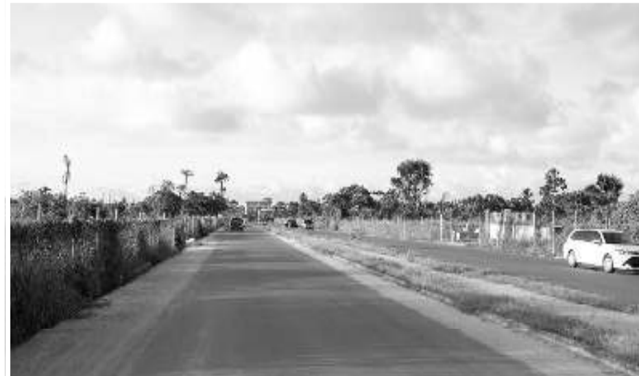
Major projects like roads, bridges, schools, and hospitals.

In 2025, we will also work towards cleaner and more appealing physical surroundings,