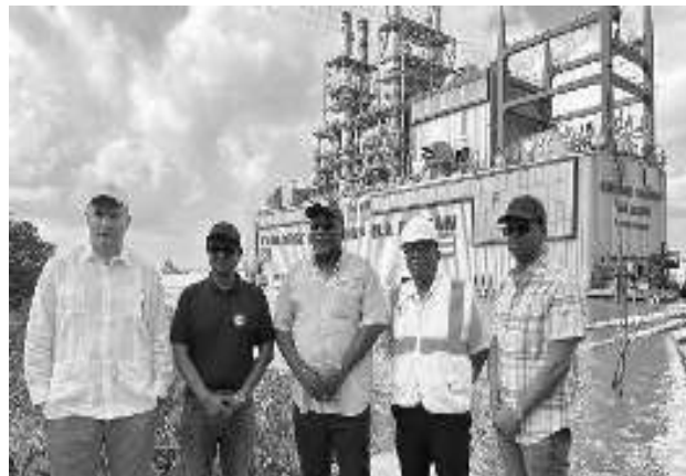
Prime Minister of Guyana, Brigadier R'td, Mark Phillips on a site visit to GPLs New Georgetown Substation and the Power Ship

power ship, reassured the public that the increased capacity would address ongoing power outages. He emphasised that any disruptions moving forward would be rare and typically