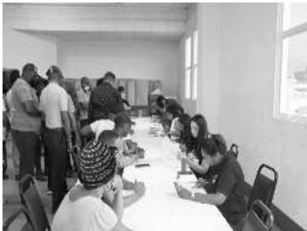
Public Servants begin receiving the $100,000 cash grant