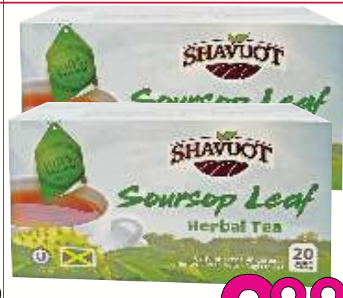
Shavuot Soursoap Leaf Herbal Tea 20's