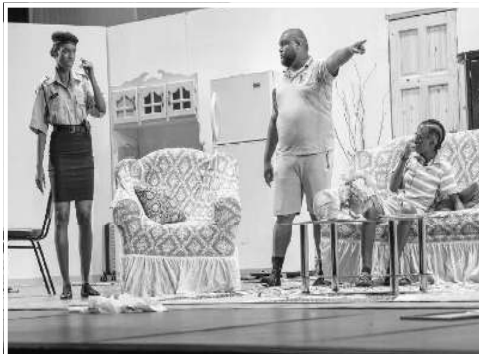
Play Requiem for the Living was a hit

The Write to Stage programme provides a valuable platform for showcasing the talents of Guyanese playwrights and enriching the local theatre scene. Minister of Culture, Youth and Sport, Charles Ramson Jr, at the conclusion of the performance, reaffirmed the government's commitment to the