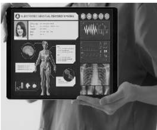
First phase of e-record system to begin at GPHC early 2025