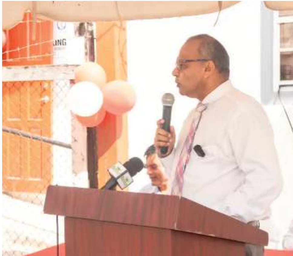
Minister of Health Dr Frank Anthony

The Minister of Health, Dr Frank Anthony, said that he is pleased at the expansive services that will benefit the