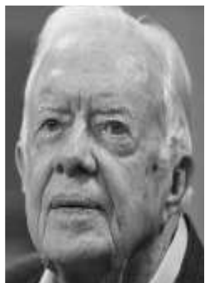
James Earl Carter Jr. was an American politician and humanitarian who served as the 39th president of the United States from 1977 to 1981

President Dr. Mohamed Irfaan Ali has expressed heartfelt