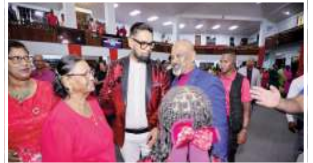
Christmas Day Service at the Lifespring Ministry in Chateau Margot on the East Coast of Demerara