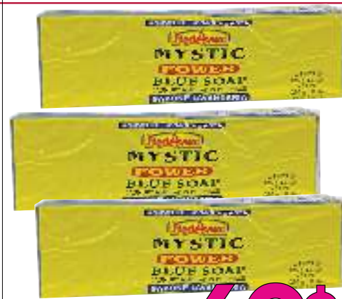
Mystic Power Blue Soap 2x125 g