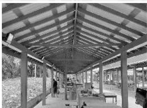
Over 80 per cent of rehabilitation work at Meadow Bank Wharf complete

The rehabilitation of the Meadow Bank Wharf in Georgetown is on track for completion by January 2025. The $150 million initiative, led by the Ministry of Agriculture, will see additional upgrades to further enhance the facility.