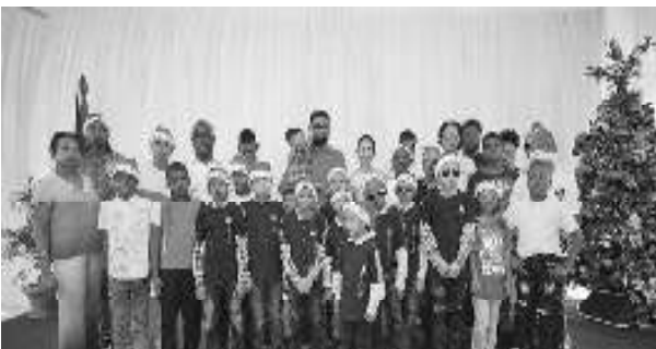
Scene from the annual children Christmas social at State House

President Irfaan Ali and First Lady Arya Ali hosted a joyous Christmas social for scores of children from orphanages across Region Four at their official residence on Main Street, Georgetown.