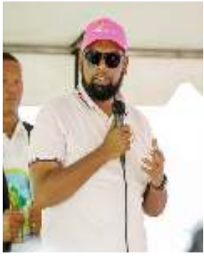
President Ali addressing residents in Victory Valley

Mohamed Irfaan Ali reaffirmed his government's commitment to the development of Region Ten during a recent visit to Linden, highlighting substantial investments made in the region since 2020.