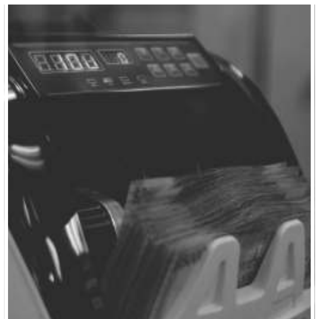
Over $200M retrieved in 4 years for unpaid workers