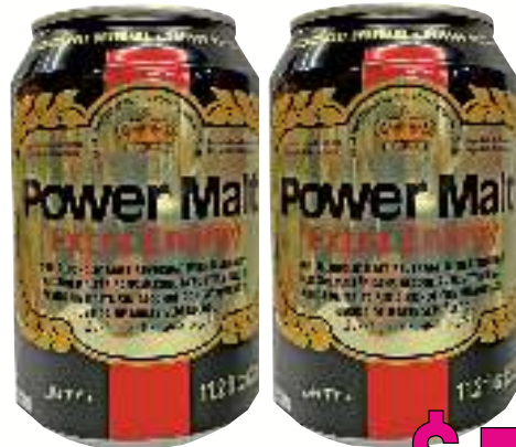
Power Malt Extra Energy Sleek Can 330 ml