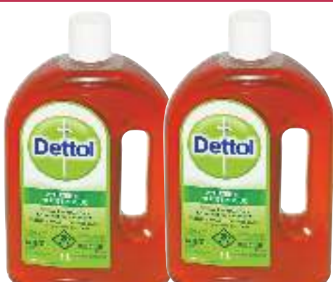
Dettol Liquid Antiseptic 1 L