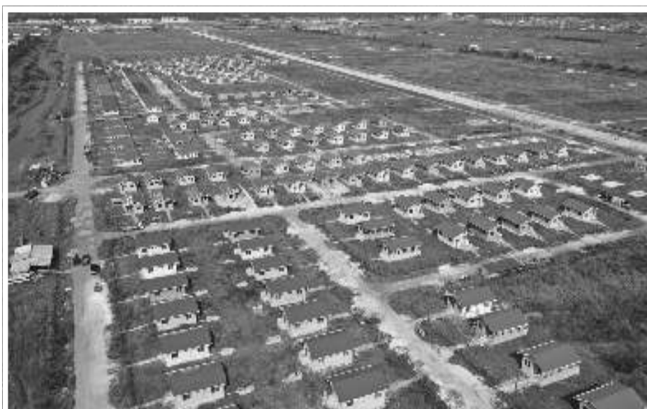
Since 2020, more than 75 new housing areas have been established nationwide

Minister Croal underscored the government's commitment to exceeding the 10,000