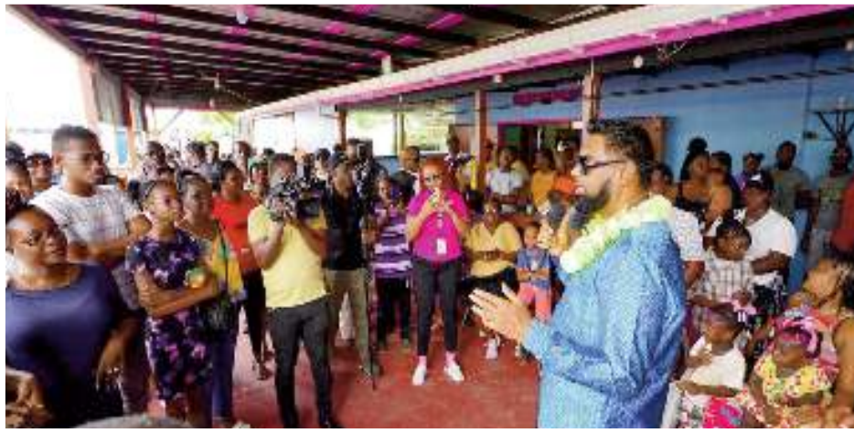
President Dr. Mohamed Irfaan Ali addresses crowd in Buxton East Coast Demerara

President Dr. Irfaan Ali has announced transformative agricultural projects in Melanie Damishana, Buxton, and Strathspey on the East Coast of Demerara, emphasising his government's commitment to people-centered development.