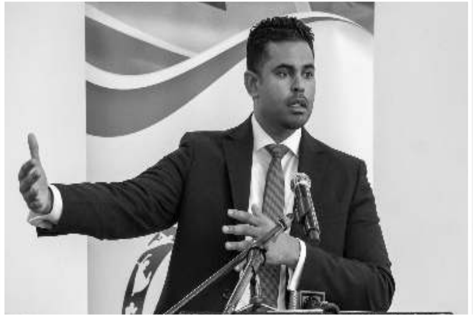
Minister of Culture, Youth and Sport, Charles Ramson Junior speaks about Guyana's achievements in sports for 2024

Minister Ramson added that this major accomplishment is the result of a healthy level of collaboration by the government with Guyana's sports academy, sports associations and athletes.