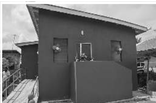
One of the low income homes completed

The government has invested significantly in homeownership, allocating approximately $12.5 billion since 2020 to construct over 1,865 houses across the coast.