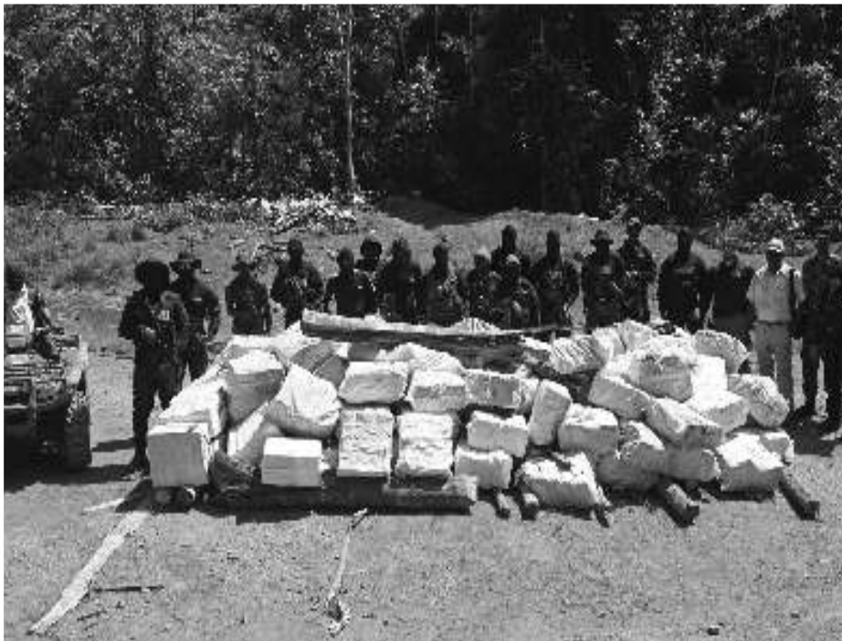
4.4 tonnes (4,400kilos) of cocaine seized from an illegal airstrip in the dense forests of Matthew's Ridge, Region One last year

The Customs Anti-Narcotic Unit (CANU) made significant inroads against drug trafficking last year by intercepting and destroying some 6738.212 kilogrammes (kgs) of illicit substances.