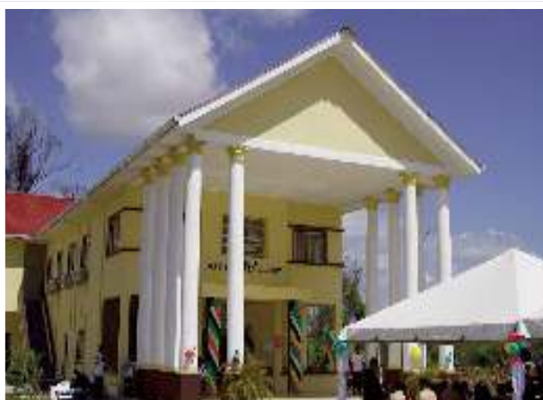
New state-of-the-art magistrates' court commissioned in Mahdia