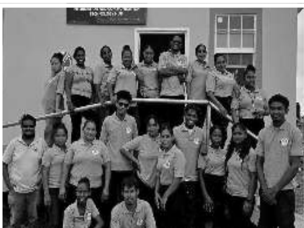
ICT hub in Kimbia

communities with high-speed internet using Low Earth Orbiting (LEO) technology like Starlink. This initiative provides access to essential online services, education platforms like the Guyana Online Academy of Learning (GOAL), and numerous online opportunities.