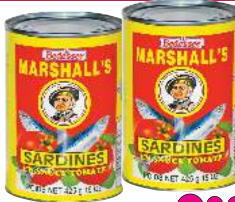
Marshall's Sardine In Tomato Sauce 425 g