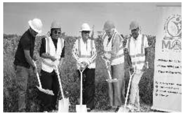
SOD turned for Guyana's first School for the Deaf