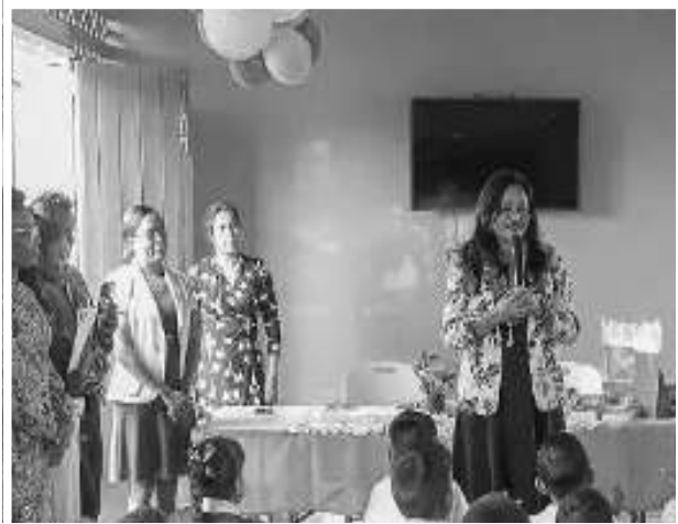
Ministry Of Human Services and Social Security Dr Vindhya Persaud addresses attendees

A new youth centre opened its doors, providing a vital resource for children in Strathavon and surrounding communities. Funded by the United Nations Population Fund (UNFPA), this centre offers a safe and supportive environment where young people can access a range of services and activities.