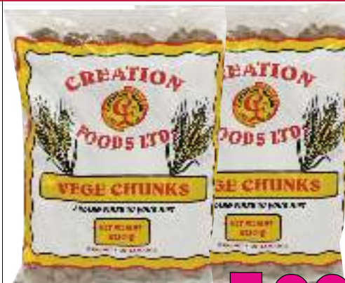
Creation Food Veggie Chunks assorted 200 g