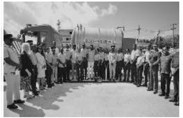
President Ali and officials with EMT at GFS HQ

“These investments reflect a forward-thinking approach, ensuring