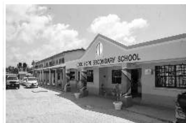
Good Hope Secondary School

The government is currently constructing