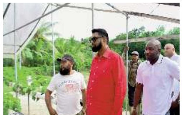
President Ali at the CV Farm at Friendship Village, East Bank Demerara

In March 2024, the Guyana School of Agriculture (GSA) received a first-of-its-kind greenhouse from