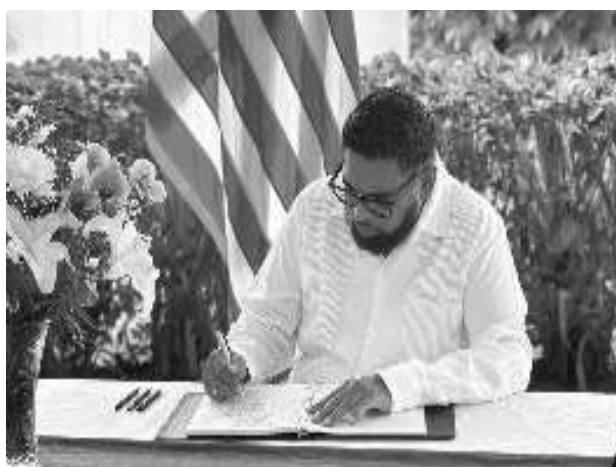
The signing of the condolence

President Carter held a special place in the hearts of Guyanese