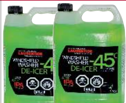
Laurentide Windshield Washer -45 3.78 L