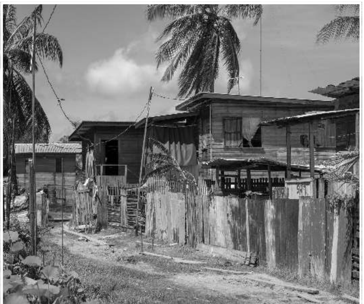
In 2024, 583 informal lots were allocated while six squatting areas were regularised