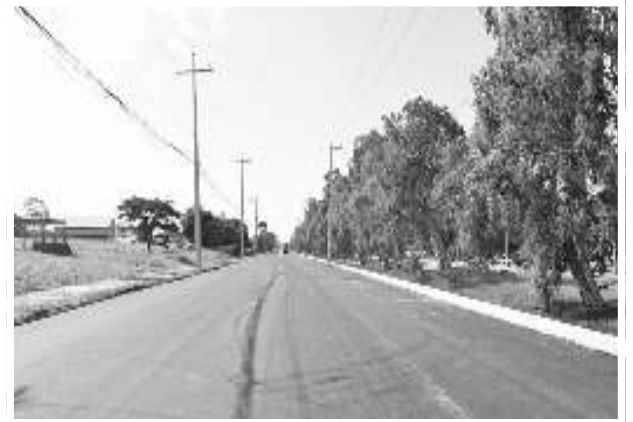
Phase One of the Thomas Lands Road

of Thomas Lands Road was deemed necessary due to significant sinking on the western section, closer to the National Park, which posed a major traffic hazard.