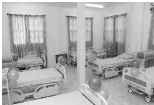
A section of the commissioning ceremony for Mabaruma Maternal Waiting Home