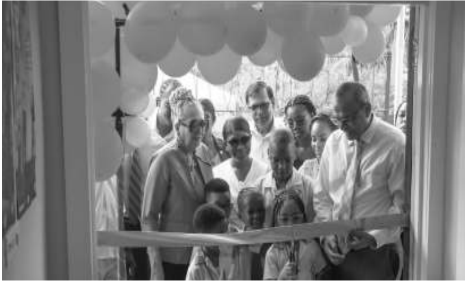
The North East La Penitence Health centre was officially reopened

The reopening of the $18 million North East La Penitence Health Centre marks a significant step forward in expanding access to primary healthcare for approximately 7,651 residents in the East Ruimveldt to Lamaha Park area. A ceremony commemorated the reopening of the facility, which will now offer a range of critical services, including expanded vaccination campaigns for 19 preventable diseases (such as HPV), school health screenings with corrective care, HbA1c testing for diabetes management, and infectious disease monitoring. In the coming months, the health center will be further expanded to include a