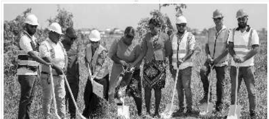
Attorney General and Minister of Legal Affairs, Anil Nandall, SC

Beyond Region Four, the Ministry continues to enhance educational facilities across the country. Upgrades are planned for schools on