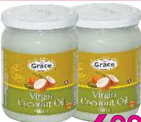
Grace Virgin Coconut Oil 500 ml