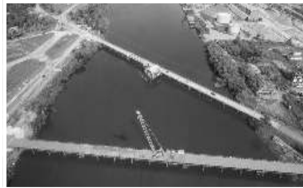
Construction of the new bridge progressing adjacent to the old structure

commence in March. All preliminary designs and surveys have been completed, and