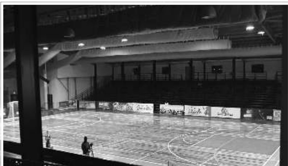
Work progressing on the Anna Regina Stadium in Region Two

The MacKenzie Stadium which is under construction in Region Ten is the most advanced of the five being built by the government through the Ministry of Culture, Youth and Sport.