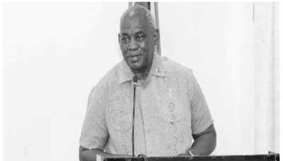
Minister of Home Affairs Hon. Robeson Ben

The Commissioner of Police, Clifton Hicken, warned police officers to ensure their body cameras are on when