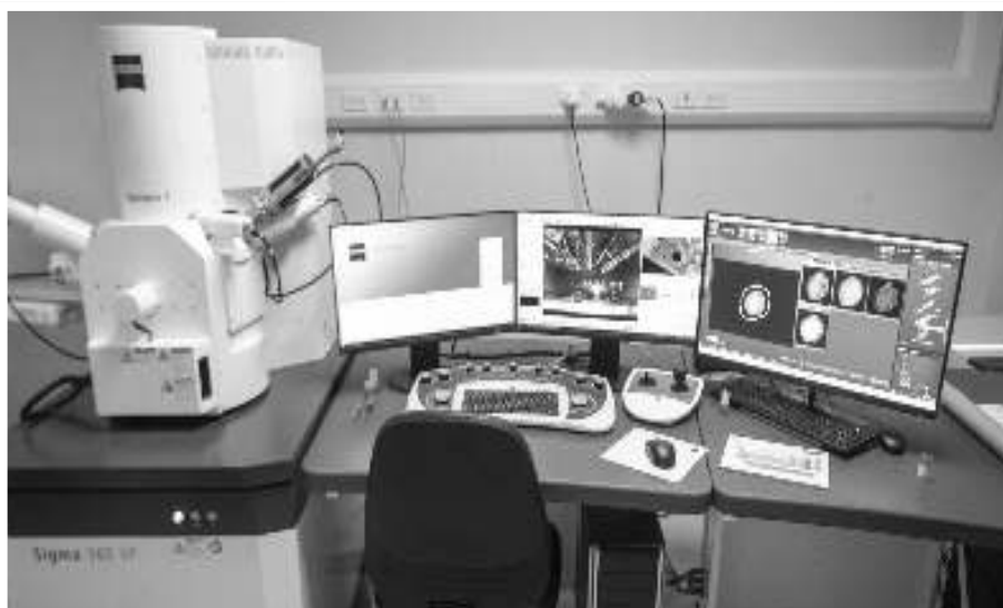
Guyana has become the first country in the Caribbean to acquire a scanning electron microscope (SEM)

"This is a very significant acquisition, and this acquisition points