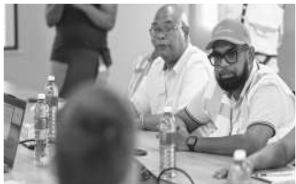
President Ali engaging the contractors on the bridge progress

The next phase of the project will focus on the pile foundation.