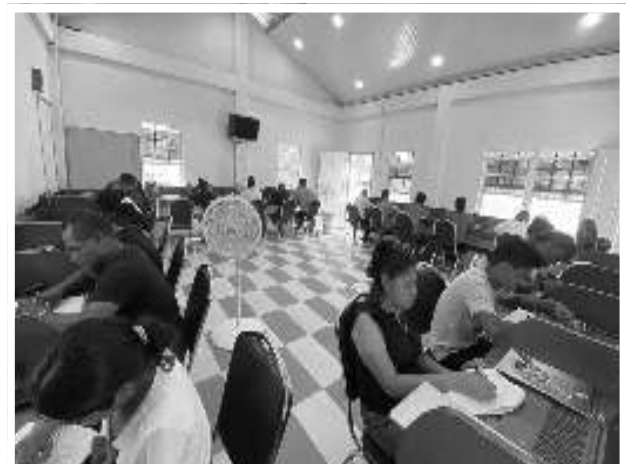
ICT training at a hinterland ICT hub

knowledge necessary to thrive in the rapidly evolving digital economy.