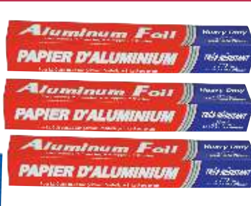
Heavy Duty Aluminum Foil 25 Sq Ft