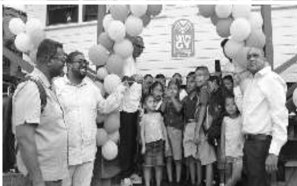
Ceremonial cutting of the ribbon for Arukamai Health Post