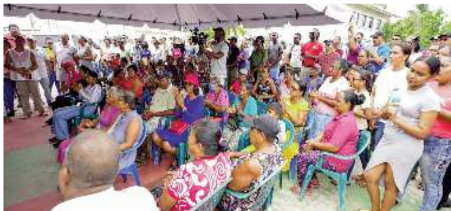
Strathspey residents engage President Ali

acres of land into a major pork production hub. The initiative will introduce smart agricultural