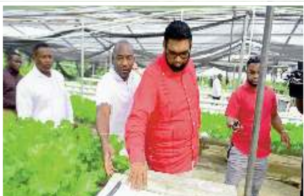
President Ali at the CV Farm

President Dr. Mohamed Irfaan Ali expressed amazement at the innovative use of hydroponics technology during an unscheduled visit to CV Farm at Kuffy Koker Dam, Friendship, East Bank Demerara.