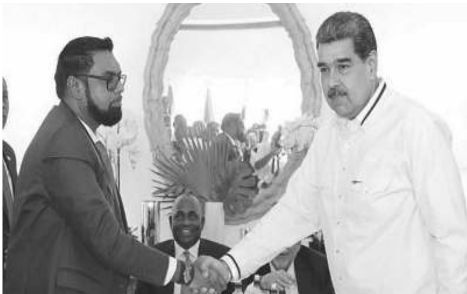
President Irfaan Ali and Venezuela President Nicolas Maduro shaking hands after the Argyle agreement on December 14, 2023

The Ministry of Foreign Affairs of Guyana has strongly condemned recent actions and statements by the Government of Venezuela, describing them as clear violations of the Argyle Agreement