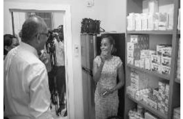
The reopening marks a crucial step in expanding access to primary healthcare within the capital city

individualised, and accessible health services to all. This model aims to reduce health disparities by ensuring equitable and inclusive universal health coverage.