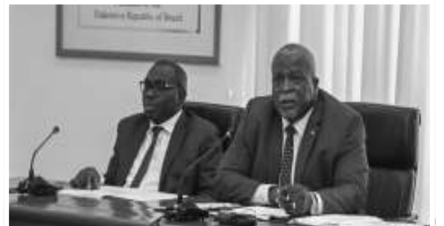
Prime Minister, Brigadier (Ret’d) Mark Phillips and Minister within the Office of the Prime Minister with responsibility for Public Affairs, Kwame McCoy giving an update on the electricity

The expansion of Guyana’s total electrical generation from 207 megawatts to 267 megawatts accommodated the growing demand spurred by a housing and construction boom and commercial development. New solar farms, mini-grids, and two power ships, generating 96 megawatts collectively, contributed to the increase. Smaller