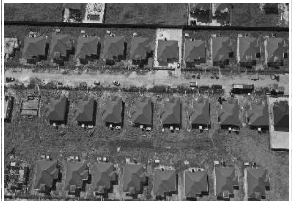
New housing policy being developed

The first phase of this strategy, a 100% analysis of the issue, has been completed and will be presented to cabinet this month. A pilot programme for this strategy will be implemented in Region Three before expanding to other regions.