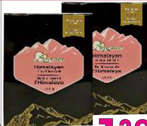
Applewood Himalayan Pink Pine Salt 500 g