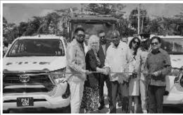
President Ali officially handing over the 40 vehicle fleet to the GFS

The 10-point plan outlines key areas for improvement, including: