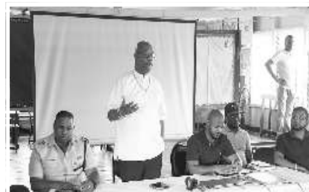
Minister of Public Works, Bishop Juan Edghill, visited several major access roads in Georgetown to be reconstructed

and bridges, have been made available for residents and commuters during construction.