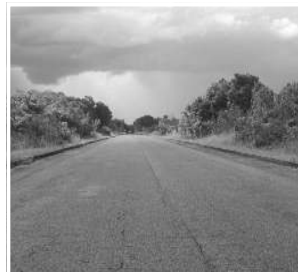
The current Soesdyke-Linden Highway

This significant investment will strengthen connectivity between Region Ten and the hinterland with Regions Three, Four, and Seven, fostering