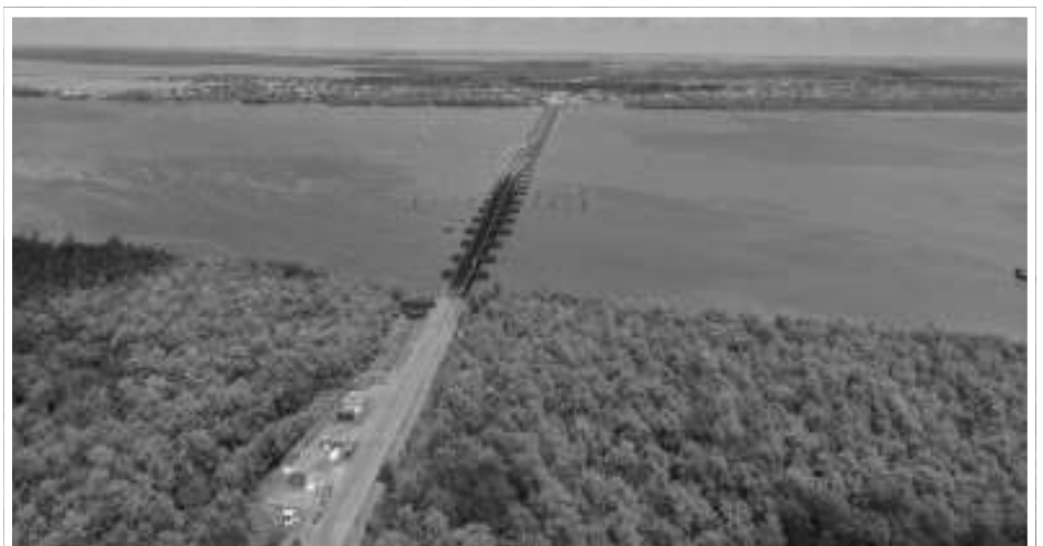
The present structure connecting the western bank of Berbice at D'Edward Village in Region Five with its eastern bank at Crab Island in Region Six

The government is also undertaking the construction of a new US$35 million bridge to replace the existing one-lane crossing between