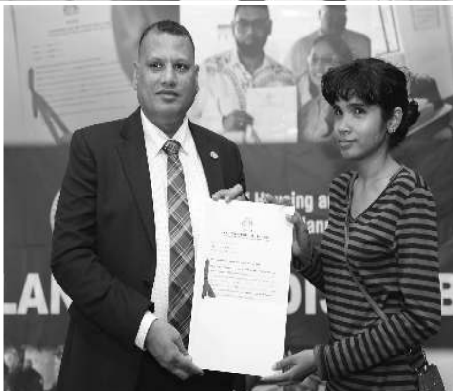
Minister of Housing and Water Collin Croal presenting a land title to a beneficiary