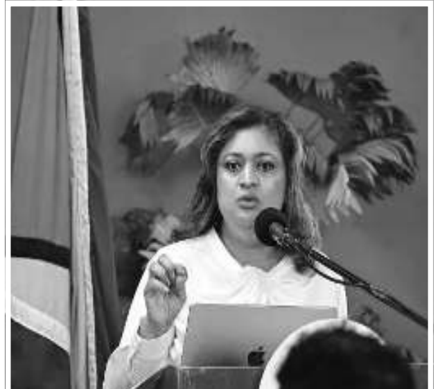
Minister Of Education Priya Manickchand.webp

The GOAL and GROW programmes represent a significant investment in the human capital of Guyana. By providing access to