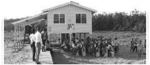
Imbotero Health Post