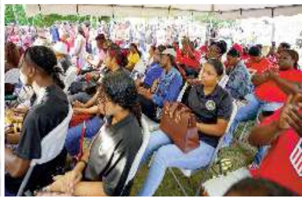
President Ali addressing residents in Victory Valley

"In the whole five years of the APNU+AFC, they spent less than 0.3 per cent of what we are spending in public works for your development," the