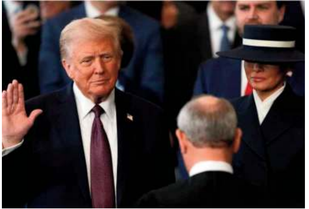
Donald Trump takes the oath of office on Monday

She further pointed out that this multimillion-dollar collaboration is just the first of many, emphasising the long-standing relationship between Guyana and the US.