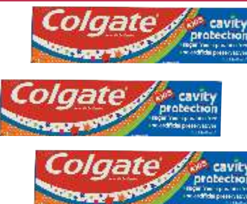
Colgate Kids Cavity Protection Tooth Paste 95 ml