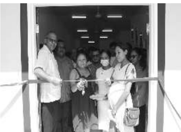
Mabaruma Maternal Waiting Home opens

Expectant mothers and relaxation before childbirth. The facility caters to pregnant women from remote communities in their third trimester (34 weeks or more). Equipped with 12 beds, a kitchen, dining area, washroom, a delivery room, and an on-call room, the home ensures that high-risk mothers, and those with complications have access to specialised care, minimising the risk of maternal and neonatal mortality. This is the second maternal waiting facility in Region One, following the commissioning of a similar facility in Moruca. With this addition, the government has now established eight such facilities across Guyana. Health Minister Dr. Frank Anthony emphasised the