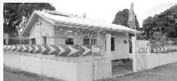
$14M spent on newly recommissioned Kamwatta Health Post

highlighting the reduced need to travel long distances for basic healthcare.