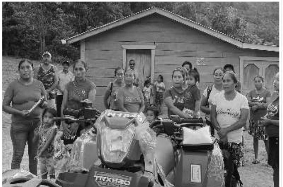
Bauxite production to increase by 400,000 tonnes this year

Minister Sukhai noted that safe travel remains a priority for the government and investments will continue to be made for those living in the hinterland.