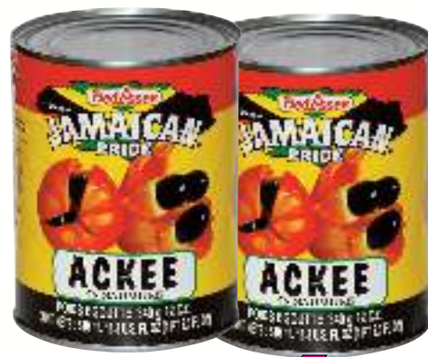
Jamaican Pride Ackee 540 ml