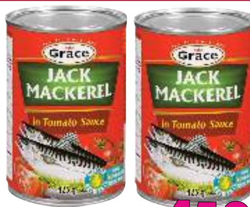
Grace Jack Mackerel in Tomato Sauce 425 g