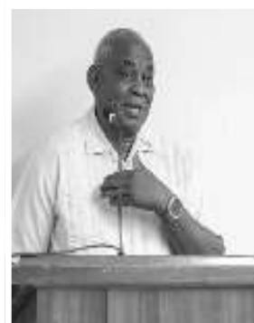
Minister of Home Affairs Hon Robeson Benn at the unveiling ceremony for SEM

This collaboration, Minister Benn explained, would allow forensic experts to come here and