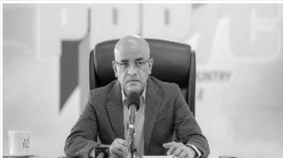
Vice President Dr Bharrat Jagdeo Addresses members of the media at his weekly press conference

He dismissed the assertions of the WPA as