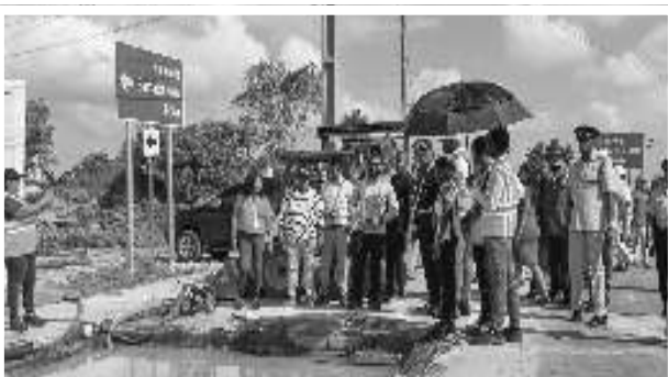
Minister of Public Works, Bishop Juan Edghill, contractors and residents inspecting the extent of work at Third Avenue, Diamond