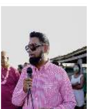
President Ali addressing residents at a community meeting along the East Coast of Demerara

President Dr. Mohamed Irfaan Ali, during a community engagement, ordered the establishment of a