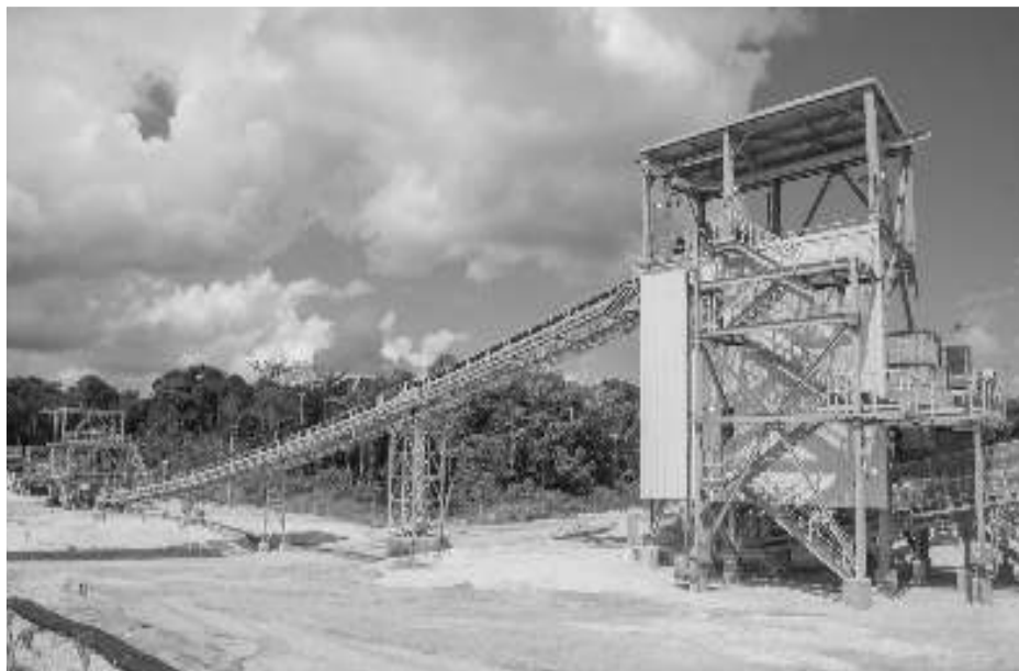
Bauxite production to increase by 400,000 tonnes this year

He underscored the devastating effects of their policies, which led to the loss of jobs, reduced production, and