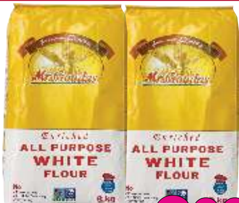
Mr Goudas All Purpose White Flour 8 kg