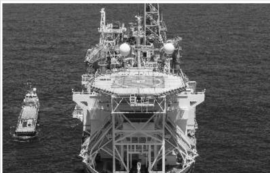
Guyana's Oil & Gas sector continues to thrive

General Secretary of the People's Progressive Party (PPP), Dr. Bharrat Jagdeo, has strongly refuted allegations that the party secretly supported the lopsided 2016 Production Sharing Agreement (PSA).