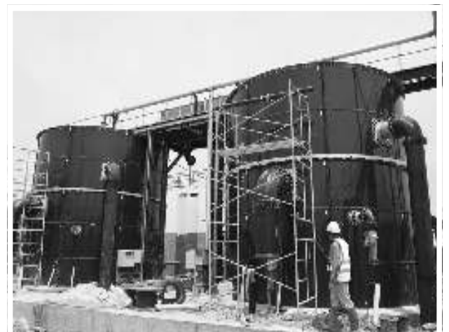
Water Treatment Plant

Works are ongoing to remove iron content from 18 small treatment plants that will benefit