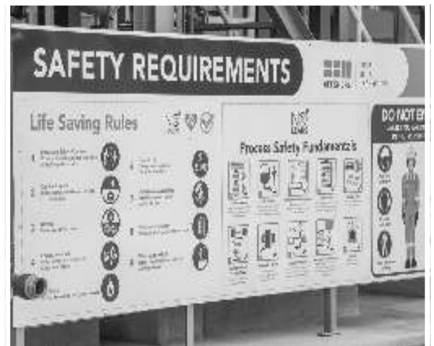
1381 workplace inspections conducted in 2024