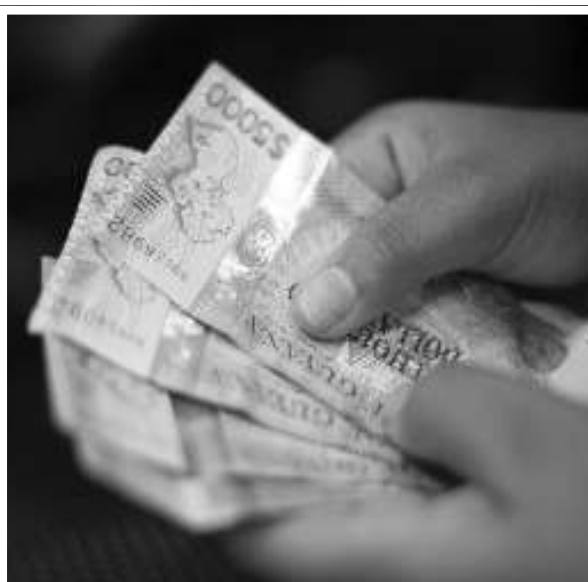
Gold Revenue increased significantly in 2024

The minister said that the revenue growth spells out the sector's importance to the country's economy.