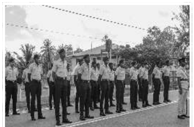
Rank of the Guyana Police Force

Speaking specifically to the decision by popular member of the People's National Congress Reform