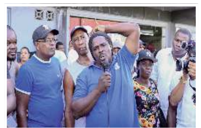
A resident raising his concern