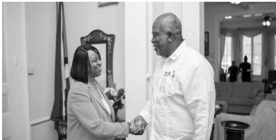
Prime Minister, Brigadier (Ret'd), the Honourable Mark Phillips & President and Chair of the Export-Import (EXIM) Bank of the United States, Ms Reta Jo Lewis

Finance Minister Singh echoed the Prime Minister's sentiments, emphasising the project's transformative potential and the strong US-Guyana partnership that made it possible. He noted the rapid progress made since the initial Memorandum of Understanding (MOU) with US EXIM Bank in 2022, securing US$527 million in financing within two-and-a-half years.