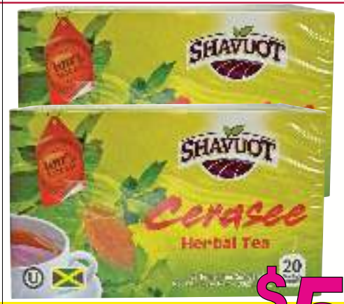
Shavuot Cerasee Herbal Tea 20's