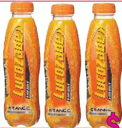
Lucozade Energy Glucose Drink Orange Only 380 ml