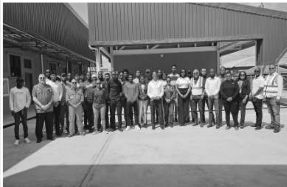
Largest oil and gas cohort begins training on FacTor Simulator

Trainees also follow a permit-to-work system, which is aimed at ensuring the work is done safely and