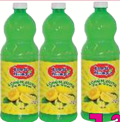
Lou & Nicky's Lemon Juice 946 ml