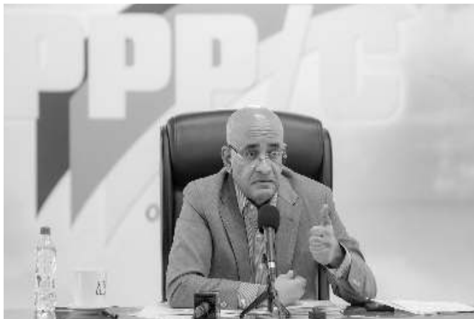
Dr Bharrat Jagdeo, General Secretary of the People's Progressive Party (PPP)

This was disclosed by Vice President Dr. Bharrat Jagdeo, who stated that President Dr. Mohamed Irfaan Ali intervened, directing that the family be awarded the sum ordered by the court.