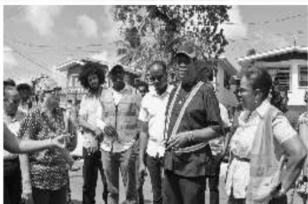
Minister of Public Works, Bishop Juan Edghill, visited several major access roads in Georgetown to be reconstructed