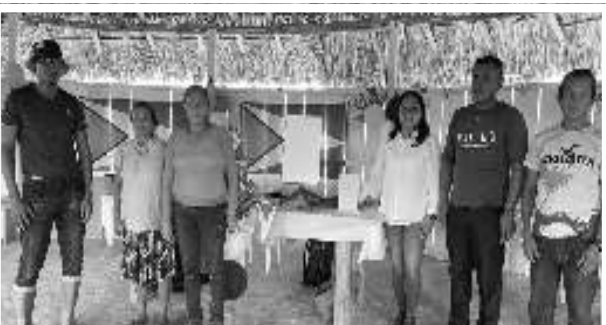
Taruka Village utilised its Presidential Grant to purchase an internet system for education and social purposes

ensuring uninterrupted power supply. These advancements align with broader energy initiatives, such as the Amaila Falls Hydropower Project and the gas-to-energy project, which are expected to generate surplus energy to meet domestic needs and provide financial relief for households.