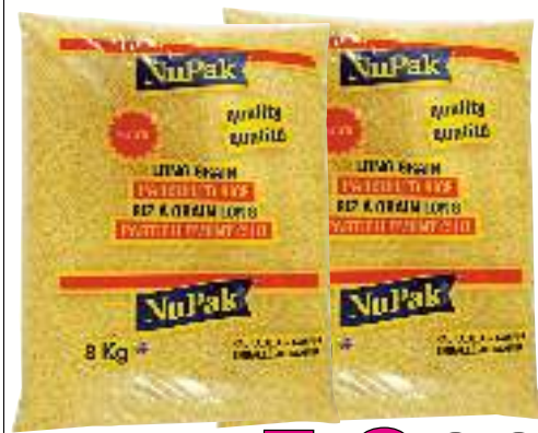
Nupak Parboiled Rice 8 kg