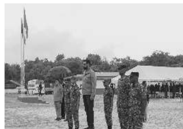
The government has consistently invested in salary increases specifically for members of the joint services

The government has consistently invested in salary increases specifically for members of the joint services, acknowledging their invaluable contributions to the nation.