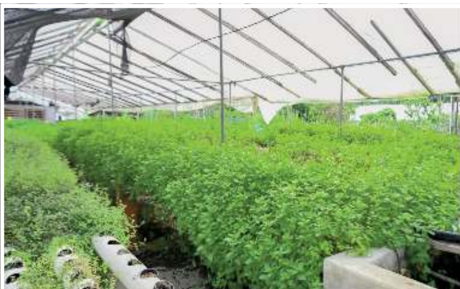
Agricultural yield at the CV Farm

production. "We will further support this. This