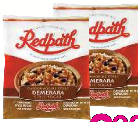
Redpath Demerara Style Sugar 1 kg