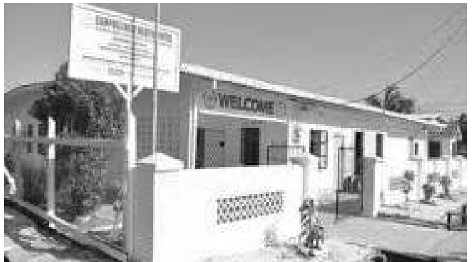
Campbellville Health Centre