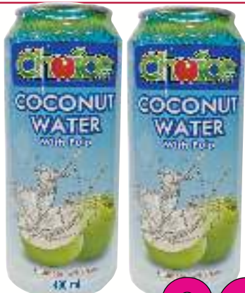
Choice Coconut Water 490 ml