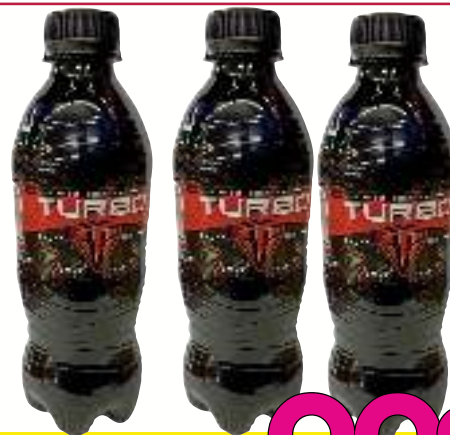
Turbo Energy Drink 370 ml