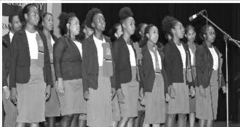
Teachers Training to boost Guyana's Education delivery

Minister of Education Priya Manickchand highlighted this achievement at a press