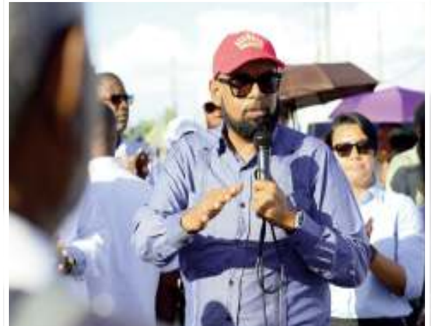
Strathspey residents engage President Ali

Strathspey residents will benefit from a sustainable beekeeping project, with the Government providing 50 beehives, safety equipment, and training through NAREI. The project aims to empower young people and women while boosting agricultural productivity.