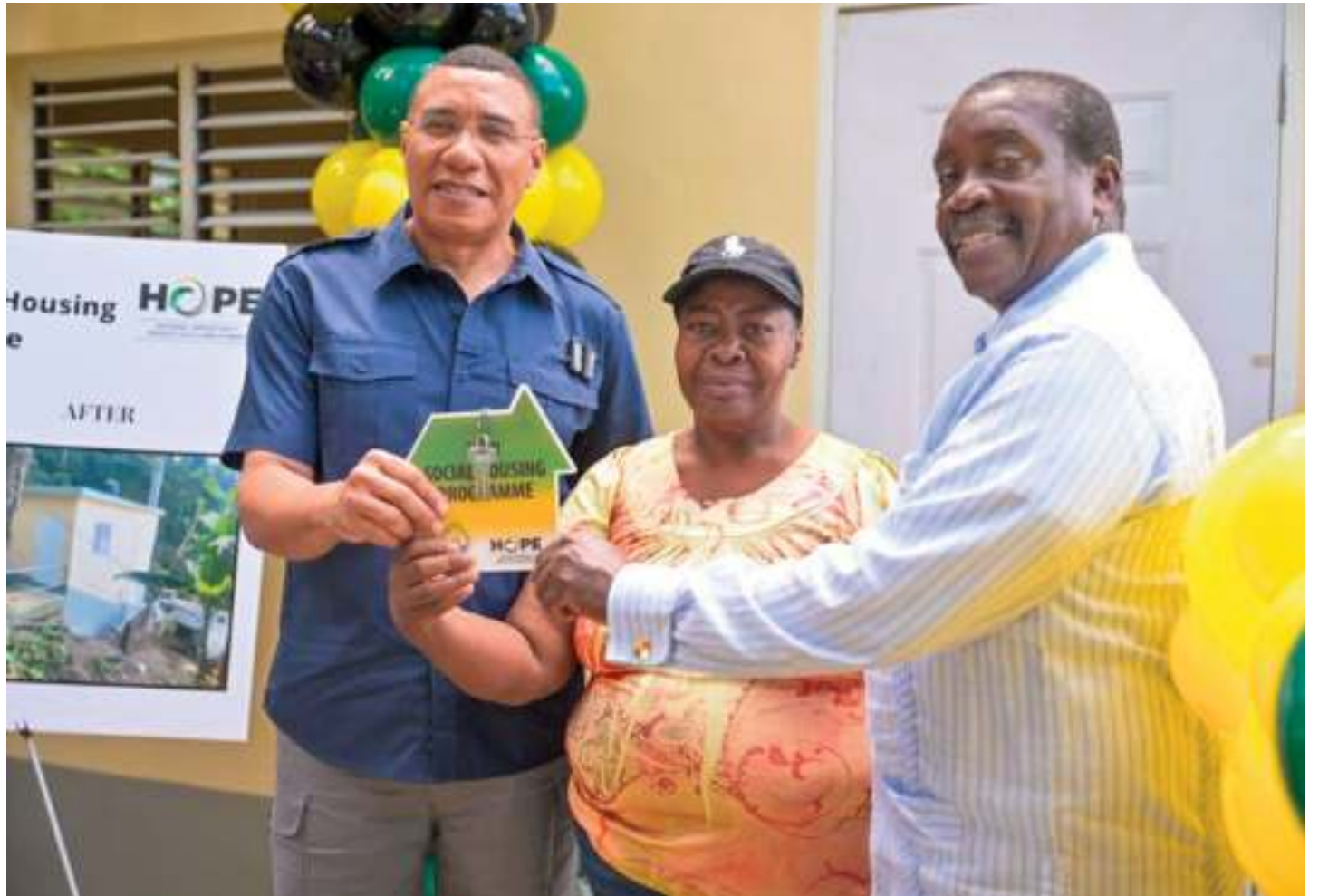
Prime Minister Holness (I) presents a housing grant to a resident

In a 2024 article in the Jamaica Observer, Member of Parliament for St Ann South Eastern Lisa Hanna criti-