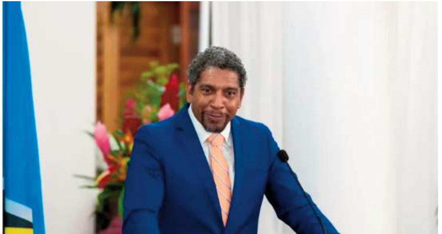
SVG Finance Minister Camillo Gonsalves

Infrastructure Development: Construction of over 70 road stretches