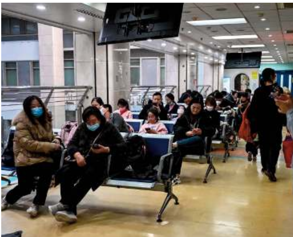
Hospitals in China are being overwhelmed by a surge in HMPV

The estimated incubation period is three to six days but can extend to 14 days, and the median duration of illness can vary depending on severity but is similar to other viral respiratory infections. (CARICOM)