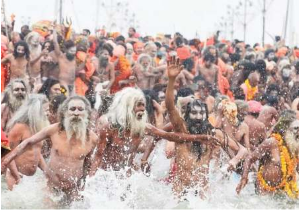
The Naga sadhus are revered by many Hindus