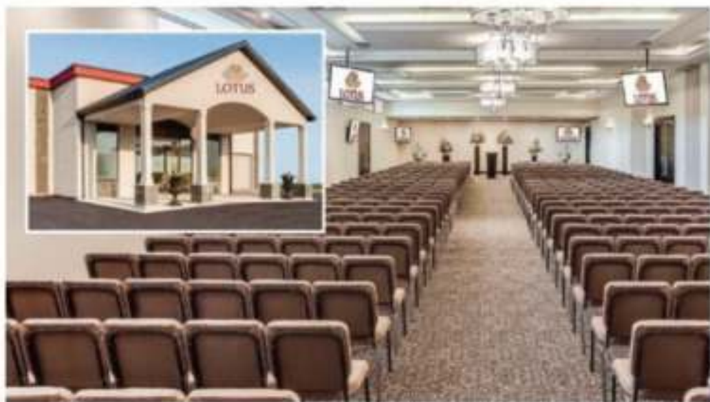
Seating for more than 500+ guests!

121 City View Drive North of Belfield Road, East side of Highway 27 647-547-8188 www.lotusfuneralandcremation.com