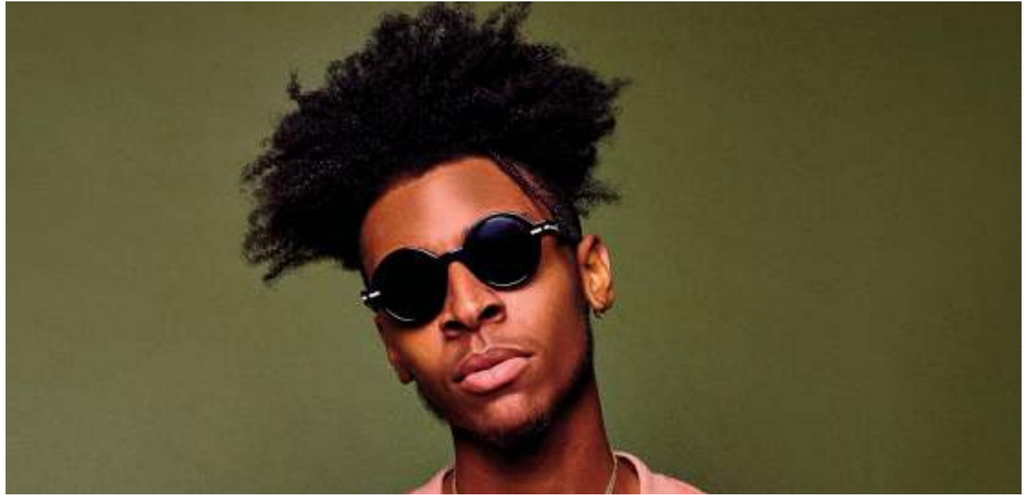
Jamaican singer Masego among those who lost homes in the California wildfires

Six major fires are active across the region, though progress is being made in containing some: