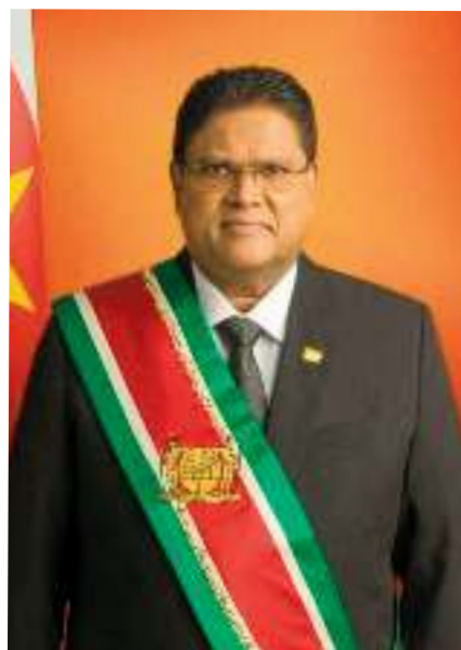
Chan Santokhi: President

In the 2020 general election, the VHP won 20 seats and entered into a coalition with other parties to form the government, thereby defeating the National