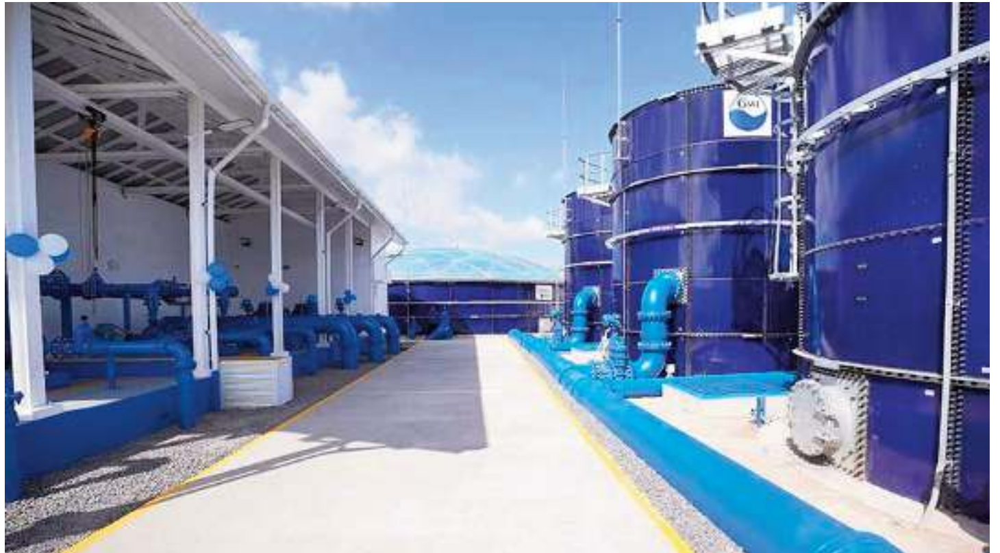
One of the new water facilities

“Important also is sustainability and part of the mandate that the management of GWI would have received was to ensure the greater use of fresh water into the water-management system, and one important project I think would commence shortly, that is the