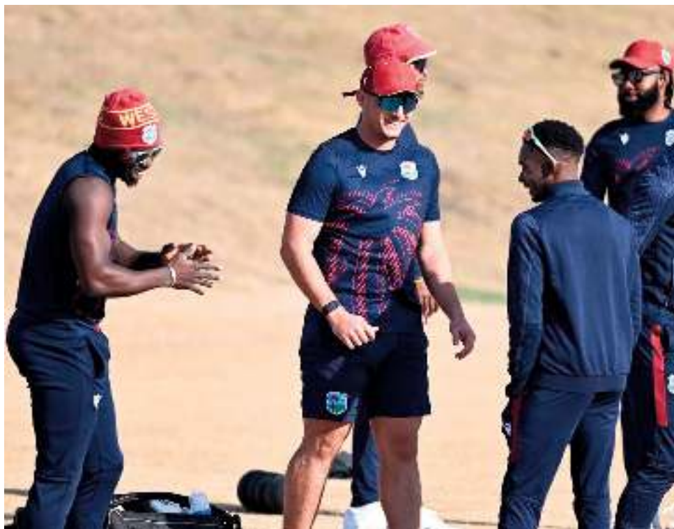
A practice session ahead of West Indies' first Test against Pakistan