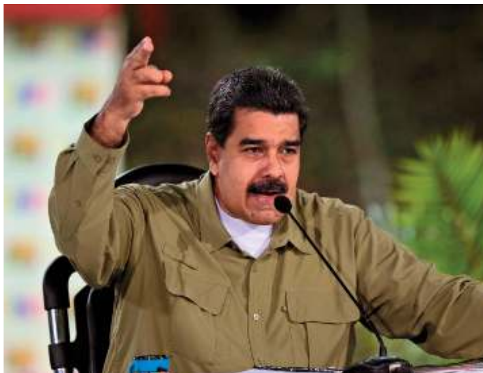
Venezuelan President Nicolás Maduro

Maduro is accused of managing the Cartel of the Suns, a Venezuelan drug-trafficking network involving high-ranking officials. Federal charges against him, filed in March 2020 in New York, include narco-terrorism, conspiracy to import cocaine, and possession of ma-