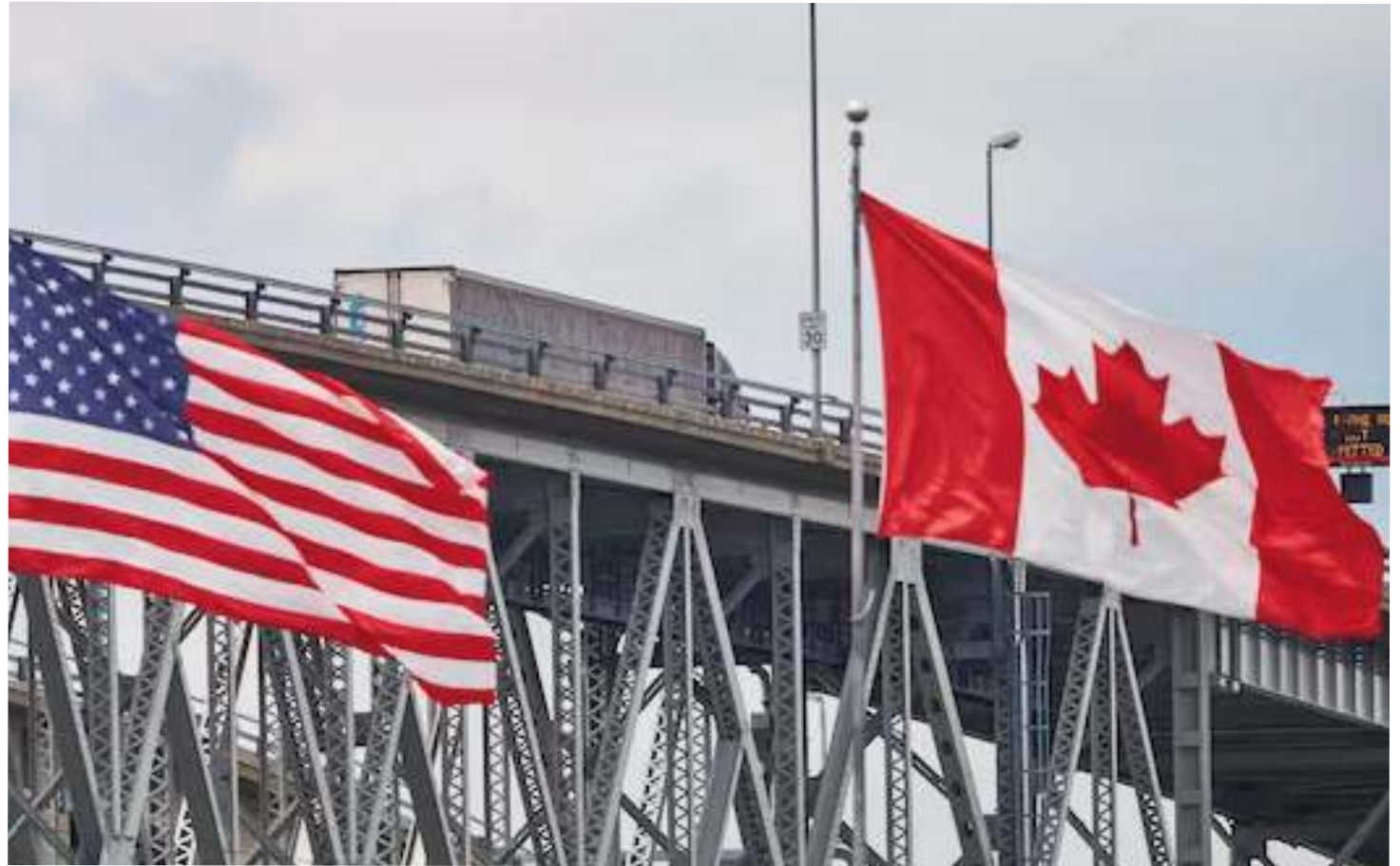
The US border between Sarnia, Ontario and Port Huron, Michigan

should be speaking to border community mayors like him who are "on the front line. Talk to us. We understand the complexity of the relationship and know the American and Canadian people have always got along," he said.