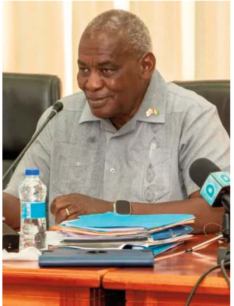
Minister of Home Affairs Robeson Benn

This initiative is aimed at modernising Guyana’s security institution and fostering trust and confidence in the country’s law enforcement agencies.