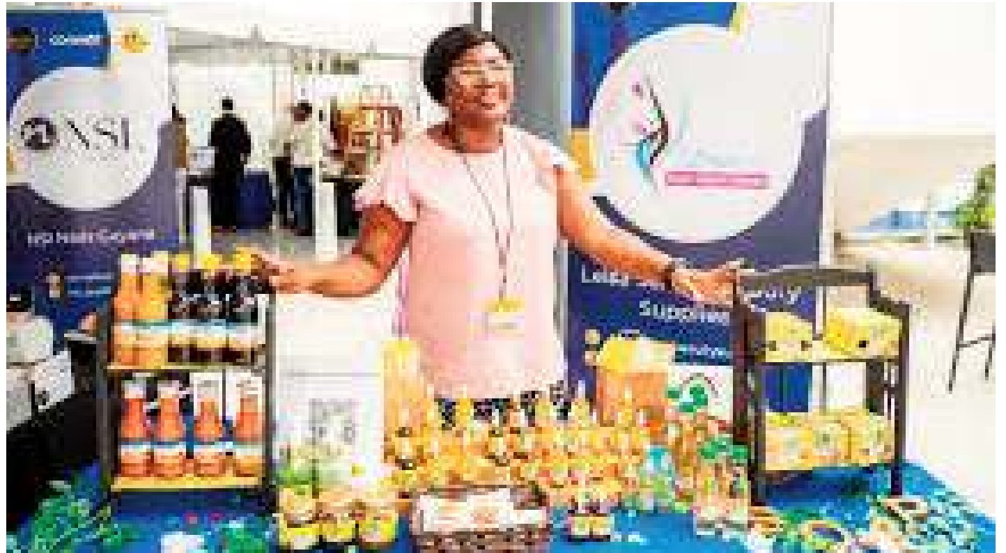
Samm businesses are being encouraged to develop throughout Guyana

In a landmark initiative, the bureau introduced its disability loan programme between 2023 and 2024. This