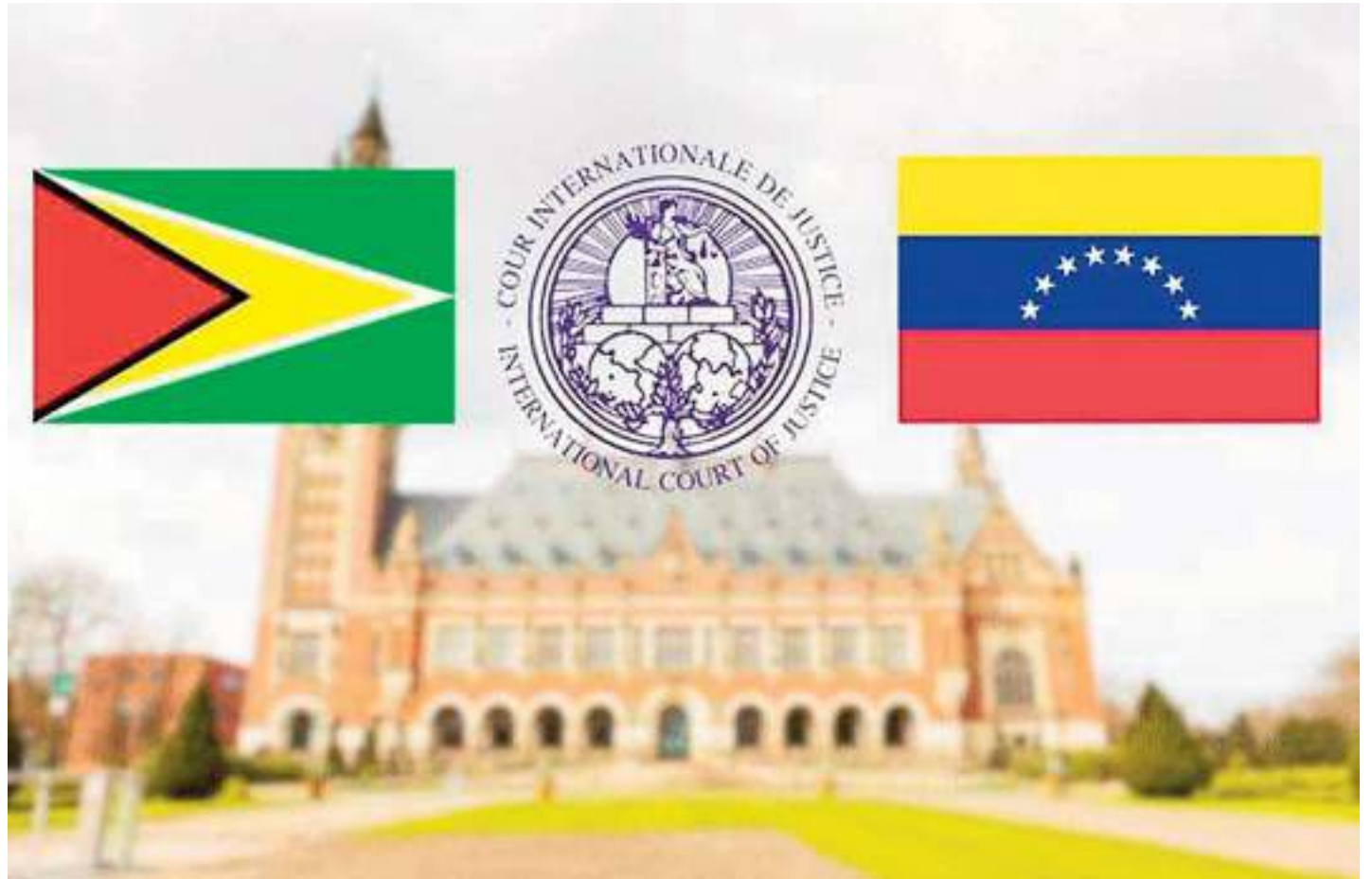
The International Court of Justice in the Hague is still to determine the legitimacy of the Venezuelan claim

"However, the announcement by President Nicolás Maduro on January 7, 2025, regarding the election of a "Governor of the Guayana Esequiba" by "the people of Guayana Esequiba" constitutes a direct violation of these commitments. This unilateral action disregards the spirit of the Argyle Agreement undermines the agreed framework for dia-