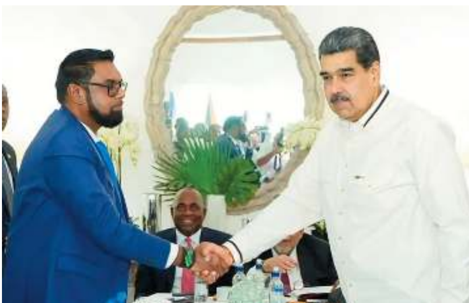
Guyana President Irfaan Ali with his Venezuelan counterpart Nicolas Maduro during a meeting in 2023 to discuss the border dispute

"The Ministry of Foreign Affairs of the Co-operative Republic of Guyana requests assurances from the Government of the Bolivarian Republic of Venezuela that it will respect its international obligations and refrain from further actions that undermine the peaceful resolution of this longstanding controversy. In conformity with international law."