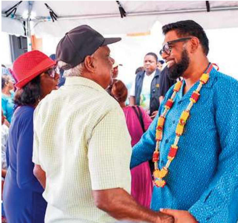
President Ali greets residents of Strathspey, ECD

sponse to the programme was overwhelmingly positive, with more than 100 people taking advantage of the services offered, indicating the community’s strong engagement with these healthcare services.