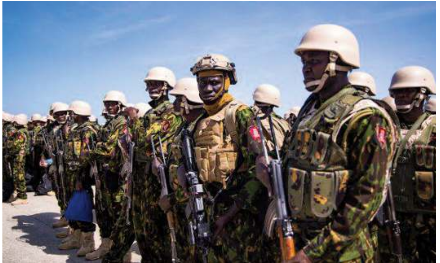
The first U.N.-backed contingent of foreign police officers in Haiti

He further clarified that Barbados would now limit its involvement to providing technical assistance. “Our troops aren’t going anywhere at this point. We have indicated to everybody that Barbados would want to lend technical assistance wherever possible; and we are not at this point thinking in terms of any boots on the ground in Haiti. When I say technical assistance, there may be people with specialist skills whether medical, training, whatever...”