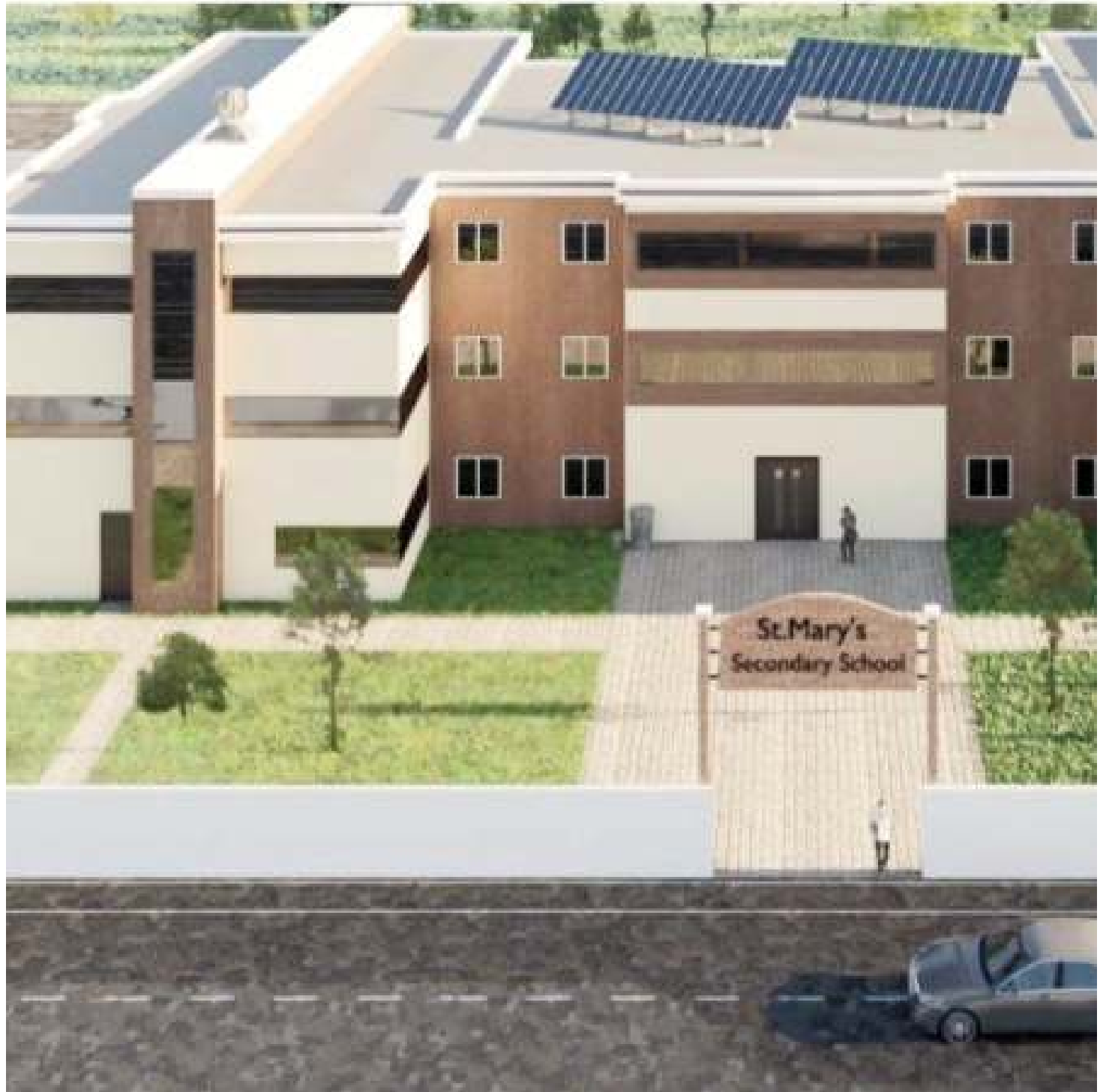
37 new secondary schools like this one in Georgetown have been built across Guyana since 2020

Manickchand went on to note that while persons may look at the investment as a purely dollar and cents in-