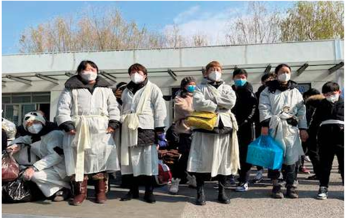
HMPV Outbreak In China is causing widespread concern around the world

CARPHA said it would continue to monitor the evolving epidemiological situation and analyse syndromic