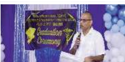
Minister of Health Dr Frank Anthony Delivers charge

Fifteen residents of Region Five have completed the 12-month Medical Laboratory Technician training programme, equipping them with the skills necessary to enhance healthcare delivery and improve patient outcomes.