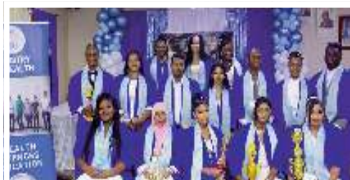
Some of the graduates at the ceremony

significant investments made within the last few years to improve the region's health infrastructure and services among other support.