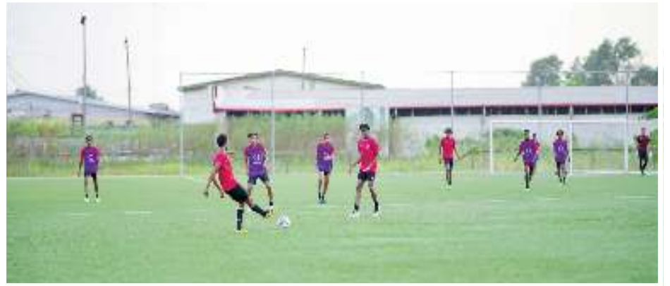
Junior Jaguars Training session

His Excellency President Dr Irfaan Ali lauded the Junior Jaguars, Guyana's Under-17 football team, for their drive and expressed confidence in their future