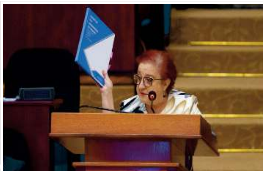
Minister of Parliamentary Affairs and Governance Gail Teixeira during her contributions to the budget debates

The 2025 Budget will improve the socioeconomic status of