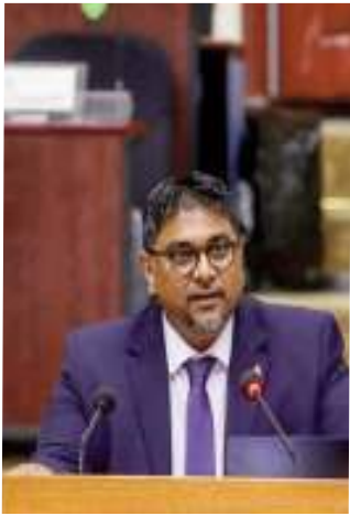
(MP) Sanjeev Datadin

Member of Parliament (MP) Sanjeev Datadin delivered a passionate address in the National Assembly