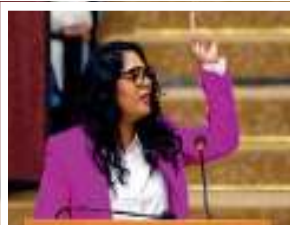
Minister of Local Government and Regional Development Sonia Parag makes her contributions in the budget debates

Minister of Local Government and Regional Development Sonia Parag has reaffirmed that the government's commitment to economic and regional development will not waver despite political obstacles.