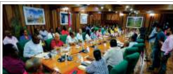
President Dr Mohamed Irfaan Ali met with Regional Executive Officers (REOs), Regional Health and Education Officers and cabinet members

President Dr Mohamed Irfaan Ali met with Regional Executive Officers (REOs), Regional Health and Education Officers and cabinet members for an open discussion on strengthening access to quality health and