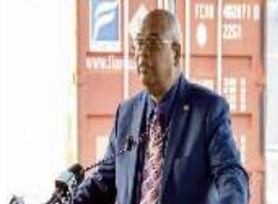
Minister of Public Works Bishop Juan Edghill

"It must start with peer pressure. We have put laws in place t