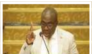
Minister within the Office of the Prime Minister with Responsibility for Public Affairs, Kwame McCoy

Minister within the Office of the Prime Minister with responsibility for Public Affairs, Kwame McCoy lauded the 2025 budget as another gleaming example of the PPP/C government's staunch commitment to empowerment and inclusive governance.