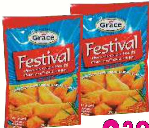
Grace Festival Mix 270 g

We're simply the best West Indian store in town.