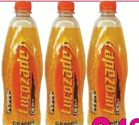
Lucozade Energy Glucose Drink Orange Only 900 ml