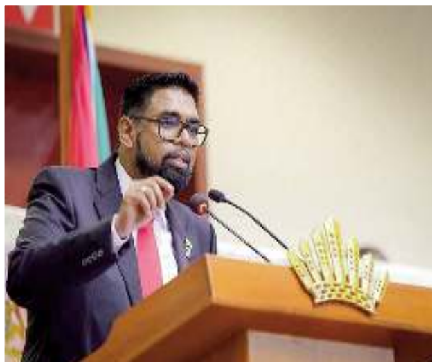
His Excellency President Dr Mohamed Irfaan Ali

GUYANA'S economy is standing not only on an oil-and-gas foundation, it is standing on many legs, President, Dr Irfaan Ali has said, noting that the investments and policies being pursued by the government are ensuring this is the case.