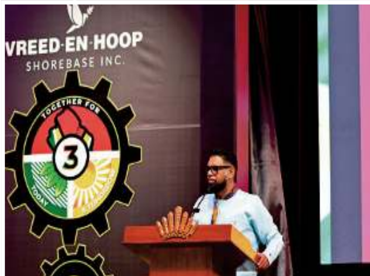
His Excellency President Dr Mohamed Irfaan Ali

He emphasised the importance of leveraging Guyana's natural resources, particularly from the oil and gas industry to create long-term economic benefits, through diversification