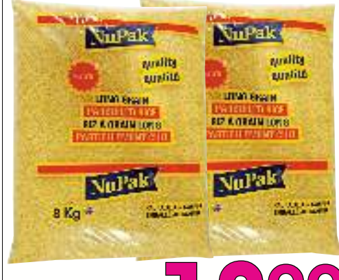
Nupak Parboiled Rice 8 kg