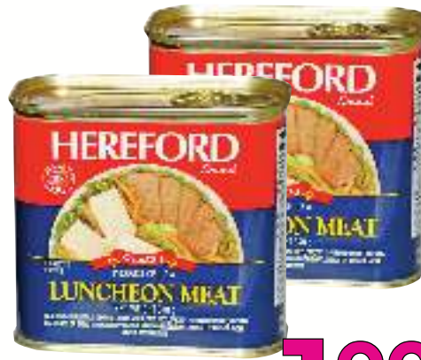
Hereford Luncheon Meat 340 g