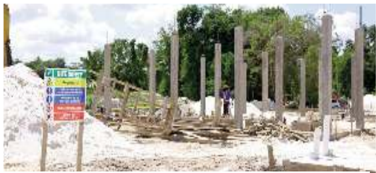
Works ongoing at Five Mile Water Treatment Plant