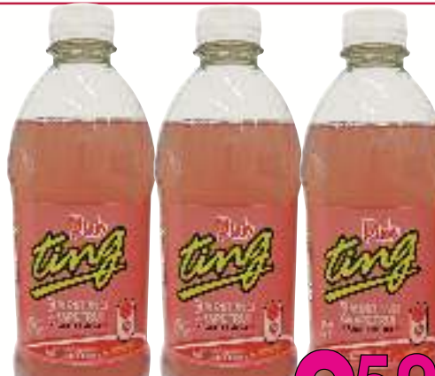
D&G Pink Ting 591 ml