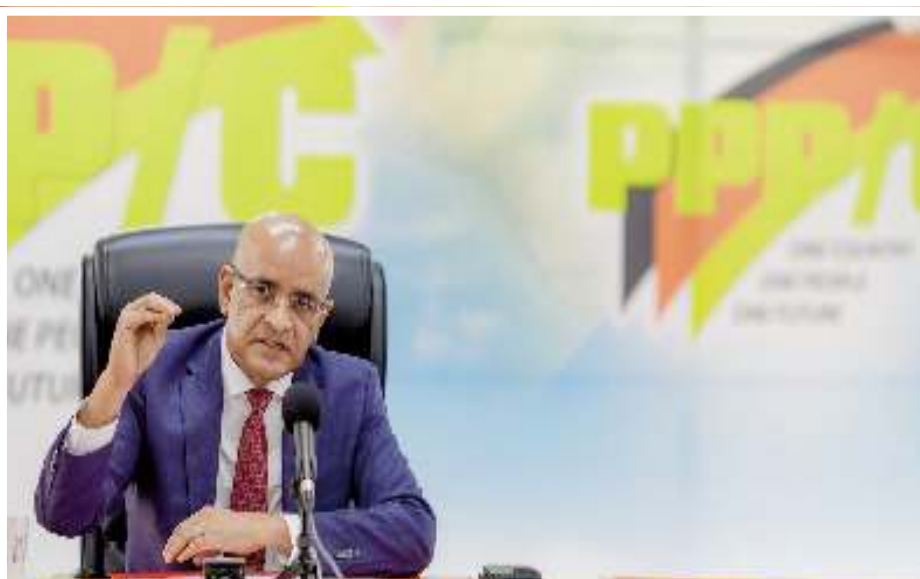
General Secretary of the PPPC and Vice President of Guyana Dr Bharrat Jagdeo.

been some confusion on social media which sought to suggest that the government is either withholding the grant or moving at a snail's pace with its disbursement.