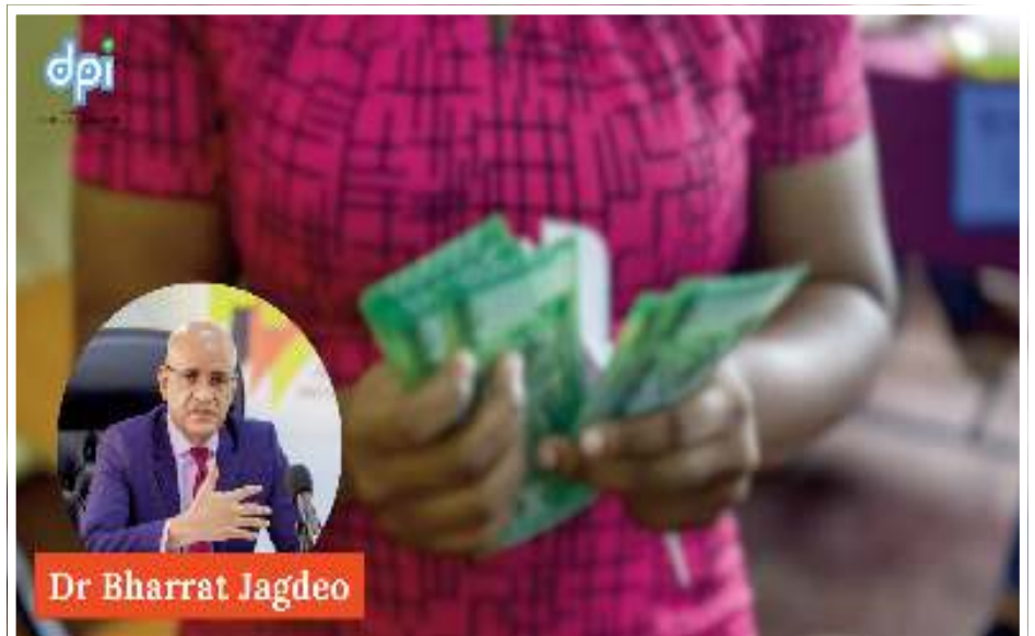
cash grant distribution continues after budget is passed

Dr Jagdeo also clarified that even though the registration process in the regions would have mostly ended, the government is fully aware that not all citizens have