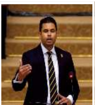
Minister of Culture, Youth and Sport, Charles Ramson Jr

In his contribution to the budget debates 2025, Minister of Culture, Youth and Sport, Charles Ramson Jr underscored the absence of new taxes in the $1.138 trillion budget, which he described as progressive and designed to deliver lasting benefits to the Guyanese people.