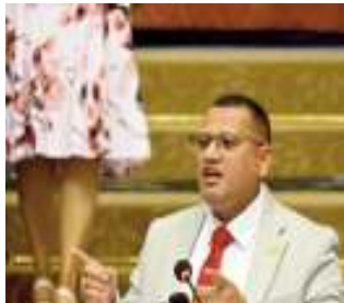
Minister of Housing & Water Collin Croal

The government's proposed $135.7 billion allocation in the 2025 Budget for housing and water is crucial to expanding affordable housing and ensuring reliable access to potable water for Guyanese.