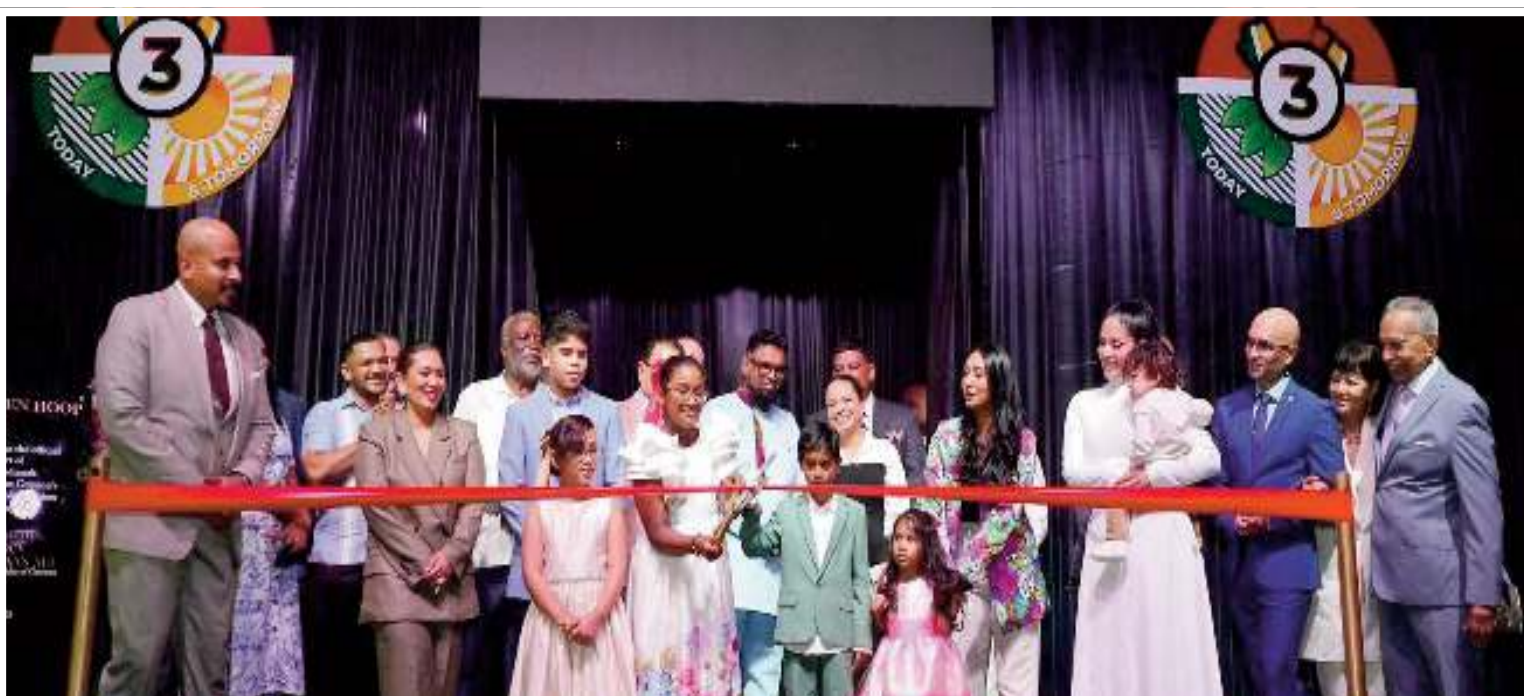
Ribbon cutting for New Vreed-en-Hoop Shore base facility

It forms part of a broader project called the Port of Vreed-en-Hoop.