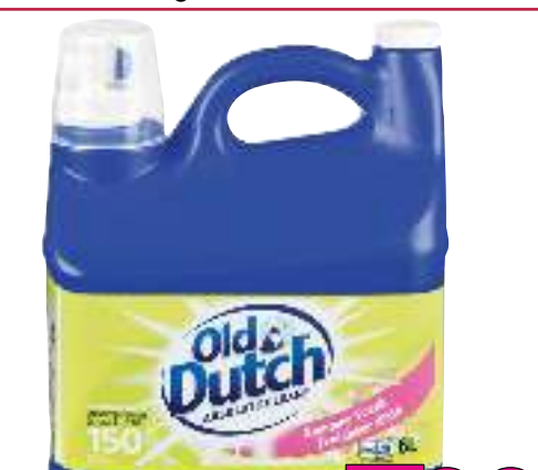
Old Dutch Laundry Detergent assorted 6 L