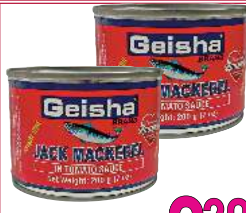
Geisha Jack Mackerels in Tomato Sauce 200 g