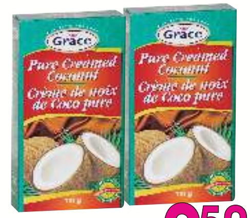
Grace Creamed Coconut 142 g