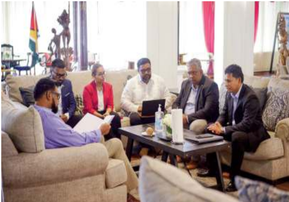
– His Excellency, Dr Mohamed Irfaan Ali meets with PSC

The Private Sector Commission's (PSC) proposed amendments to the landmark Local Content Act of 2021 have been delivered to His Excellency, Dr Mohamed Irfaan Ali for a thorough review. This development comes on the heels of the government's commitment to strengthening the current act, ensuring