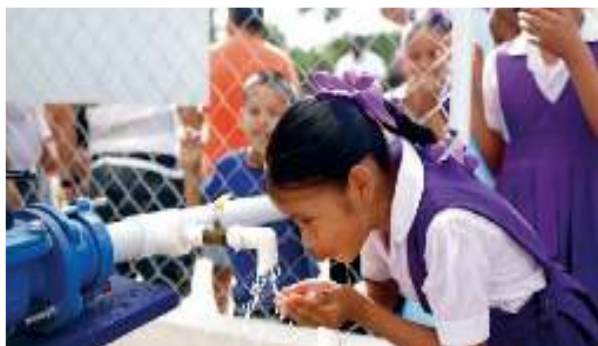
A pupil samples water from the new system

Over 400 residents from Falmouth and New