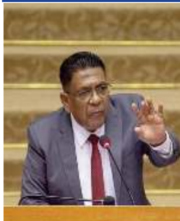
Minister of Agriculture Zulfikar Mustapha Defends Budget 2025

Minister of Agriculture Zulfikar Mustapha has emphasised that Budget 2025 is forward-thinking, setting a strategic direction for the