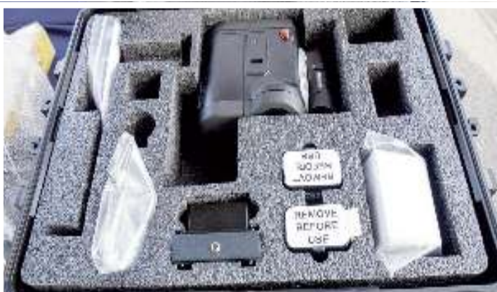
GPF gets $50 million worth of enforcement equipment

prevent drunk driving. We have moved the responsibility from just the reckless, careless person who wants to imbibe and then go on the road to drive," the minister said.