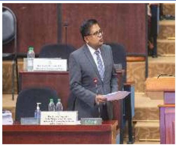
GOVT MPS FIERCELY DEFEND 2025 BUDGET