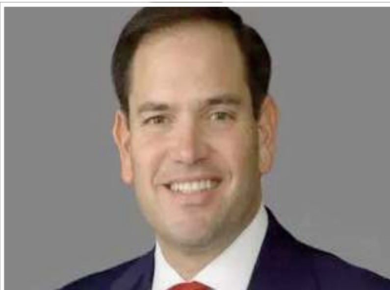
US Secretary of State Marco Rubio

His Excellency President Dr Mohamed Irfaan Ali gave the nation an update on his recent engagement with US Secretary of State, Marco Rubio. The president announced via his Official Social media page the success of the critical engagement.