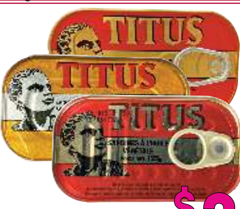
Titus Sardines assorted 125 g