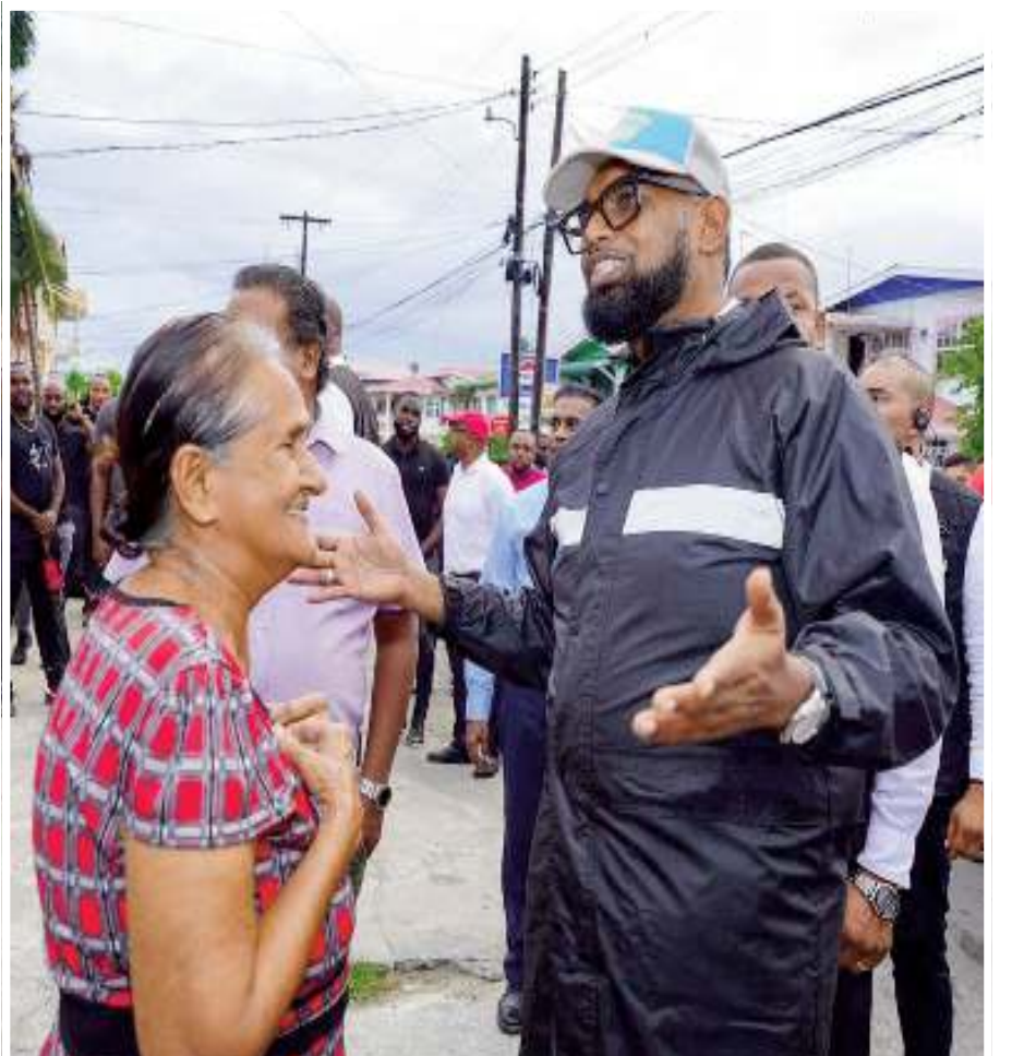
President Dr Mohamed Irfaan Ali engage Kitty Residents