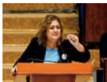
Minister of Education, Priya Manickchand

Minister of Education, Priya Manickchand, highlighted the PPP/C government's efforts include investing $39 billion in educational infrastructure over the last four years and construction of 28 new secondary schools.