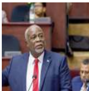
Prime Minister Brigadier (Ret'd) Mark Phillips during the budget debates in the National Assembly

The PPP/C's massive track record of delivering tangible results and developing underserved communities extends beyond coastal development and touches every citizen across Guyana.