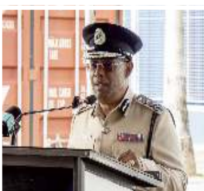
Commissioner of Police, Clifton Hicken

The Guyana Police Force (GPF) received enforcement equipment valued at approximately $50 million to boost its traffic management and road safety efforts.