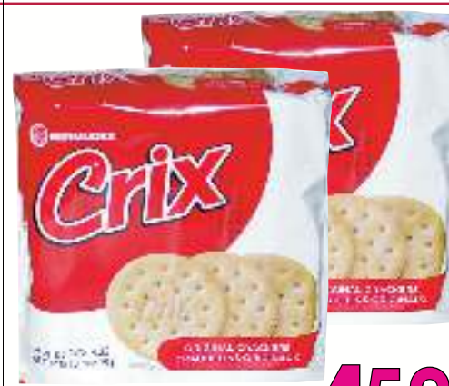
Crix Crackers 288 g