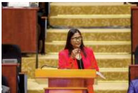
Member of Parliament (MP) Bhagmattie Veersmammy

Member of Parliament (MP) Bhagmattie Veersmammy described Budget 2025 as 'people-centred,' and one that promotes women's