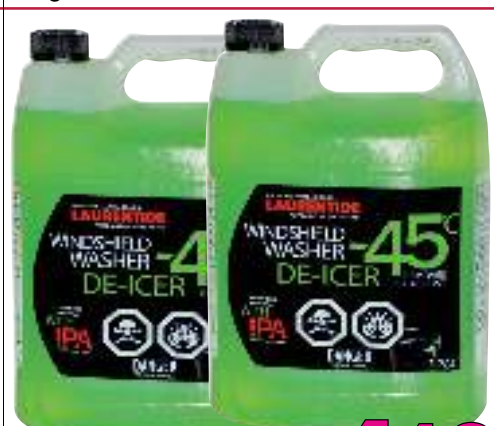
Laurentide Windshield Washer -45 3,78 lt