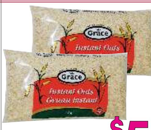
Grace Instant Oats 1 kg