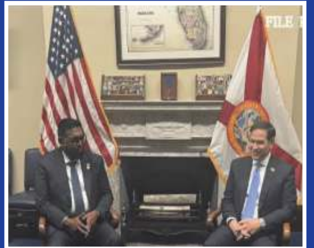
GUYANA AND U.S. TO PARTNER TO COMBAT ILLEGAL IMMIGRATION, GUARANTEE REENTRY FOR DEPORTED GUYANESE