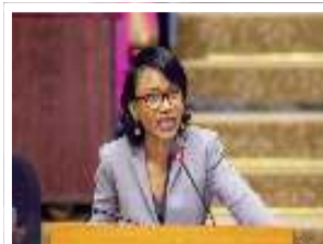
Minister of Tourism, Industry, and Commerce, Oneidge Walrond

Minister of Tourism, Industry, and Commerce, Oneidge Walrond reaffirmed the government's commitment to fulfilling its promises, describing its record as one of 'delivery, competence, execution.'