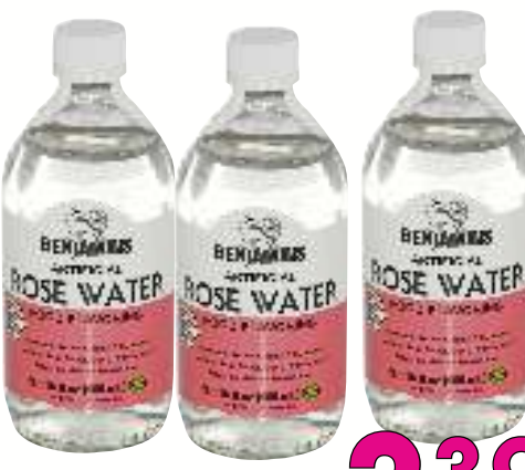
Benjamin's Rose Water 480 ml