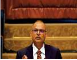
Minister Dr Frank Anthony

Minister of Health Dr Frank Anthony has reaffirmed the PPP/C government's commitment to strengthening Guyana's