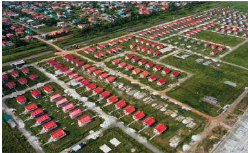
A new housing estate in Guyana

What is important to understand is that the resources generated from the sale of lands to private developers were for