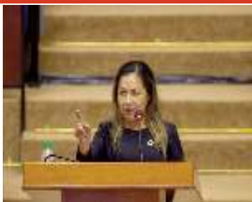
Minister of Amerindian Affairs, Pauline Sukhai

Minister of Amerindian Affairs, Pauline Sukhai has reinforced the People's Progressive Party/Civic role as the party that works in the people's best interest, particularly the First People in her defence of the $1.382 trillion fiscal framework.