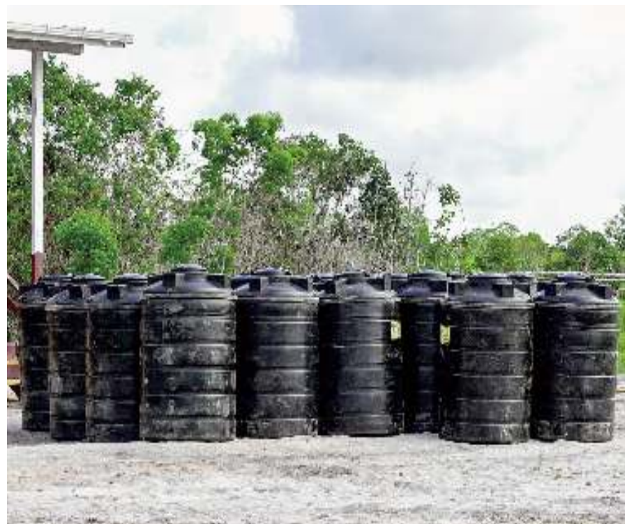
improved access to water for Residents of Silverhill

way for the community. The tank distribution along with all other promised interventions is a testament to the government's responsiveness to the needs of the Guyana's communities and its commitment to improving the lives of its