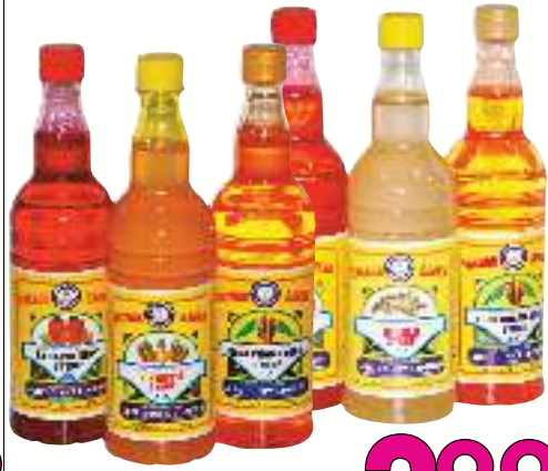
Anchor Brand Syrup assorted 750 ml