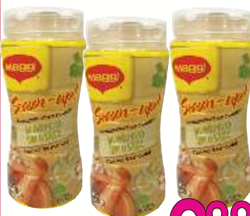
Maggi Season-Up All Purpose Seasoning 200 g