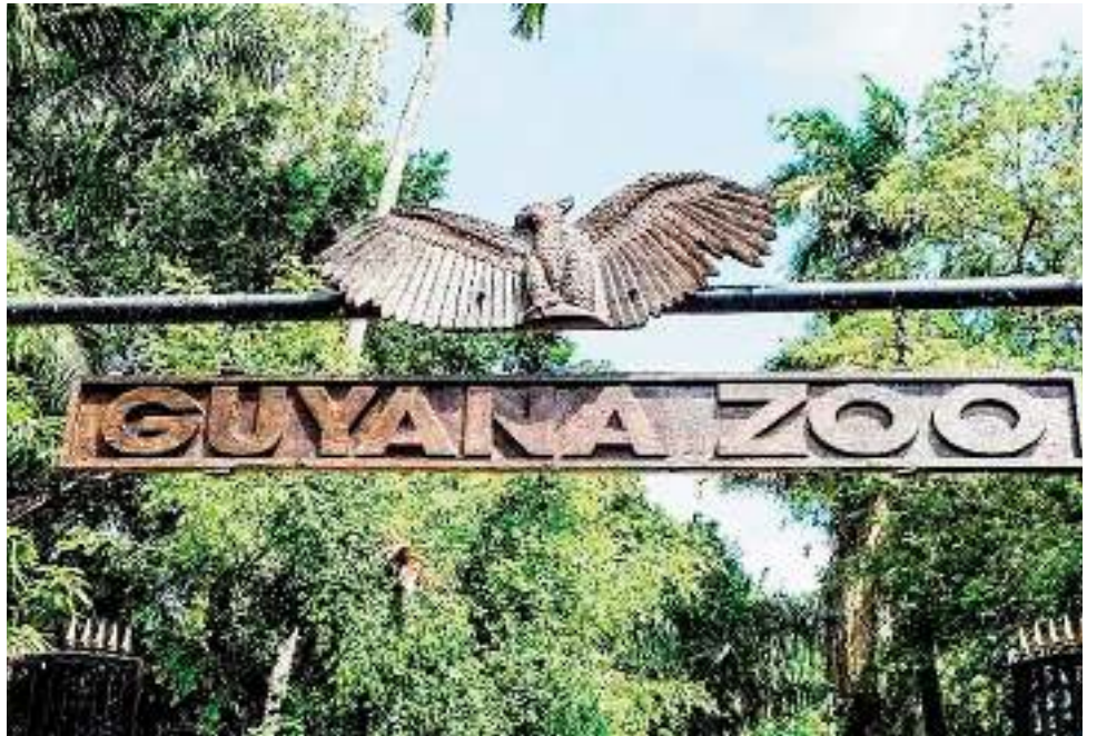
Donald Trump takes the oath of office on Monday

Further, the park is expected to undergo a significant redesign to highlight Guyana’s diverse plant species. Rare and endangered plants will be preserved and the gardens will feature specialised areas for medicinal plants, native fruit trees, and ornamental flora. Pathways will be refurbished to accommodate guided tours.