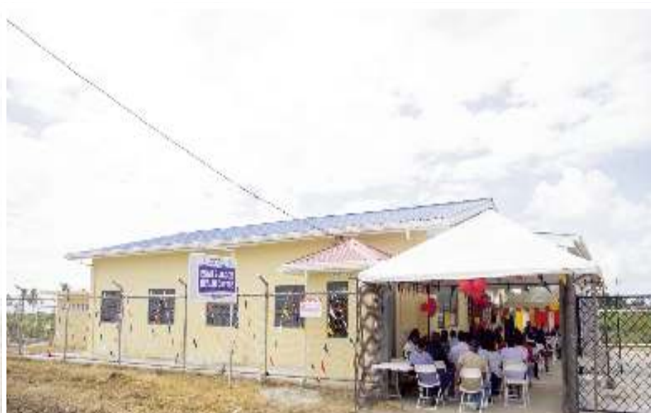
$37M health centre opens at Esau and Jacob, Region Five

commissioned a new health centre valued at about $37 million