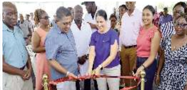
state-of-the-art laboratory and office were commissioned for the Guyana Food Safety Authority (GFSA) at La Bonne Intention

ceremony, Minister of Agriculture Zulfiqar Mustapha underlined that the opening of the laboratory reflects the government's dedication to safeguarding public health and encouraging food safety nationwide.