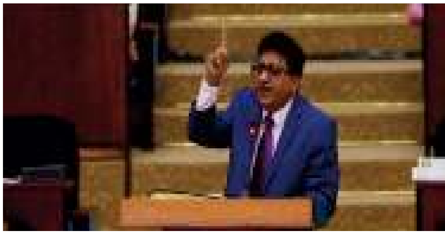
Attorney General & Minister of Legal Affairs Anil Nandlall

The PPP/C government has secured the trust of Guyanese, and established a track record of delivering on its promises due to its prudent people-centred policies and programmes.