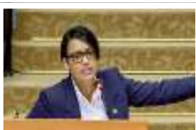
Minister within the Ministry of Housing and Water, Susan Rodrigues

In a passionate address to the National Assembly, Minister within the Ministry of Housing and Water, Susan Rodrigues, reinforced the government's relentless dedication to prioritising the betterment