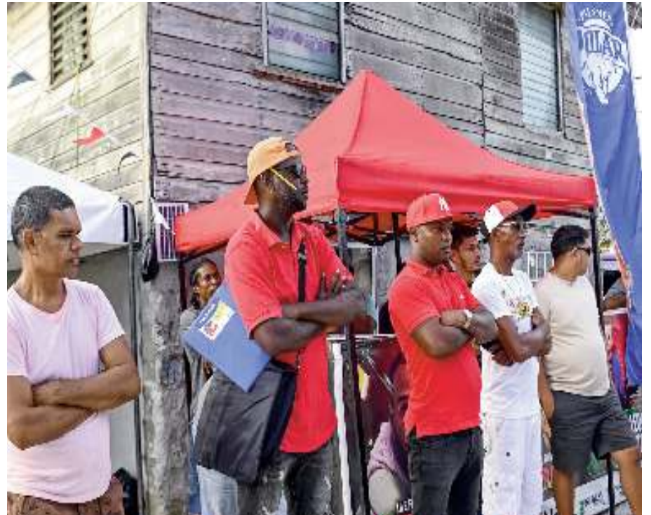
Some of the residents of Timehri Dock at the community meeting

remains steadfast in its philosophy of engaging directly with Guyanese