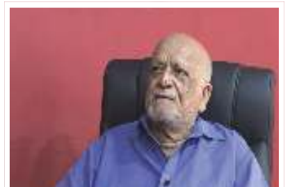
Chief Executive Officer of the Kayman Sankar Group of Companies