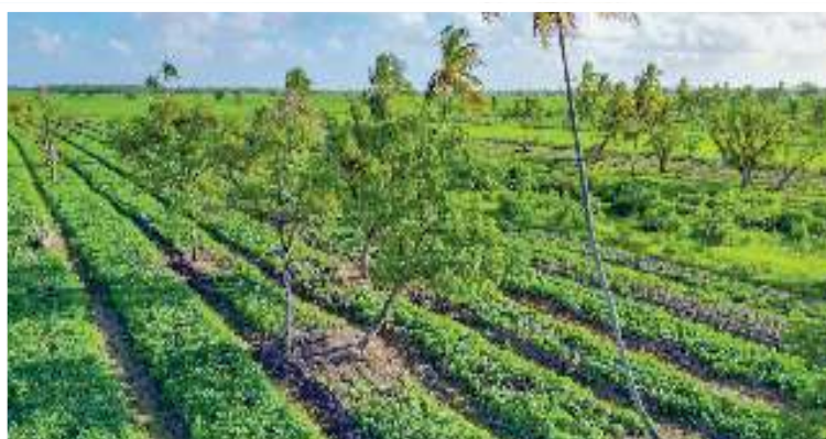
Land cleared in Dartmouth for red bean cultivation

President Dr Mohamed Irfaan Ali announced that 300 acres of dormant