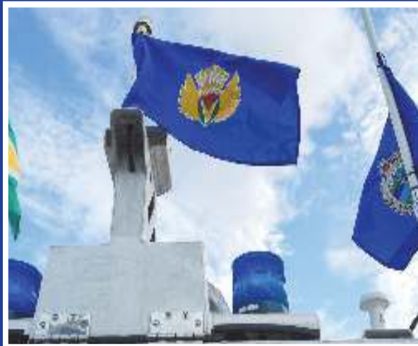
MASSIVE US$300M VREED-EN-HOOP SHORE BASE COMMISSIONED