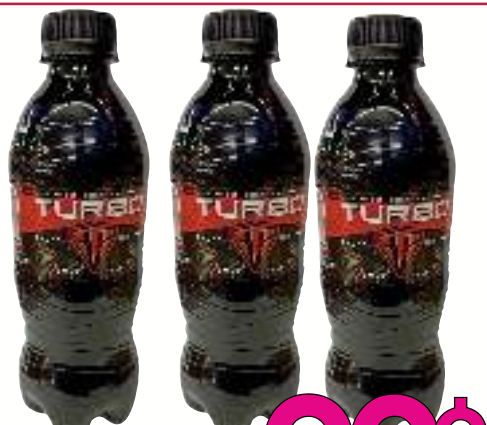
Turbo Energy Drink 370 ml