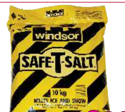
Windsor Safe-T-Salt Ice Melt Salt 10 kg