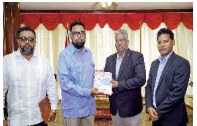
The booklet with recommendations was presented to the president by the PSC

According to the president's official social media page, the proposals were put together by the commission, following an extensive two-year countrywide consultation process