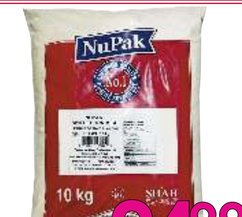
Nupak White Corn Meal 10 kg