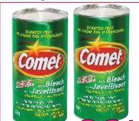
Comet Powder Cleanser 400 g