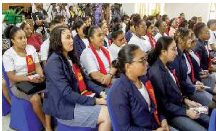
4 new training programmes launched at the Cyril Potter College of Education's (CPCE)

The Ministry of Education has officially introduced four new training courses to the Cyril Potter College of Education's (CPCE) curriculum.