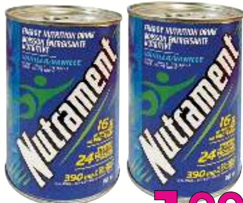
Nutrament Energy Nutrition Drink Vanilla 355 ml