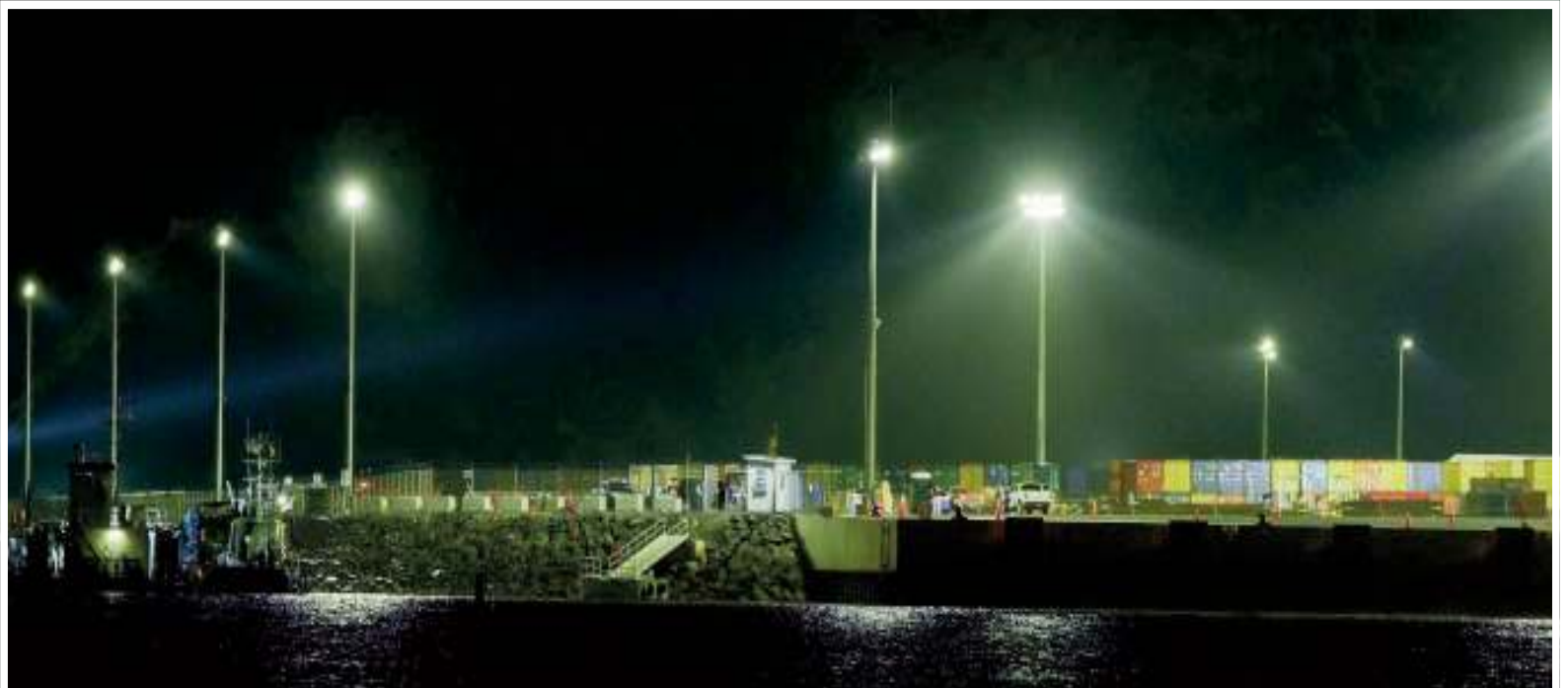
massive US$300 million Vreed-en-Hoop Shorebase Inc commissioned