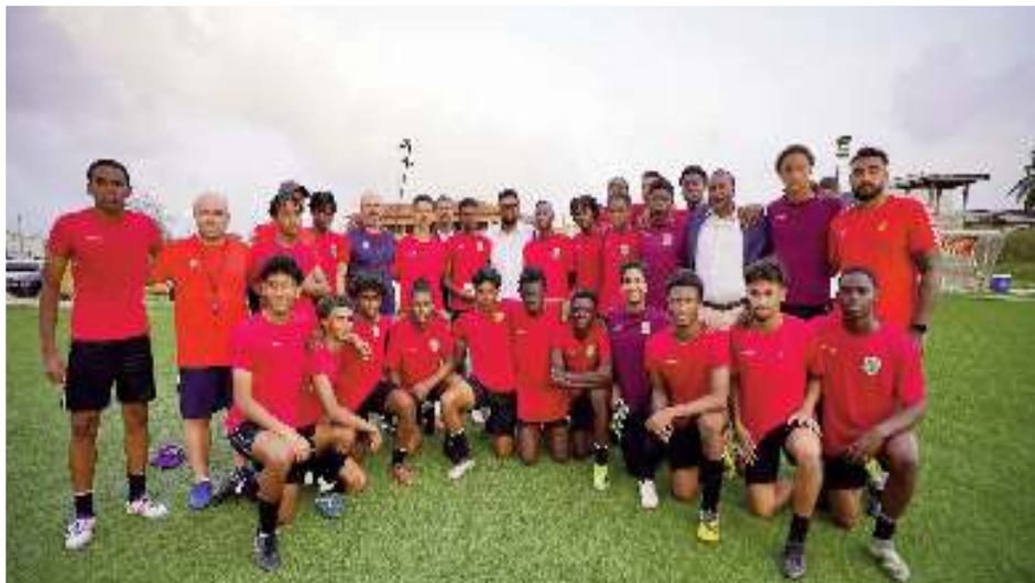
President Dr Mohamed Irffan Ali and Junior Jaguars