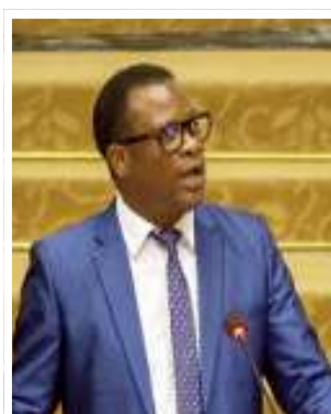
Minister of Foreign Affairs and International Cooperation, Hugh Todd

Minister of Foreign Affairs and International Cooperation, Hugh Todd, revealed during his presentation for the 2025 budget debates, that between 2020 and 2023, Guyana's exports increased by a massive 285 per cent, moving from US$2.8 billion to US$10.8 billion.