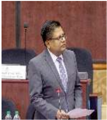
Senior Minister in the Office of the President with Responsibility for Finance and the Public Service, Dr Ashni Singh

Responsibility for Finance and the Public Service, Dr Ashni Singh concluded the week-long budget 2025 debates with a fiery two-hour address, eviscerating the arguments put forward by the opposition parliamentarians.