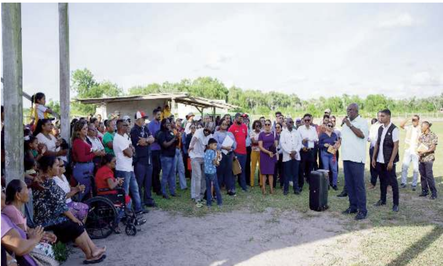
Prime Minister Brigadier (Ret'd) Mark Phillips engages the people

Prime Minister Brigadier (Ret'd) Mark Phillips clearly stated that the whopping $1.38 trillion budget proposed in the National Assembly