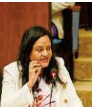
Minister of Human Services and Social Security Dr Vindhya Persaud

Minister of Human Services and Social Security, Dr Vindhya Persaud firmly defended the 2025 budget in the National Assembly during the debates. Dr Persaud refuted claims made by the opposition that the budget does not support senior citizens