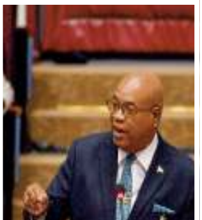
Minister of Public Works, Bishop Juan Edghill makes his presentation during the budget debates

As the 2025 budget debates continued in the National Assembly, Minister of Public Works Bishop Juan Edghill boasted of the governments energetic and robust infrastructure development programme