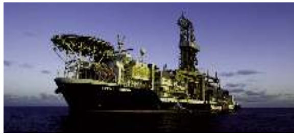
Guyana to chair a global coalition of the world's newest oil-producing nations