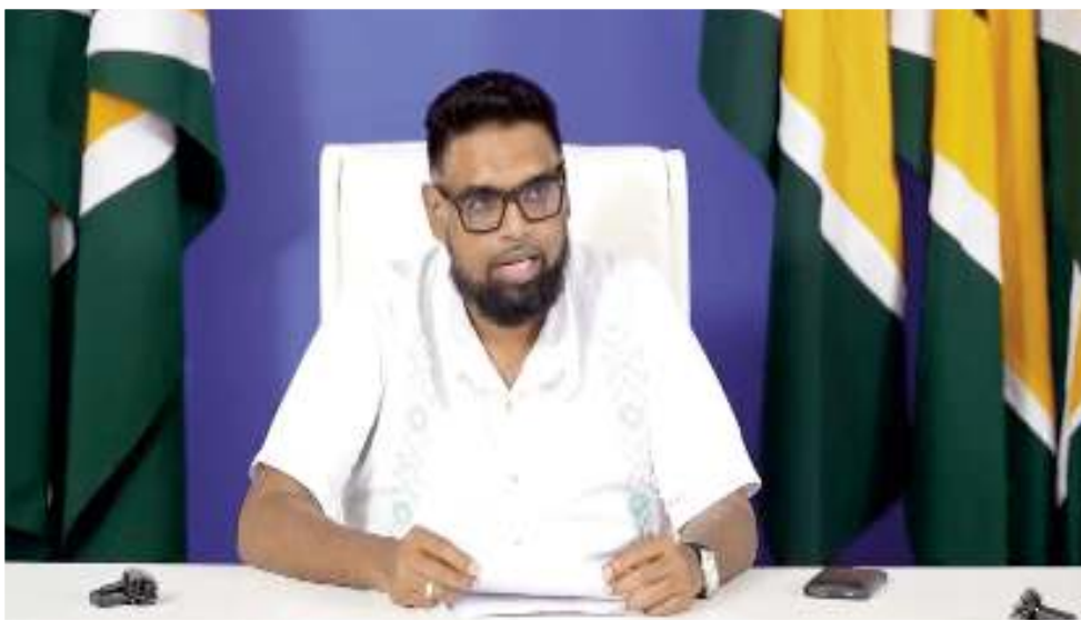
President Dr Mohamed Irfaan Ali addresses the nation

With Budget 2025, Guyana is poised to continue this transformative journey, securing its place as a beacon of sustainable growth and resilience on the global stage.