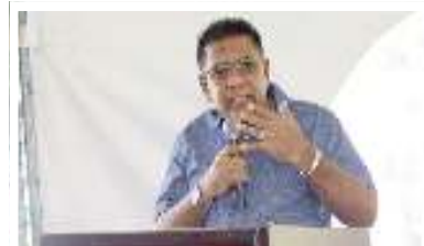
Minister of Agriculture Zulfiqar Mustapha delivers remarks at the commissioning ceremony

Equipped with cutting-edge technology and specialised equipment, the laboratory has the capability to test various commodities, and can also do multifaceted traceability studies to keep ahead in the