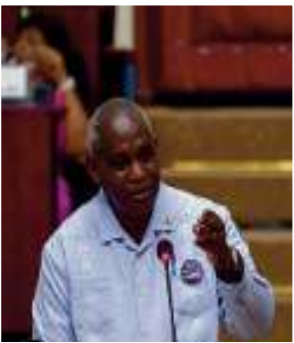
Minister of Home Affairs Robeson Benn defends Budget 2025