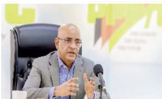
Vice President Dr Bharrat Jagdeo

Vice President and General Secretary of the People's Progressive Party, Dr Bharrat Jagdeo has stated that Guyanese who reside in the United States (US) illegally, and who may be deported,