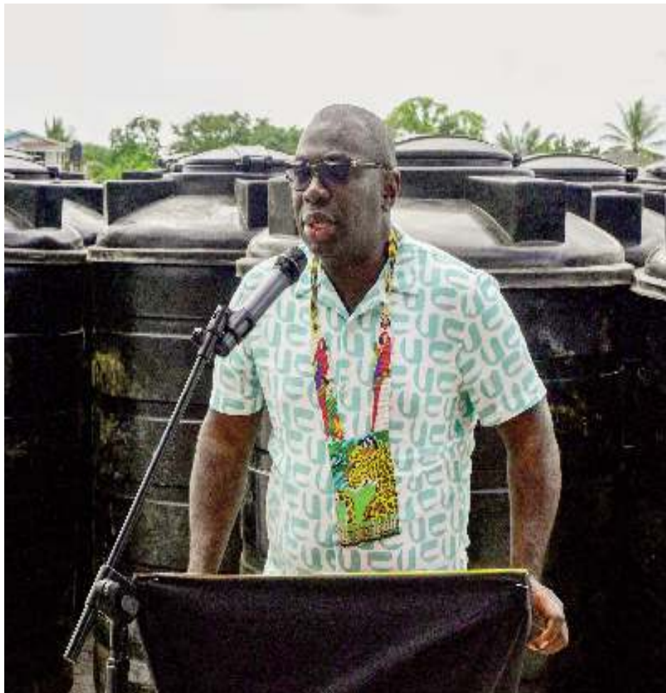
Minister within the Office of the Prime Minister with responsibility for Public Affairs, Kwame McCoy

Residents of Silverhill on the East Bank of Demerara are now experiencing improved access to water following the distribution of 159 new black water tanks.