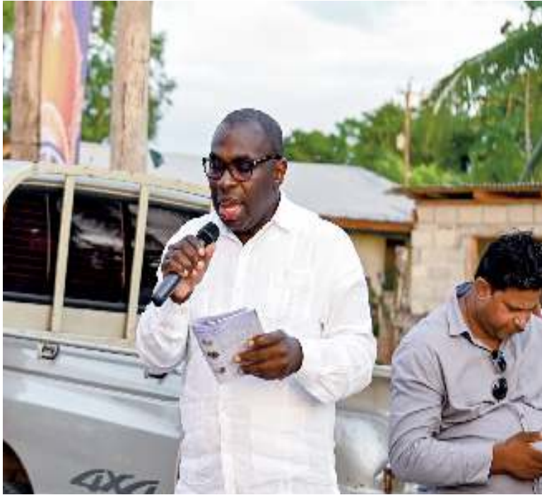
Minister within the Office of the Prime Minister with Responsibility for Public Affairs and Information,

neighbourhood. He also encouraged them to seize opportunities provided by the government to further their development.