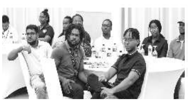
Participant at the training exercise

"We are emphasised. splurging , but we also