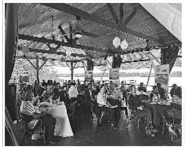
Stakeholders at the meeting