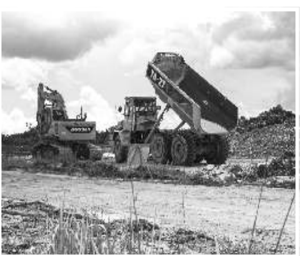
Regional food hub works advancing

(NCB) Procurement and Tender procedures outlined in Administration Board at the Procurement Act the Ministry of Finance