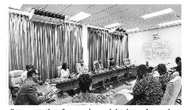
Representatives from various ministries and agencies participating in Guyana

development growing between France, sectors