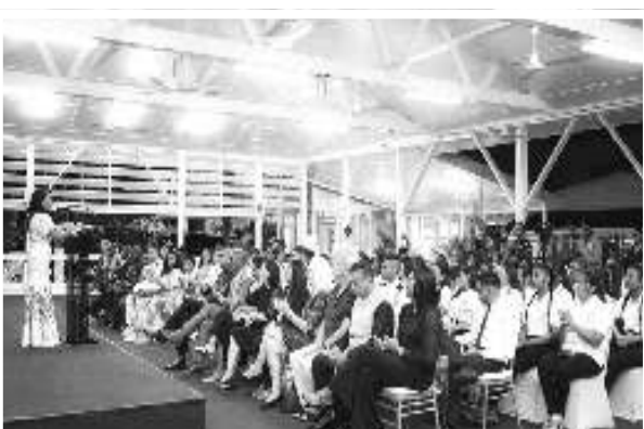
A section of the small gathering at the graduation ceremony

Forty women from Basic Safety Training gender disparity in the gas, hinterland (BST) and Ship Security workforce, with women's shipping , nated from Awareness Training. participation at around logistics ," are 50% compared to men's stated. programme funded by accredited by Guyana's 80%."Theprogramme the Office of the First Maritime Administration aims to address the course selection growing competition second group to benefit and the Maritime underrepresentation Guyana Skilled Labour to Guyana's economic