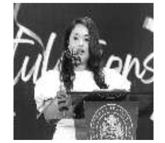
First Lady Mrs Arya Ali delivering remarks at the graduation ceremony held at the Baridi Benab, State House

AAMOTI's Managing and in partnering with the the First Lady's office. "The of First Lady continues areas to lead the charge in