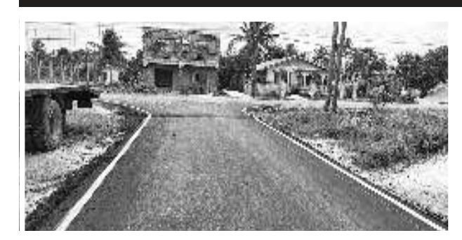
Upgraded infrastructural works in Linden, Region Ten

government improve connectivity, ($12.4 million). accessibility, and quality of life for residents.