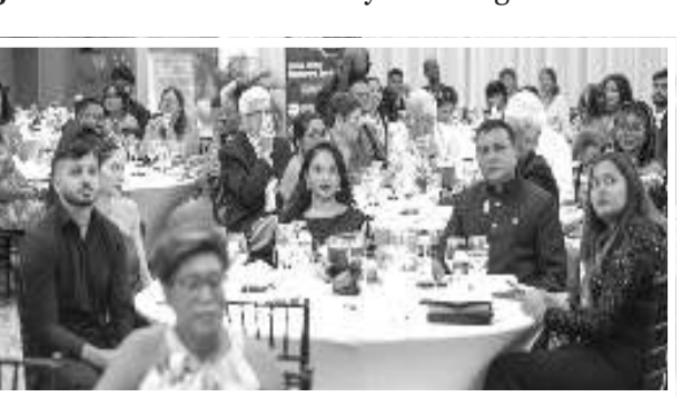
Stakeholders at the President's Awards Dinner & Auction of the Tourism and Hospitality Association of

League economic impact of sporting T20 over $20 billion."