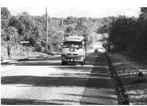
The Soesdyke-Linden highway

apartment 100 homes for young that condos, professionals, restaurants, already begun.