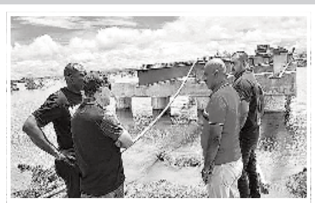
Bridge assessment and repairs ongoing in Region Nine

The Ministry Public Works is repairing three bridges