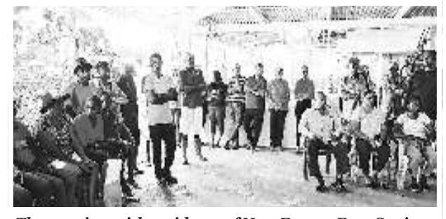
The meeting with residents of New Forest, East Canje Berbice

"It is not the objective of the government to fight people," he clarified. The government has a power in law and the government is exercising that power. Right now, properties those owned are by the government by an order published under Compulsory the Acquisition for Public Purposes Act... those persons living there and who are refusing to move... are now living there illegally."