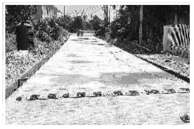
Upgraded infrastructural works in Linden, Region Ten