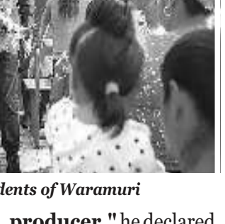
President Alii greeting residents of Waramuri

President agricultural pointed out that White producing a substantial access pounds 30,000 However, cassava. emphasised the government's goal of Large-scale achieving even greater