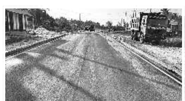
Upgraded infrastructural works in Linden, Region Ten

• Henry's Road: & Enterprise and General Duke Broad Money Construction for $25.9