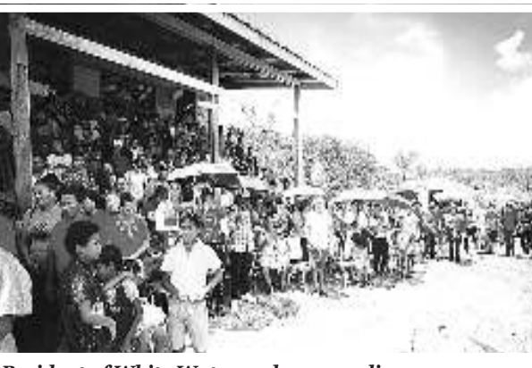
Resident of White Water and surrounding communities

The outreach programme included a forum for residents to voice their concerns and engage in discussions with the president.