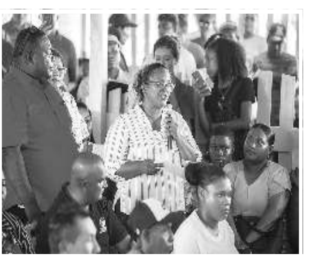
The meeting in Canal Bank

The National revealed, Agricultural Research government's and Extension Institute products almost $500 million