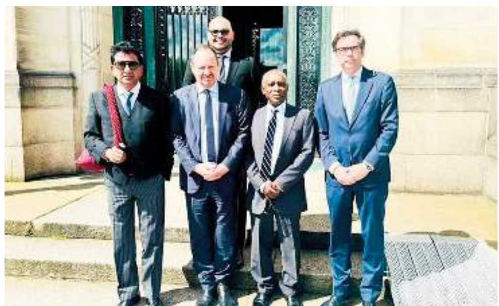
Guyana's team before the International Court of Justice