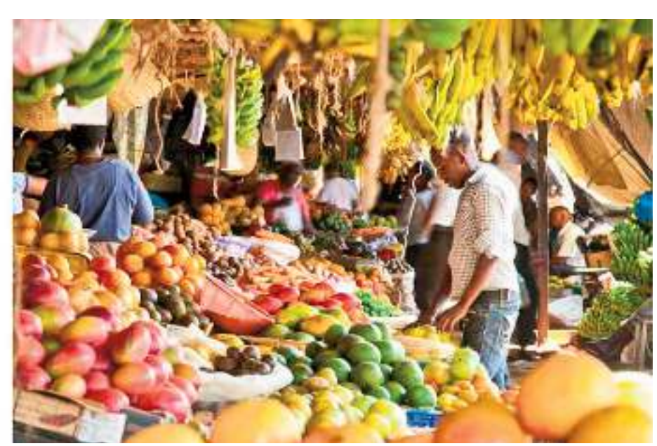
Guyana is among 8 Caribbean countries to benefit from the fund

"Integrating efficient and affordable practices and technologies such as renewable energy for solar pumps for irrigation, and digital agricultural sensors have also been piloted to improve overall crop management. With the impact of climate and weather hazards, we have introduced Anticipatory Action protocols which are integrated with national Agriculture Disaster Risk Management and Climate Information Services."