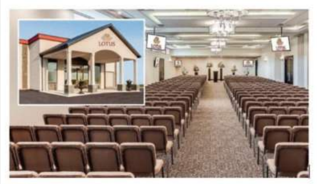
Seating for more than 500+ guests!

121 City View Drive North of Belfield Road, East side of Highway 27 647-547-8188 www.lotusfuneralandcremation.com