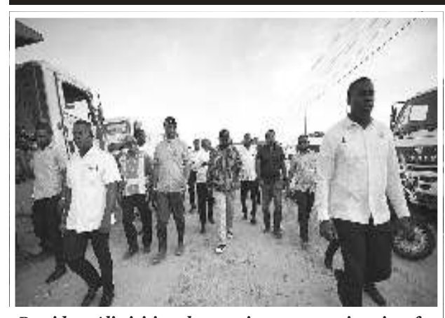
President Ali visiting the ongoing construction site of the Ogle-Eccles four-lane highway

<u>Guyanese diaspora digest</u> KEEPING THE DIASPORA INFORMED