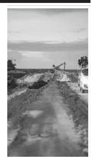
Work ongoing on the Ogle-Eccles four-lane hiahwau