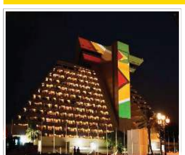
The Embassy of Guyana in the State of Qatar hosted its first Independence Day reception

the colours of Guyana's Protocol hosted Independence The venue, the Sheraton festivities. Hotel, transformed into a vibrant celebration of Ambassador, Guyanese culture.