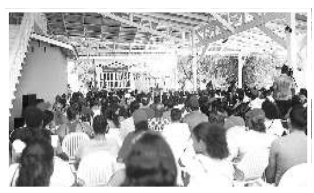
Residents turned out at Timehri Base Road to receive their land titles

world," President Ali President announced. acknowledged. "People but it's complex. communities We are confronting representatives centred."