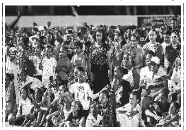
Part of the audience at the ceremonu

"Because We Care" grant future conversations.