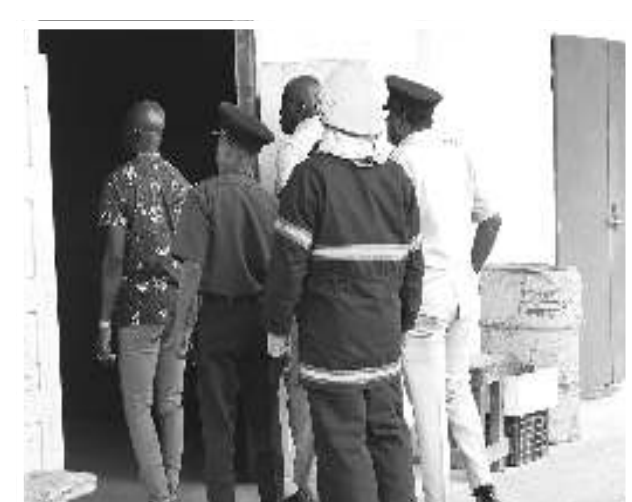
Minister of Home Affairs Robeson Benn and Fire Chief (ag) Gregory Wickham inspecting facilities at the run

Budget allocated $4.3 billion to the GFS, with $505 million dedicated specifically to upgrading and building new fire stations. Fire stations in Leonora, Diamond, and Bartica are all expected to be completed this year.