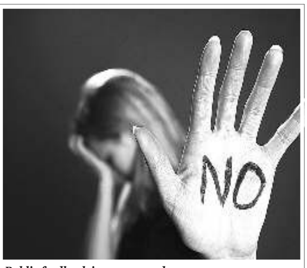
Public feedback is encouraged

General, Mohabir Anil commitment to inclusive urged the parliamentary read the bill the night that view, to put