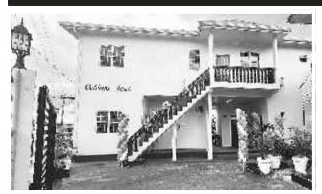
New Children's Court and Child-Friendly Room at

General is and Minister of Legal all sectors of our Affairs, Anil Nandlall, country," celebrated the opening Nandlall said. "The of a new Children's Court legal in Wales, West Bank obviously very much Demerara, calling it a at the forefront of "We many times in our about transforming specifically designed to Guyana, and that handle cases involving transformation children