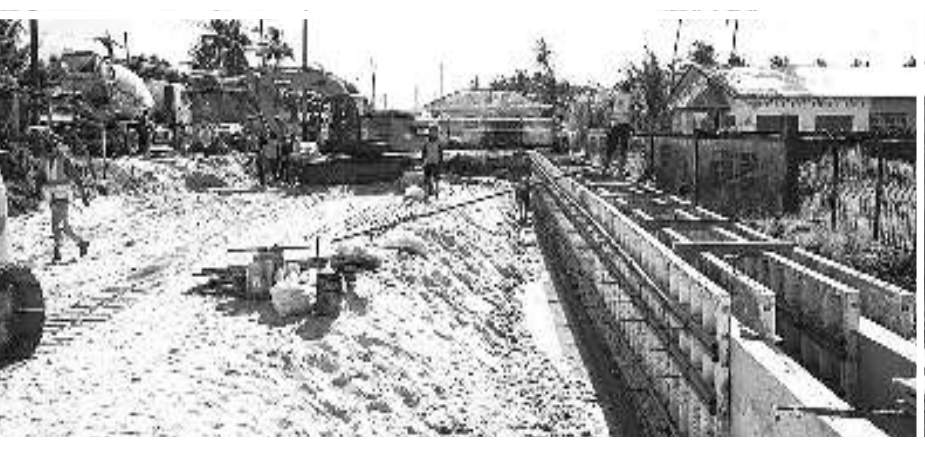
Ongoing works on the Conversion Tree Road project