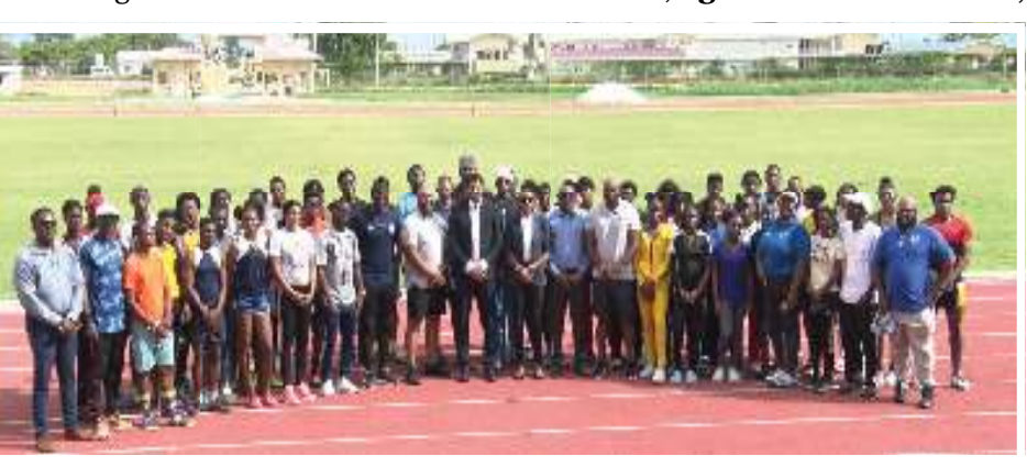
Minister of Culture, Youth and Sport Charles Ramson Jr and officials of the National Sports Commission with participants of the programme and coaches

The Ministry of Austin said, praising Ramson, emphasised building now for the his confidence in the it, this is what we are government's 2028 Olympics." The potential of the athletes. doing," he continued. to programme, according "We believe we have "We are helping you investing in its future its crucial role in his cultivating local talent. to Minister Ramson, gold