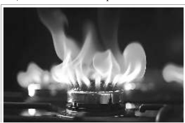
The government's plan to expedite natural gas monetisation in January of this year

platform; January of this year. The selection process in a viable project and we move forward with a