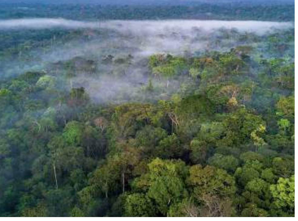
Guyana produced 446,000 cubic metres of timber products in 2023

More importantly, in 2023, Guyana's forestry sector generated a gross domestic product of approximately US$86.32 million. With an expected growth of 3.9 per cent in 2024, the sector's GDP is projected to increase to around US$89.68 million. This growth is driven by sustainable practices and increased timber produc-