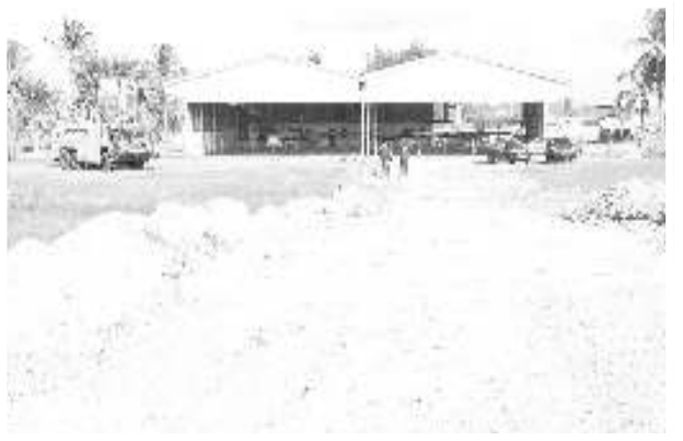
not only benefit airport New Fire Service Outpost to be constructed at CJIA

This recruitment drive soon, reflects the government's the airport's expanded commitment to safety infrastructure. It's part