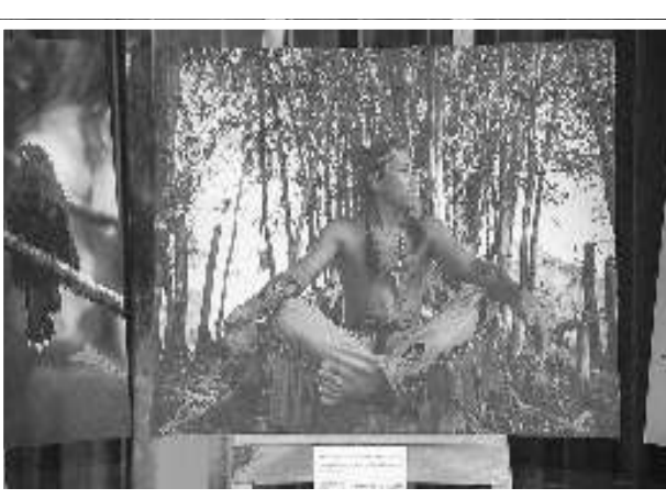
An image of what the visual book consists of

President Consultants the Foundation. He stressed Chronicles