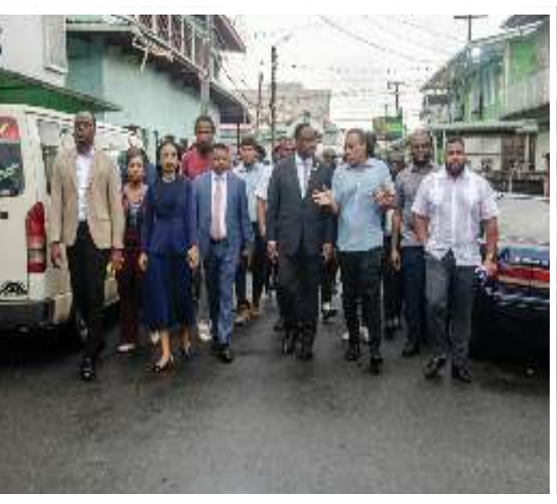
US Congressman, Jonathan Jackson visiting the community\ of Albouys town

Concrete examples of this progress include infrastructure upgrades