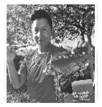
A total of 100 books have been printed and are currently being distributed to key stakeholders

With only printed The book's launch achievement, but also the EU. A first conservation efforts.