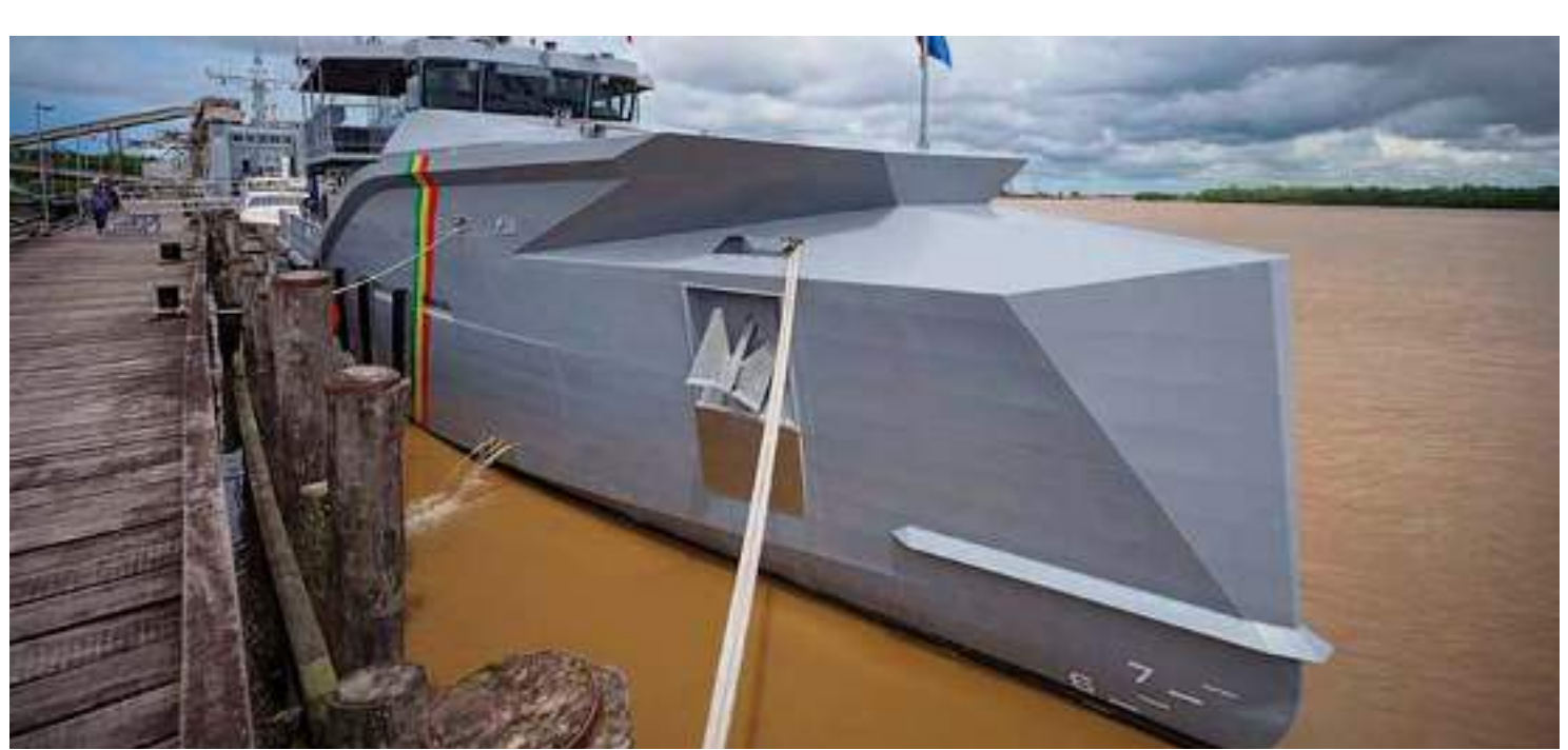
The GDFS Shahoud, named for a GDF officer who perished in a helicopter crash last year

In his address, he emphasised the vessel's role in protecting the country's territorial integrity, sovereignty, and the valuable resources within its maritime waters. He noted that the commissioning of the 'GDFS Shahoud' is not just an addition to the fleet, but is also a celebration of the strong bilateral relationship between Guyana and the United States, aimed at integrating and expanding asset ranges and enhancing human-