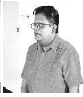
Minister Dr Ashni Singh speaking during the meeting

expect This decision follows posts are planted connection is anticipated comfort in their homes, to bring a multitude improved security, and the of benefits to the the potential to increase highlighted installation of these community. Residents productivity. This, in turn, can contribute the country's