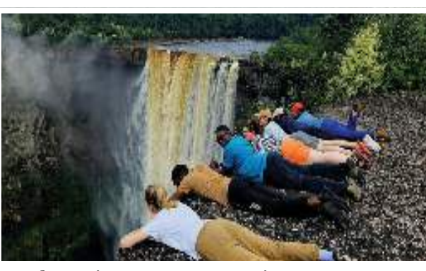
North American Fam Group at Kaieteur

Multiple and week-long provided opportunities journalists adventure began in to encounter Guyana's significant