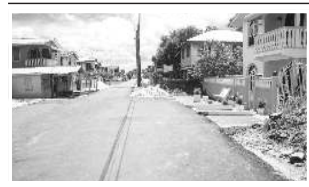
Completed Road works in Grove, East Bank of Demerara

Grove residents are dilapidated roads. celebrating a much-Works' Special Project said