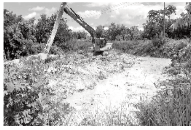
Drainange work being excuted in Region 10

billion over the past four for the years in Region Ten's maintenance.