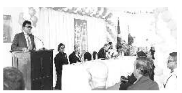
AG Nandlall delivering remarks at the opening ceremony for the Wales Children's Court and Child-Friendly Room

Minister deficiencies Nandlall pledged the during collaboration with the iudiciary to improve the iustice system, Nandlall particularly with a focus on rehabilitation for P r o p o s e d violence-related crimes.