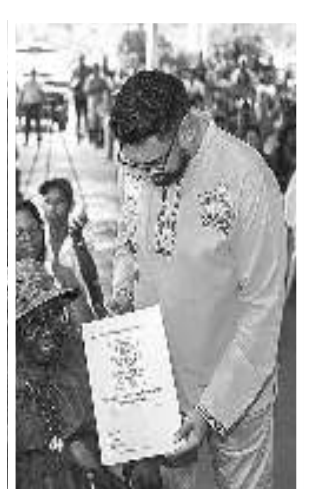
The distribution of the land ownership document

are the four-lane road are already to extend the road further, and the