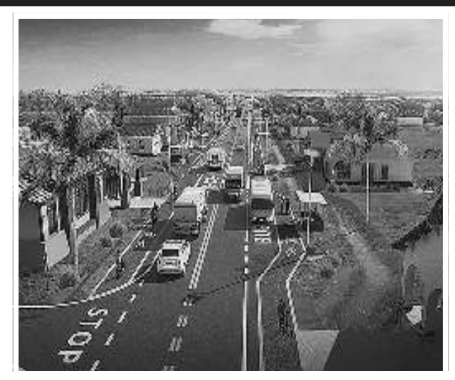
A 3D view of the Good Success to Timehri roadway

Highlighting and that the citizens importance of efficiency, get value for money," Minister Edghill made a Minister Edghill clear statement: "When [government] stakeholder engagement. say 36 months for 36-month a contract, that's undertaken the end date. If you by China Road and [contractor] can get Corporation it done faster, get it (CRBC), involves the done faster. It doesn't rehabilitation of 23.7 mean you are going