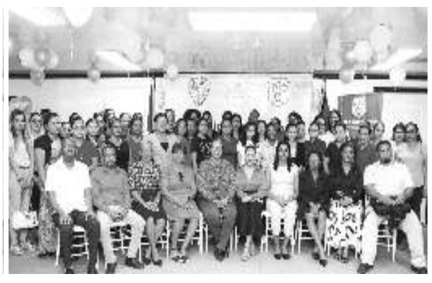
First Lady, BIT partner to train 45 Region Two women in cosmetology

The training will micro-enterprise cater to women from equipping Grant Success, Grant Sand