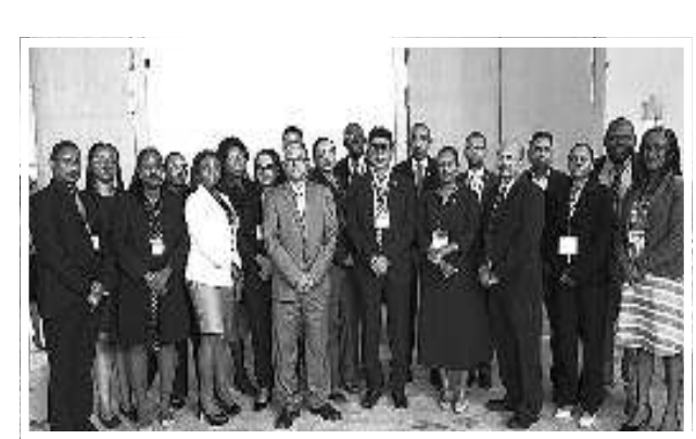
The Guyanese delegation

logistical challenges, farmers. and that the ongoing territorial dispute with outlined geopolitical issue.