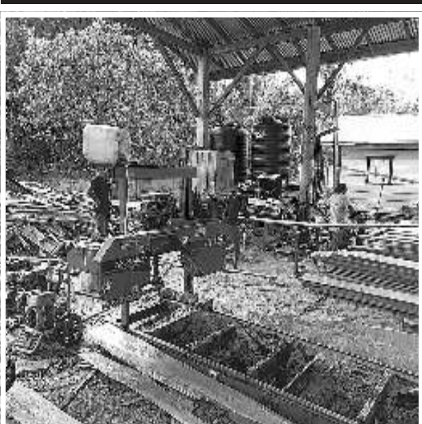
An $8M carbon-credit funded sawmill in Karrau Village which has provided employment opportunities

2030, (LCDS) cornerstone of initiative, was developed consultations villages.