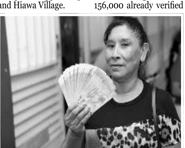
Hinterland resident receiving the grant

grants. Minister Croal 90% of cheques have that encouraged recipients already been distributed. about ensuring that 12,000 residents in to use the funds wisely, Prime Minister Brigadier you share in the Region Seven are already emphasising the (Ret'd) Mark Phillips, prosperity of this enumerated and cheques Local nation." with purchases that enhance Government Minister Sonia Parag, supervised PROGRESS ACROSS the process earlier this month. Distribution points included the more than 221,000 individuals unable to Tabatinga initiative Complex, Nappi Village, for the cash grant, with enthusiastically and Hiawa Village.