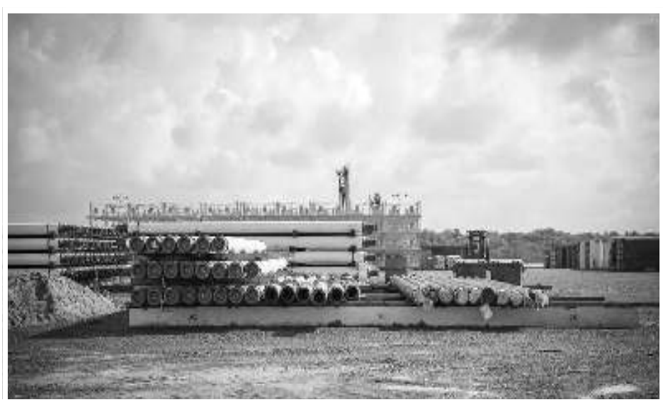
Part of the site visit

During presentation at the facility, officials informed President Ali of the shore base's potential Proposed container port, and to Guyana. dry dock, which would