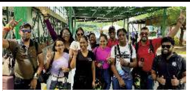
DPI was part of a 10-member team of media professionals and influencers who journeyed to Grenada

The it an affordable option (DPI) recently explored exploring historic sites, Island Beach Resort, as connection,