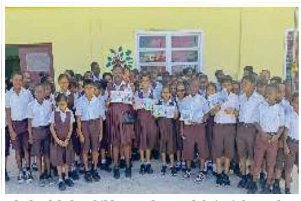
The book helps children understand their rights and how to stay safe

addressing topics Act, making it accessible in a relatable and and engaging for young straightforward manner, particularly Safe and Strong Together primary school students. fosters an environment and Domestic Violence informed and confident Policy Unit spearheaded about their rights. The the initiative, conducting initiative aligns with the broader reading government's violence.