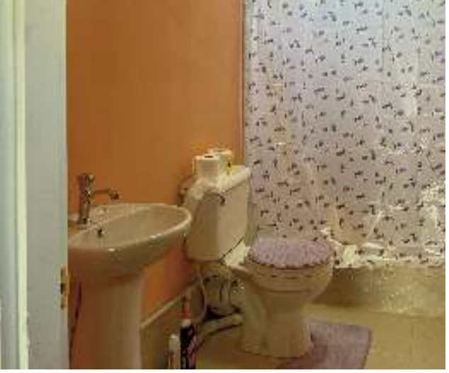
The interior of the house

The Guyana Tourism Authority (GTA) hosted a thrilling Junior Cooking Showcase, where talented young chefs from Regions Five, Six, and Nine competed for culinary supremacy. The event aimed to inspire the next generation of culinary professionals and promote Guyana's burgeoning tourism industry.