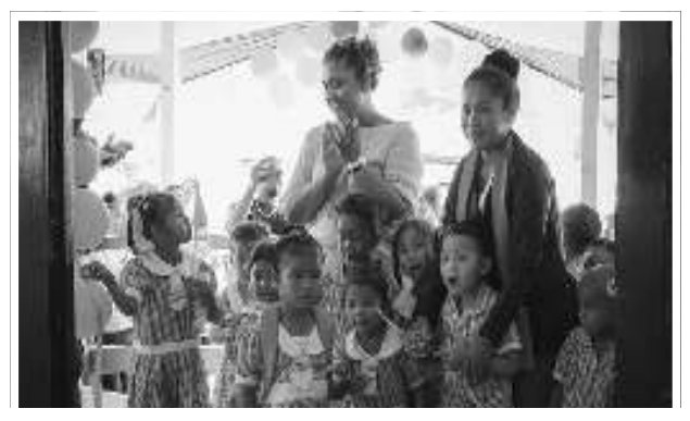
The commissioning in Monkey Mountain

"It ensures children initiative to construct 16 from can stay in their secondary schools across villages, education, including