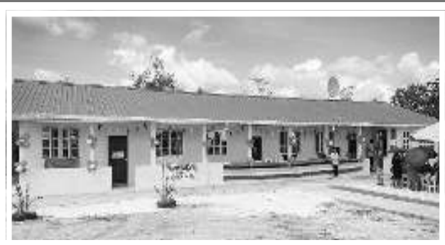
The commissioning in Campbelltown

Campbelltown Primary officially School, by commissioned Minister of Education their primary education Campbelltown's youth. Manickchand, Priya a significant marks in addressing educational accessibility. Plans are already in was unveiled at the Monkey motion for an extension