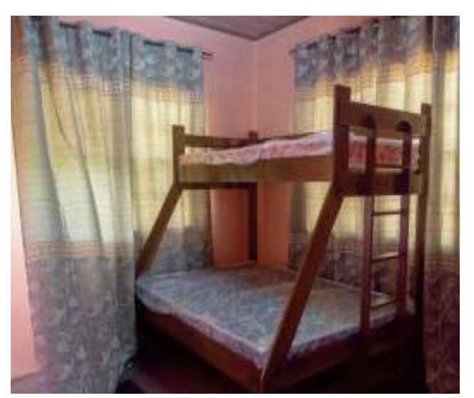
The interior of the house