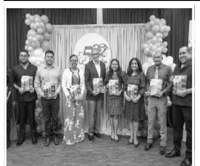
Launch of the 592 Health Digest

This state-of-the- health officials under one services, we need to will be in this one significant improvement including the remote previous areas like Region Nine.