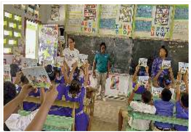
The book helps children understand their rights and how to stay safe