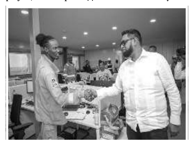
Part of the site visit

and development. The base is designed to of emergency response Guyana's tools