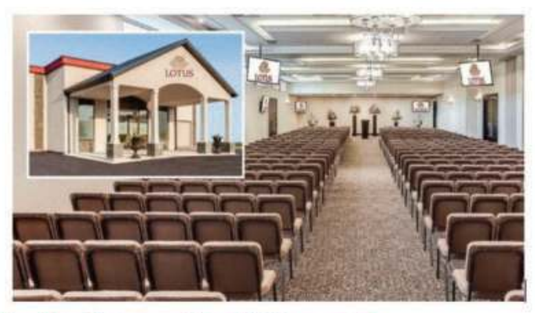
Seating for more than 500+ guests!

121 City View Drive North of Belfield Road, East side of Highway 27 647-547-8188 www.lotusfuneralandcremation.com