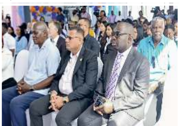
Stakeholders at the event

government those with the United acquired and a in ensuring not just ideals we iustice, equality, and principles we live by," and