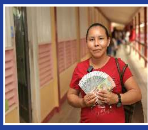
THOUSANDS IN REGIONS ONE AND EIGHT RECEIVE $100,000 CASH GRANT