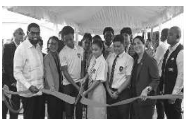
The cutting of the ribbon for the new US$12M laboratory and administration facility

in driving growth services, economic competitiveness. highlighted government's standards. The modern commitment to investing laboratory is designed in key agencies like the to conduct a wide range GNBS to strengthen the including country's position in the protection, global market.