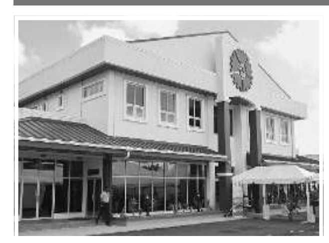
The new laboratory facility and administration building at GNBS

The Guvana National Bureau of Standards (GNBS) has significantly upgraded its capacity to enhance the country's standards and quality infrastructure with the inauguration of a new, state-of-the-art laboratory facility and administration building.