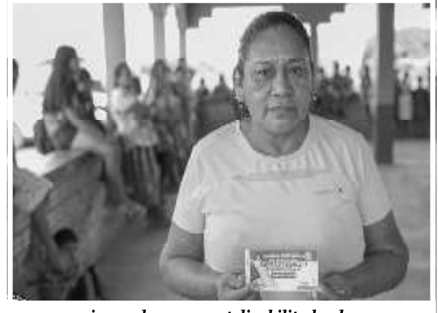
2025 pension and permanent disability books distribution in Region Nine

"We sincerely apologise for the delay...we had to