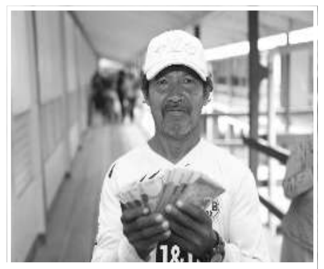
Hinterland resident receiving the grant

government's implementation Region Nine, programme services of encashment ensured a smooth Democratic distribution process.