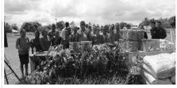
Minister Mustapha while handing over agricultural inputs to farmers from Annai

Mustapha Zulfikar handed over a $3 million Multispectral project, will provide Massara Mavic drone to the Regional data on soil nutrients, villages. Agriculture Department. moisture, crop health, staple crop in the region, underscored environmental cutting-edge and The drone will aid farmers conditions-key in soil testing, crop optimising yields. health monitoring, and agriculture, precision