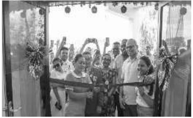
$45M health administration building commissioned in Region Nine

This investment in healthcare infrastructure The upper floor demonstrates government's commitment improving healthcare access and quality in