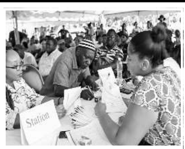
The contract signing exercise in Linden

In Linden, additional contracts worth $76.7 million have been signed for development, road complementing the 325 contracts valued at $4.2 billion awarded earlier. These projects aim to improve connectivity, reduce travel time, and enhance the overall quality of life for residents.