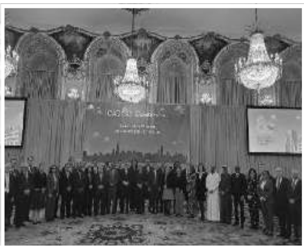
Guyana participating in 80th Anniversary of International Civil Aviation

Guvana remains collaboratively and dedicated to contributing effectively," said Lt. to a global aviation landscape that is both The Extraordinary innovative and resilient.