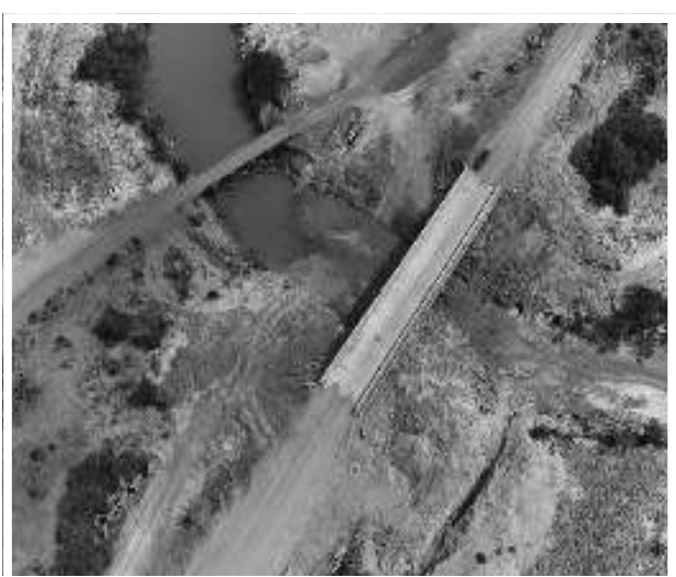
The completed Pirara Bridge

transformative was announced by of Nappi. Public of been Works, Bishop Juan Construction