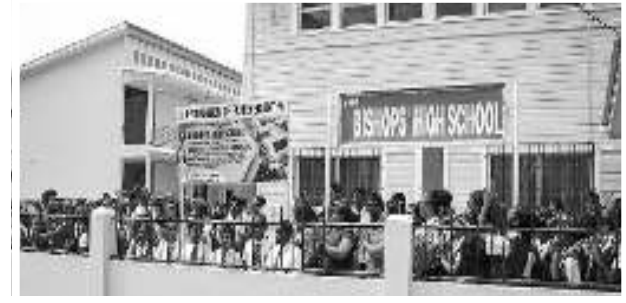
The Bishops' High School recognised as model Caribbean Vocational Qualification Institution

Collaboration with mentorship. the school's commitment local industries provide to providing students students with valuable school has high-quality real-world experience in workshops, field trips, and industry