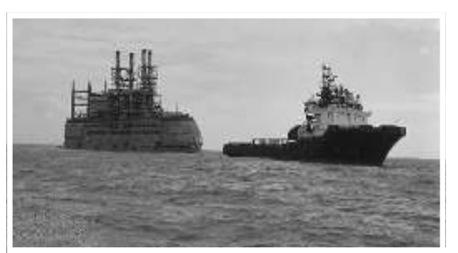
The second Power Ship in Guyana's waters

The Guyana Power of a two-year agreement Chief Executive Officer, Karpowership track. to Global DMCC and Qatar-