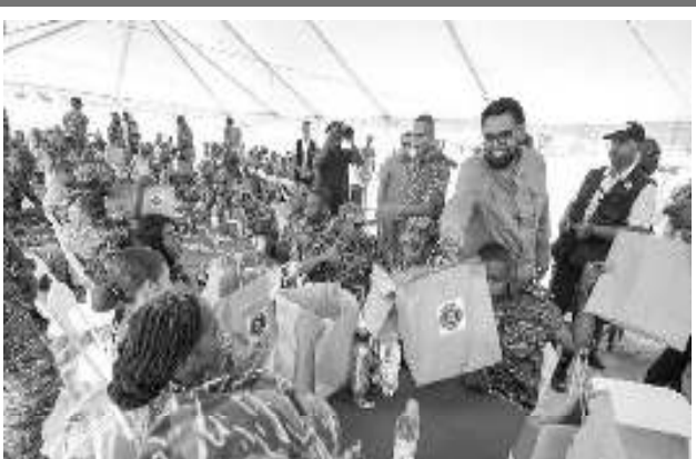
The Guyana Defence Force's Annual Christmas Lunch at Base Camp Seweyo

From January 2025, public servants will also