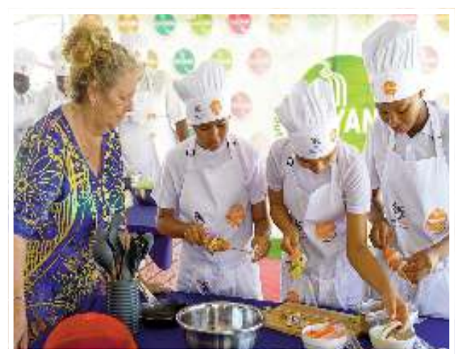
Participants preparing their dishes

also contributes to development of Showcase the country's tourism