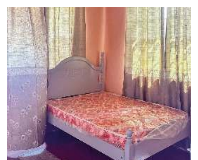
The interior of the house