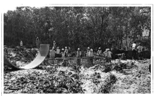
Ongoing works to connect the second Power Ship to the Grid

The addition of this second power ship will complement the existing 36MW floating power plant in the Berbice significantly Guyana's