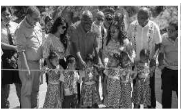
The commissioning iof the Moco Mococ plant

Mahdia, In newly commissioned 0.65-megawatt solar photovoltaic