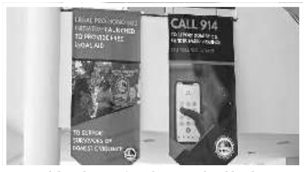
Some of the other services that are offered by the Ministry of Human Services and Social Security to eradicate gender-based violence

The project, which commenced in 2021, is expected to continue until 2026. Through health, two governments aim to equality, make a lasting impact on the lives of countless children in Guyana.