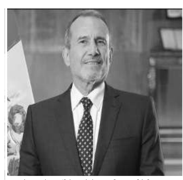
Peru's Foreign Affairs Minister, Elmer Schialer