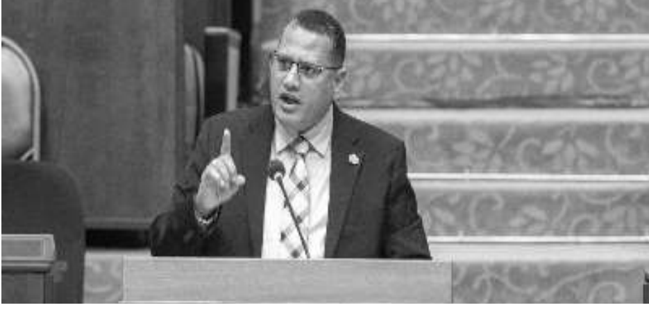
Minister of Housing and Water, Collin Croal

The bill received support from the opposition, recognizing its potential to unlock