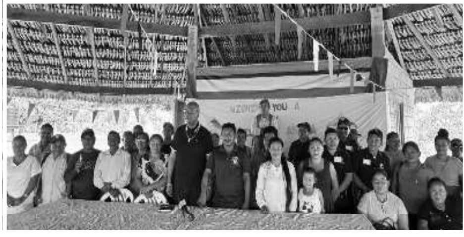
Minister of Public Works, Bishop Juan Edghill alongside the Toshao and villagers of Nappi, Region Nine

the Village: $55.6 million with asphaltic concrete, with dust and wear. maximum benefit to development. announcement during in upgrades, handled by