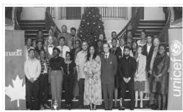
New plan launched to promote safe living, learning for migrant and hinterland children

A new project, titled "Promoting Safe and Healthy Learning and Living Environments Migrant for and Host Communities in Guyana's Hinterland and Selected Coastal Areas ", aims to improve access to safe living and learning conditions for migrant children and in hinterland those