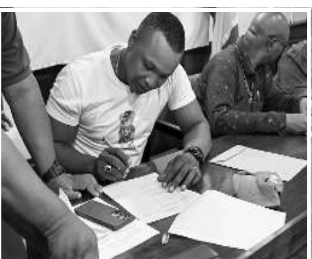
The contract signing ceremony in Bartica

regions. government's The projects focus on communityto based development and is evident in these