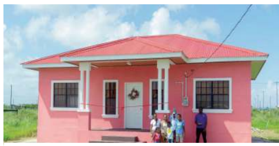
New home transforms Region Three family's life

To further assist the completion of their new an elderly woman with a family, the government three-bedroom home. disability, can now enjoy plans to construct a The long-awaited dream a safe and comfortable chicken coop behind the house. This initiative Reddy, will enable the family to sole start a small business, handed over the keys to breadwinner, expressed providing them with a the $15.3 million house. deep gratitude to the source of income and