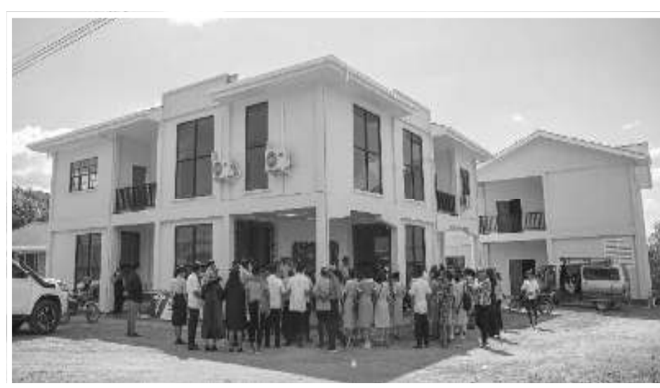
$45M health administration building commissioned in Region Nine

NEW HEALTH ADMIN BUILDING AND TRAINING CENTRE OPENS IN LETHEM