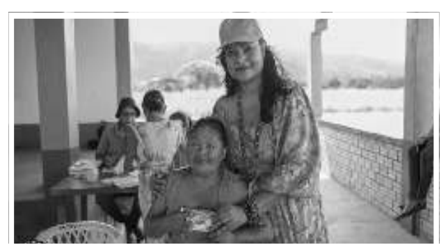
2025 pension and permanent disability books distribution in Region Nine

The ministry process and keeping informed Permanent through regular updates.