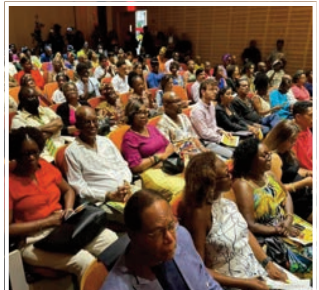
Scene from the Brooklyn Emancipation Day event