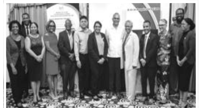
Guyana launched the Bachelor of Science Degree in Respiratory Care

in the programme's development, expressed pride in Guyana's pioneering role. "Guyana will be the first in the Caribbean and one of just a few developing countries to offer a respiratory [degree] programme," she said.