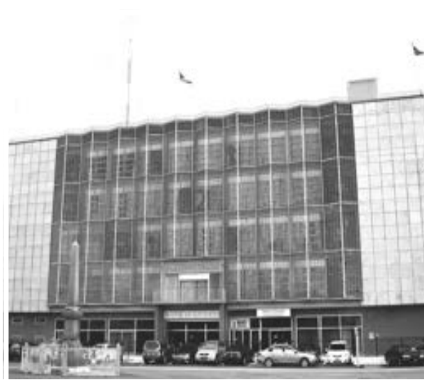
Bank of Guyana

While mining and quarrying exhibited mixed results, with growth in sand and crushed stone offset by declines in diamond, bauxite, and gold production, the manufacturing sector showed improvement in several areas, including beverages, putty, paints, and flour. The construction and services sectors also