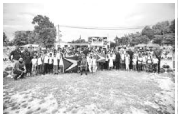
President Ali and Men on Mission officials with the participants of the One Guyana, Youth Camp at Kuru Kuru Training Centre