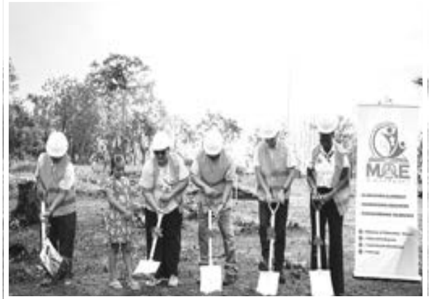
The turning of the sod

The Minister also called for collaboration between the community and the contractor, emphasising the opportunity for local employment during the construction phase. "We want him (the contractor) to give the work to you, we want you to benefit as far as you can, but we want the school," she stated.