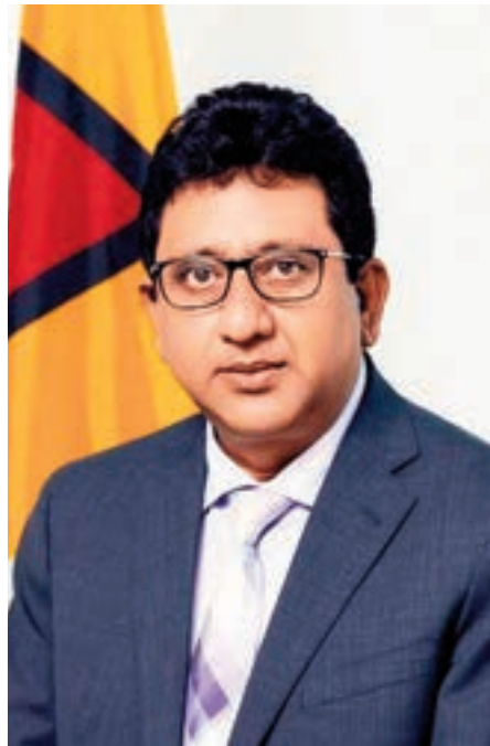
AG Anil Nandlall

According to the statement of claim, the collapse of the CLICO Group was exacerbated by corporate mismanagement, financial impropriety, and the concealment of the true financial state of the group from regulators and governments. The claimants submitted that the corporate structure was a facade, designed to obscure the group's financial realities and to evade legal obligations. The Attorney General of Guyana and CLICO Life and General Insurance Company are seeking various remedies,