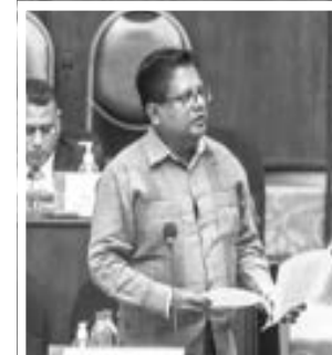
Senior Finance Minister Dr. Ashni Singh presented the supplementary estimates to Parliament

also presented loan agreements to foster development while ensuring effective debt management. Dr. Singh presented these agreements to the National Assembly, noting a reduction in the country's debt-to-GDP ratio from over 600% in 1991 to 27% in 2023.