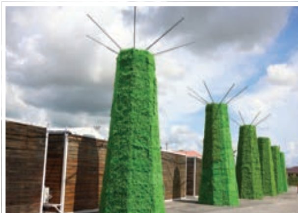
Ongoing works on the booths at the National Stadium

University of Miami. This cutting-edge development aims to be a model of sustainable