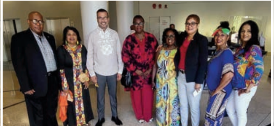
Scene from the Brooklyn Emancipation Day event

The Guyanese community in Brooklyn came together to commemorate Emancipation Day with