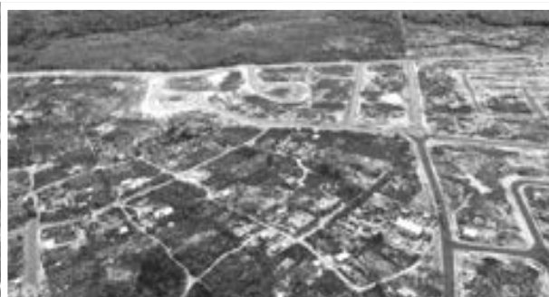
An aerial view of Plantation Fitz Hope (Amelia's Ward Phase Four) in Linden, Region 10, which was regularised

He added, "But there have been some small pockets that we have noticed popped up that we had to address...We have been monitoring the areas where we have squatting that we can minimise."