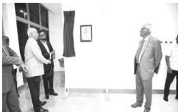
Commissioning of the US$12 million Banks DIH Automotive Subsidiary Company

The new subsidiary will serve as the official dealer for several automotive and related brands, including UniCarriers Forklift trucks, Daikin Air Conditioning units, and SWM vehicles.