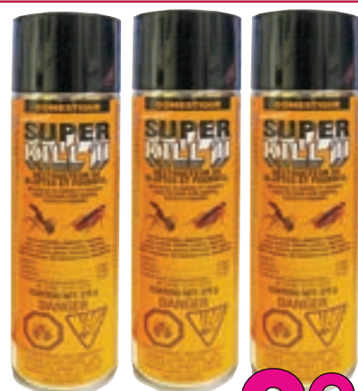
Super Kill II Roach & Ant Killer 375 ml