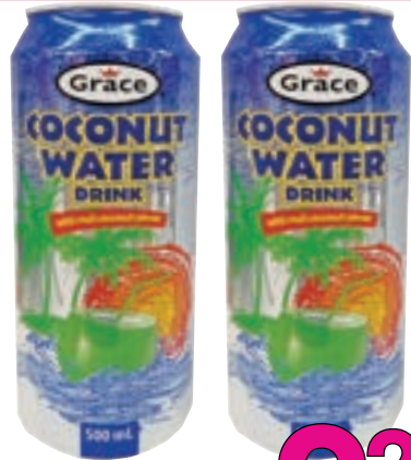
Grace Coconut Water With Pulp 500 ml