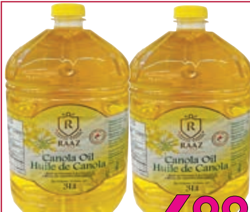
Raaz Canola Oil 3 L