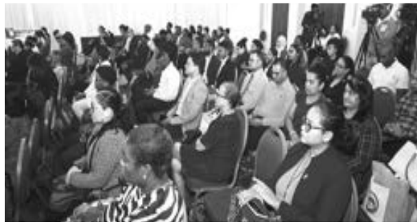
Some of the participants

The government hopes that this initiative will foster a deeper understanding of human rights in Guyana and strengthen the country's commitment to upholding these principles.