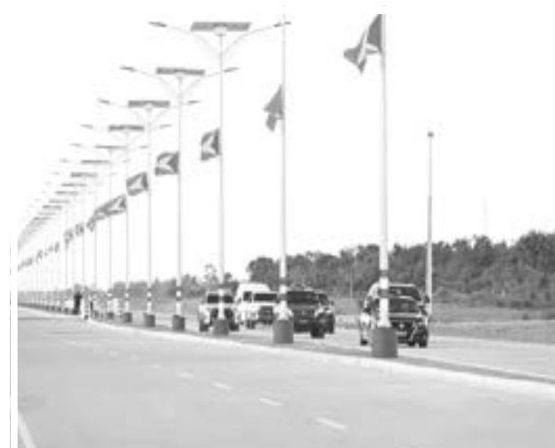
Streetlights along the Heroes Highway

"A massive streetlight programme throughout the length and breadth