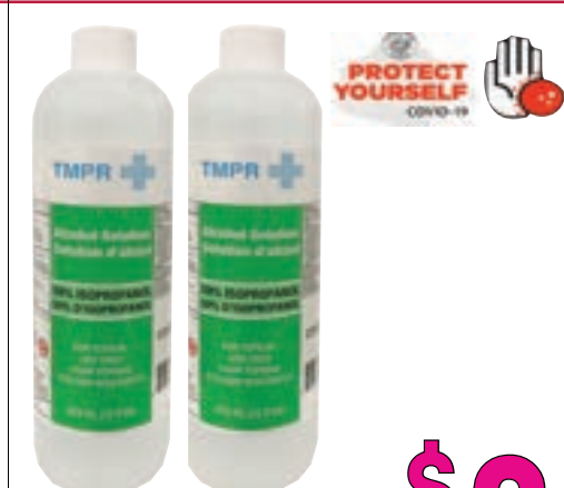
TMPR Alcohol Solution 473 ml