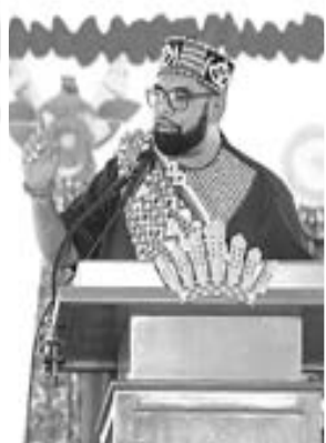
President Ali unveiling the groundbreaking initiative

Palmyra, Region Six, will soon be home to a new national cultural market designed to honour Guyana's rich cultural heritage and celebrate the 186th anniversary of emancipation. President Ali unveiled