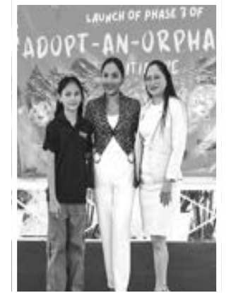
First Lady, Arya Ali and a representative from Optique Vision Care

benefitting during the programme's third phase include: Prabhu Sharan Orphanage, Red Cross Convalescent Home, Bless the Children Home, St John's Bosco Orphanage, Shaheed's Girls Orphanage, Shaheed's Boys Orphanage, Hope Children's Home, Joshua's Children Home, and Ruimveldt Children's Home and Care Centre.