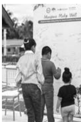
The Mangrove Pledge Wall for attendees to share remarks

Speaking at the National Mangroves Exhibition at the Kingston Seawall, Singh emphasised the government's commitment to environmental