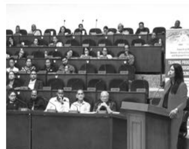
Minister of Local Government and Regional Development, Sonia Parag addressing the councillors

Participants expressed confidence that the acquired knowledge will