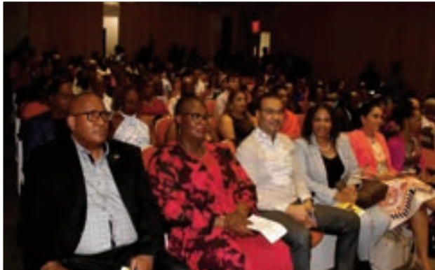
Scene from the Brooklyn Emancipation Day event

inspiring the current generation to carry forward their legacy.