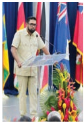
President Ali addressing the meeting

President Dr. Mohamed Irfaan Ali has lauded the Caribbean Community (CARICOM) for its significant contributions to biodiversity, justice, climate change, agriculture, and sports.