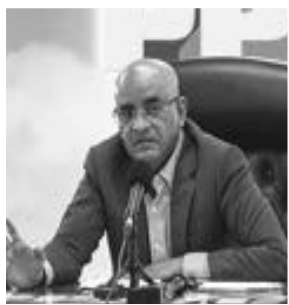
People's Progressive Party/Civic's (PPPC) General Secretary Dr. Bharrat Jagdeo

People's Progressive Party/Civic's (PPP/C) General Secretary Dr. Bharrat Jagdeo, while reflecting on the fourth anniversary since the PPP/C assumed office following the contentious 2020 elections, said more than 90 percent of the party's manifesto promises have been