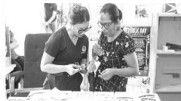
A beneficiary during the eye testing and spectacle exercise

programme underscores the importance of accessible and affordable eye care services for the Guyanese population.