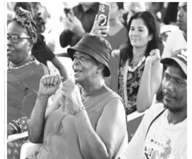
Part of the gathering

consultations with cultural groups. Within six weeks, community consultations will begin, and a committee will be established to formalise the plans.