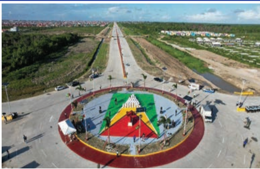
PPP/C GOVT MARKS FOURTH ANNIVERSARY - 90 PERCENT OF PARTY'S MANIFESTO PROMISES FULFILLED