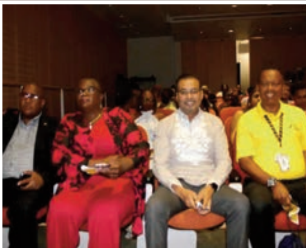
Scene from the Brooklyn Emancipation Day event