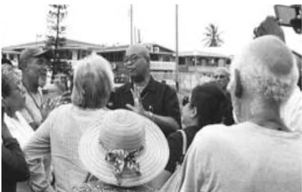
Minister of Public Works, Bishop Juan Edghill engaging stakeholders of Lamaha Gardens on traffic disruptions

Minister Edghill stated. “We will also reduce speed limits and increase police patrols in these areas.”