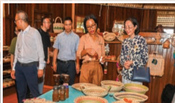
Minister Walrond and Ambassador Haiyan enjoying craft items in the village craft shop

between Guyana and China, focusing on areas such as infrastructure, education, and sustainable development.