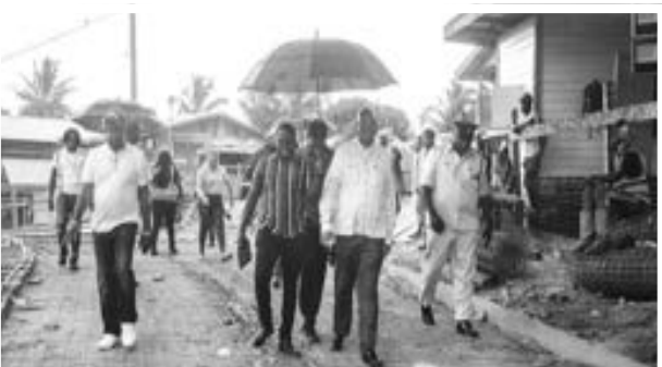
Minister of Public Works, Bishop Juan Edghill, along with regional officials and engineers inspecting ongoing road works in Linden