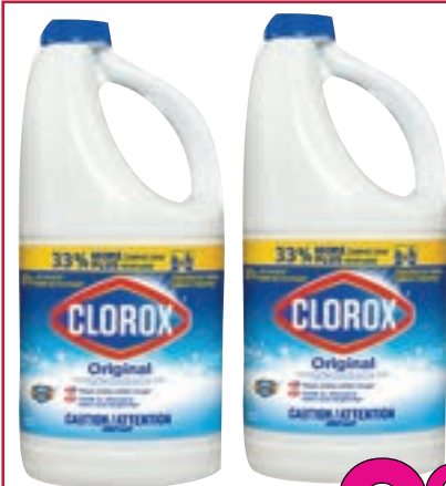
Clorox Liquid Bleach 1.27 L