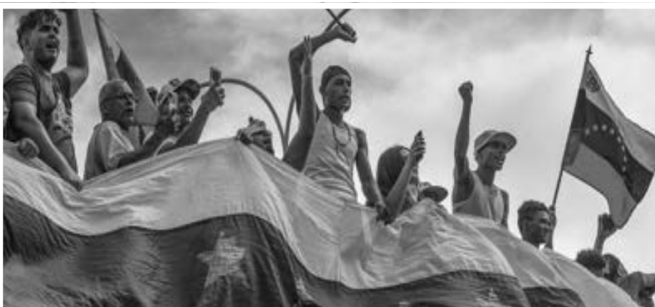
In Valencia, Venezuela, on July 29, protesters demonstrate against the official election results declaring President Nicolas Maduro's reelection.

fair, and transparent process," the statement read. It stressed the collective responsibility to uphold the integrity of the electoral process through strict compliance with election rules.