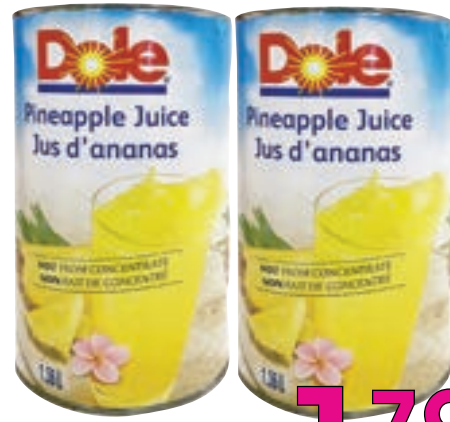
Dole Pineapple Juice 1.36 L