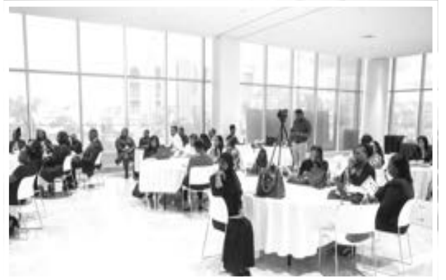
Law libraries conference focuses on capacity building and innovation

The conference brought together information professionals from courts, government ministries, parliaments, academic institutions,