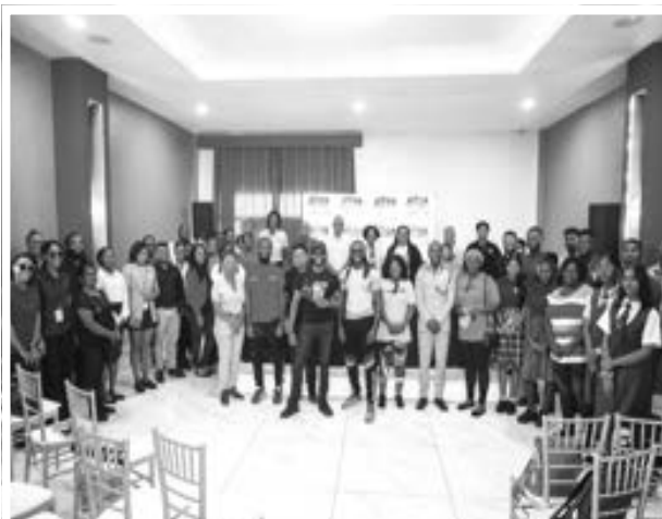
Some of the participants of the SOCA project

deaths in the country, emphasising the need for collaborative efforts to address the issue.