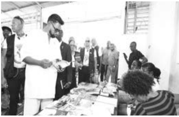
President Ali at the annual health fair, business expo, and family fun day

President Dr. Mohamed Irfaan Ali has shown his support for the Guyana Conference