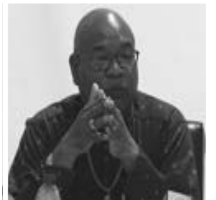
Minister of Public Works, Bishop Juan Edghill during discussions with members of the Corentyne Chamber of Commerce

The construction of the four-lane highway is