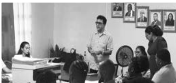
Attorney General and Minister of Legal Affairs, Mohabir Anil Nandlall, SC, during the outreach to Port Kaituma

The Attorney General's Chambers has fulfilled a promise made by President Dr. Mohamed Irfaan Ali by bringing Deeds and Commercial Registry services directly to residents of Port Kaituma. The outreach initiative, held at the Port Kaituma Community