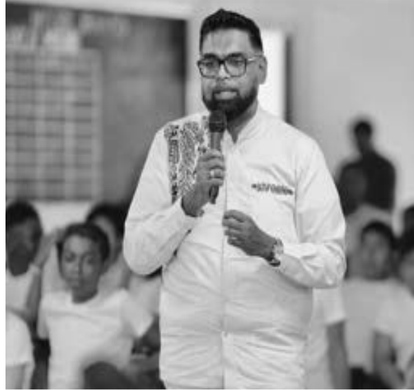
President Dr. Irfaan Ali

food inflation, the government removed value-added tax (VAT) on essential items such as fertilisers, agricultural implements