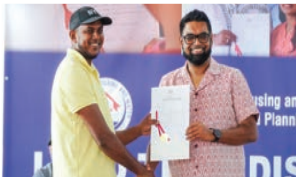
President Ali handing over certificates

Minister of Housing and Water, Collin Croal, underscored the importance of land ownership in securing the future for families. Minister within the Ministry of Public Works, Deodat Indar, also addressed the gathering, emphasising