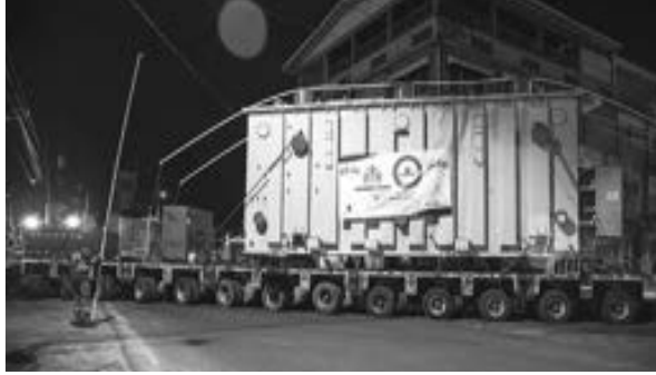
One of the 241 metric tons transformers being moved from the JFL Terminal on Water Street to its Inland Terminal on Mandela Avenue.

Guyana has marked a significant milestone in its energy sector with the historic arrival of 16 transformers and 244 accessories destined for the Gas-to-Energy and Guyana Power and Light (GPL) Enhancement Projects. Among these, two transformers weighed a staggering 241 metric tons each, setting a new record for the heaviest cargo ever handled in the country.