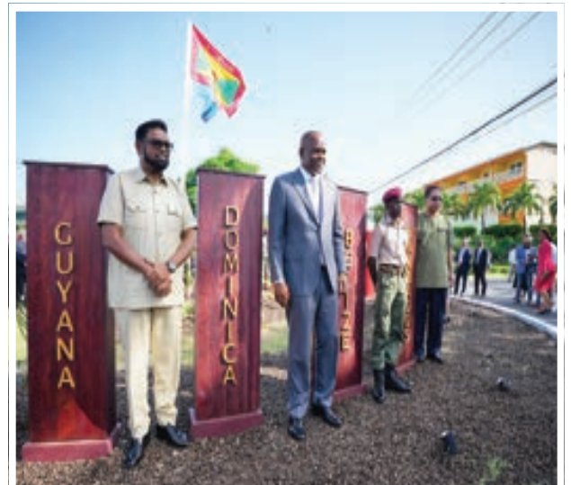
President Ali at the official unveiling of the CARICOM Roundabout

During the three-day event, President Ali joined other CARICOM leaders in St. George's for the official unveiling of the CARICOM Roundabout, a symbol of regional unity. He also participated in a working breakfast between CARICOM and a high-level delegation from Canada, focusing on enhancing the partnership for development.