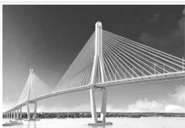
Artistic impression of the Corentyne River Bridge

The construction of the highly anticipated Corentyne River Bridge, aimed at enhancing connectivity between Guyana and Suriname, is currently pending financial approval from