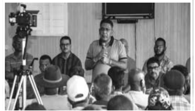
President Ali engaging fisherfolks in Mon Repo

In addition to the spraying campaign, the government is also addressing drainage