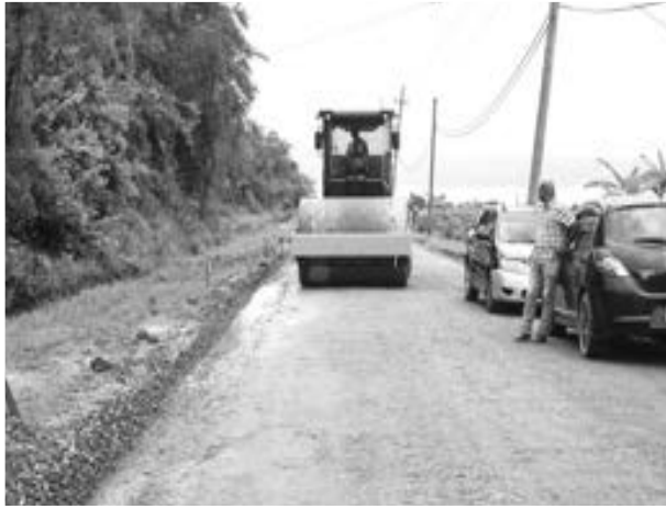
Ongoing Road works in Mahaicony Branch Road

The $294.3 million project, being executed by R&B Investment Inc., has faced delays due to design changes accommodating a requested retaining wall. Despite the setbacks, the minister remains optimistic about meeting the new deadline.