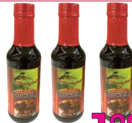
Humming Bird Browning 147 ml