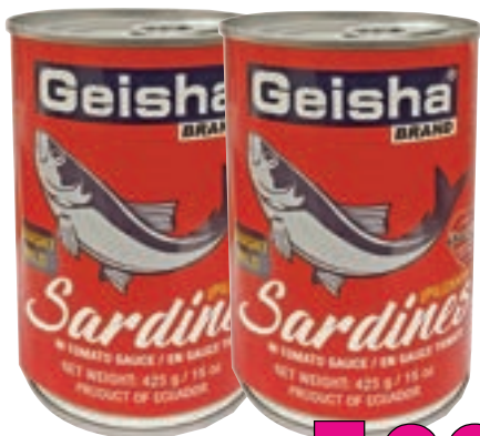
Geisha Sardines In Tomato Sauce 425 ml