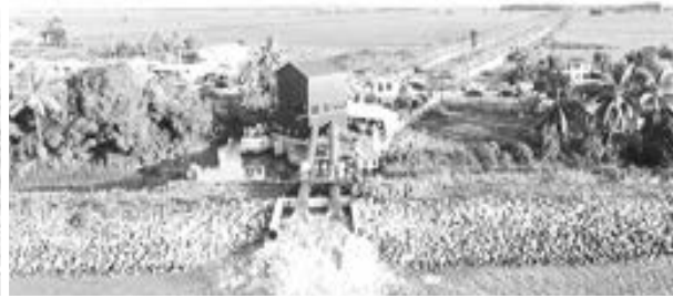
New $565.3M pump station commissioned at Greenwich Park, Region Three

collaboration with Lynch Caribbean Brokers, GuyCarpenter, Raincoat, and the CARICOM Secretariat.