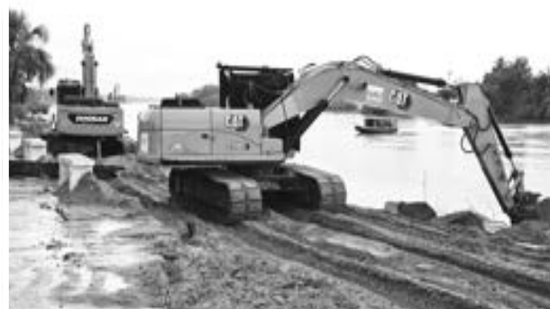
Ongoing River defence works on the Mackenzie watershore

By investing in high-yielding coconut varieties, the government aims to boost the coconut industry, create jobs, and contribute to the overall economic growth of Guyana.