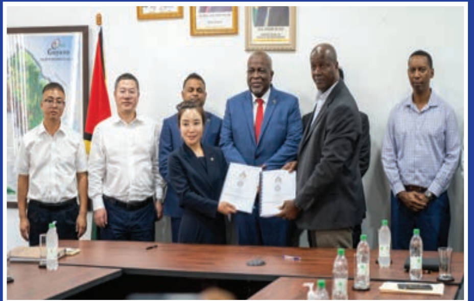
GOVT INKS US$8.6 MILLION CONTRACT FOR NATIONAL CONTROL CENTRE IN GAS-TO-ENERGY PROJECT