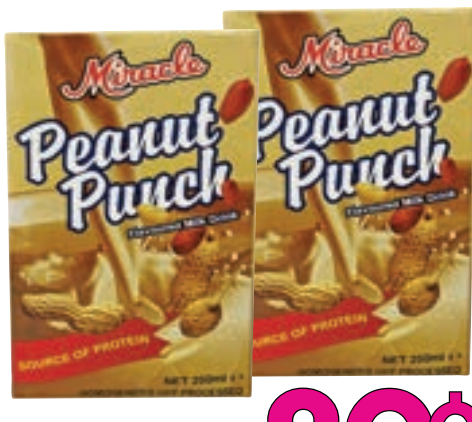
Miracle Peanut Punch 250 ml