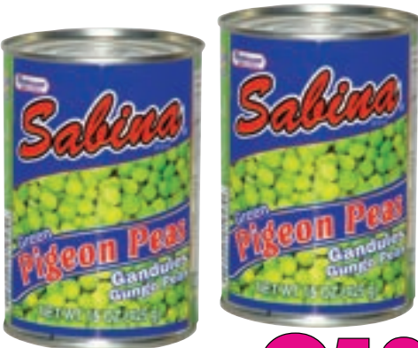
Sabina Green Pigeon Peas 398 ml