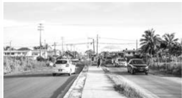
The Cemetery Road Project

expected to significantly improve transportation and economic development in the region.