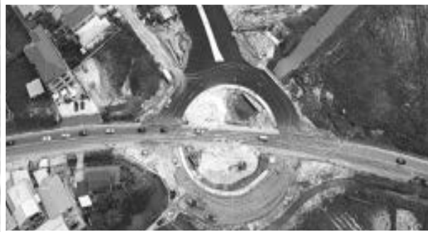
Paving ongoing on the roundabout at Crane, which connects the Schoonord to Crane four-lane highway to the West Demerara Public Road

include creating 50,000 to 60,000 jobs for the unemployed, increasing disposable income in the public sector by $90 billion, delivering over 33,000 house lots and providing scholarships to 50,000 individuals.