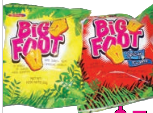
Big Foot Cheese Snacks 25 g