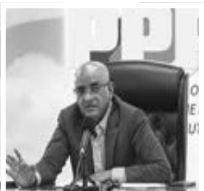
General Secretary of the People's Progressive Party, Dr. Bharrat Jagdeo speaking at his weekly press conference

Dr. Bharrat Jagdeo, General Secretary of the People's Progressive Party (PPP), is confident that the ongoing elections fraud case related to the 2020 general elections may ultimately be heard by the Caribbean Court of Justice (CCJ).