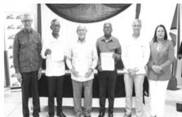
Labour Ministry and INFOTEP ink historic MoU

government's commitment to providing accessible and high-quality education for all Guyanese children. As Regional Chairman Ayube emphasised, "These investments are a testament to the government's dedication to building a stronger education sector through prudent policies and strategic funding."