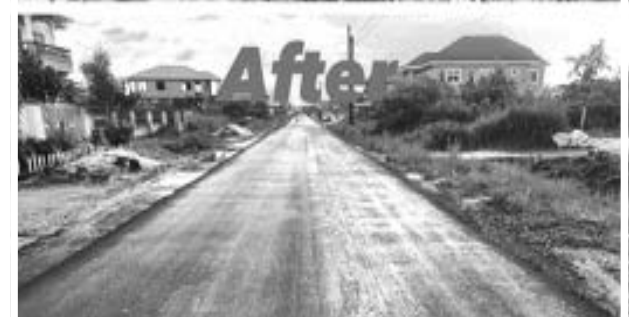
Before and after of Farm main access road, East Bank Demerara