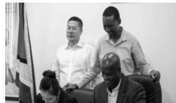
Permanent Secretary of the Office of the Prime Minister, Alfred King and Chief Representative of Power China, Dan Shen signing the contract for the construction of the National Control Centre building

"This facility will be instrumental in GPL's ability to efficiently manage the power grid," he said. "It will house the scanning equipment necessary for the advancement of the power sector."