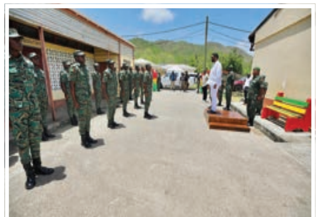
President Ali visiting GDF troops in Grenada

leaving a significant trail of destruction in its wake.