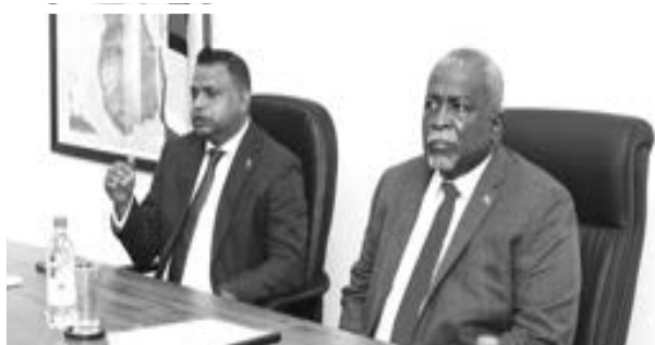
Prime Minister Brigadier (Ret'd) Mark Phillips and Minister within the Ministry of Public Works, Deodat Indar during the signing ceremony

The government has taken another significant step towards the realisation of its ambitious Gas-to-Energy project. A US$8.6 million contract was signed for the construction of a National Control Centre, a crucial component of the overall initiative.