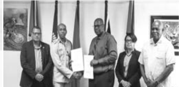
MoU signed for GPS to produce 500,000 concrete blocks for Silica City

Understanding (MoU) for the Guyana Prison Service to produce 500,000 concrete blocks for the upcoming Silica