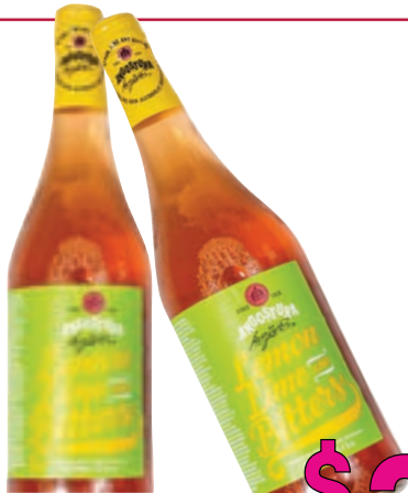
Angostura Lemon Lime & Bitters Drink 750 ml

We're simply the best West Indian store in town.