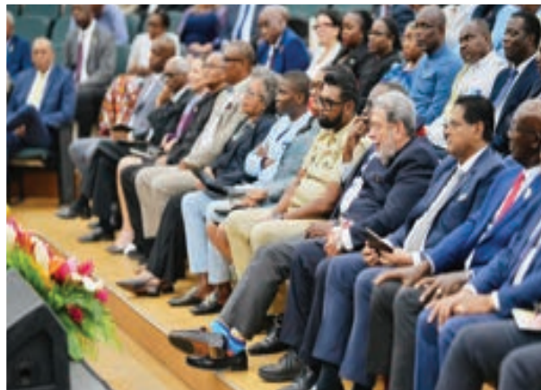
President Ali at the 47th Regular Meeting of the Conference of Heads of Government in Grenada

Council (ICC) Men's T20 World Cup, showcasing its ability to host world-class