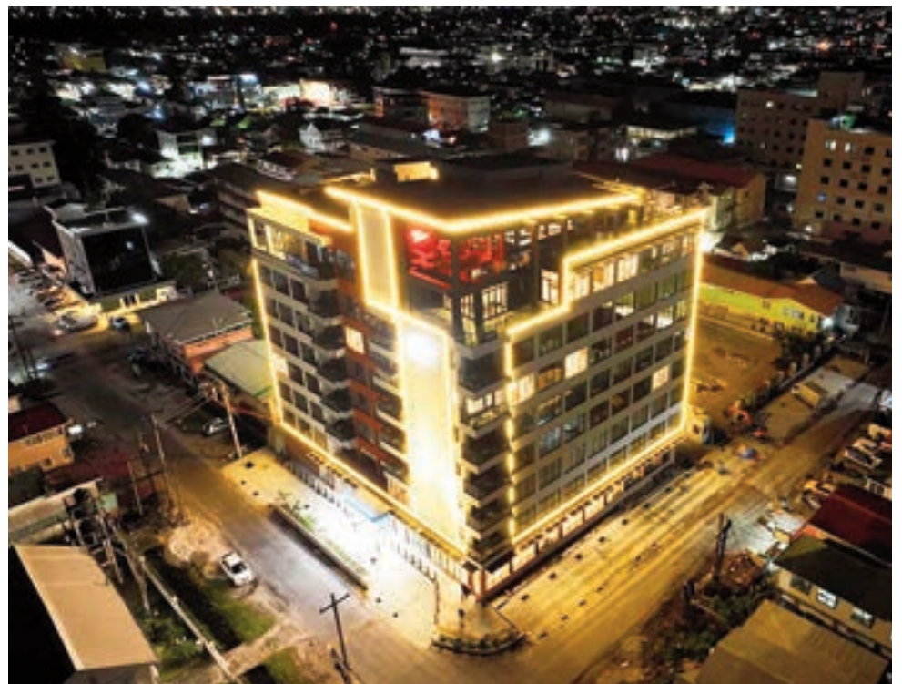
The Aiden by Best Western will be opened soon in Georgetown

Moreover, the influx of international hotel brands is anticipated to