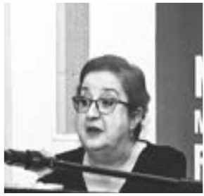
Minister of Parliamentary Affairs and Governance, Gail Teixeira

A 10-week course, initiated by the Ministry of Parliamentary Affairs and Governance, will equip 195 participants with a Certificate in International Human Rights Law.