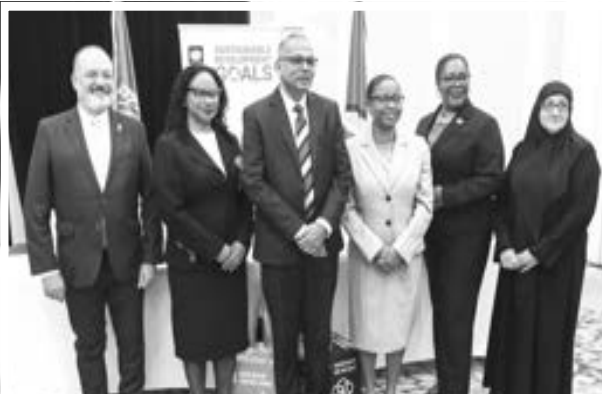
Judges' Forum discusses HIV patients access to justice and equality

Minister of Health, Dr. Frank Anthony, emphasised the importance of reducing stigma and discrimination against