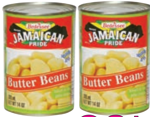
Jamaican Pride Butter Beans 398 ml