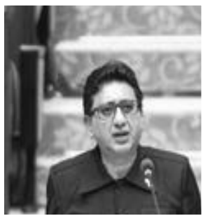
Attorney General and Minister of Legal Affairs Mohabir Anil Nandlall SC during the passage of the Matrimonial Causes Amendment Bill 2024

and Minister of Legal Affairs Mohabir Anil Nandlall SC emphasised the need for the law to align with contemporary societal values. "What societal values were 90 years ago...are radically different from what they are today," he stated.