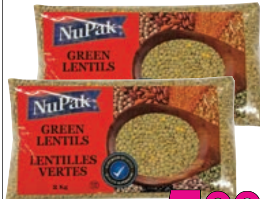
Nupak Green Lentil 2 lb