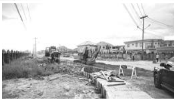
Massive infrastructural works taking place on the East Bank of Demerara

In a continued effort to improve traffic management and reduce road violations, President Ali has mandated the installation of e-ticketing systems on all new highways.