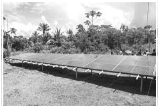
Over $45 M in solar mini-grids commissioned to boost power supply in Region One

The GEA will be employing local residents to maintain the solar systems, providing job opportunities and skills training for the community.