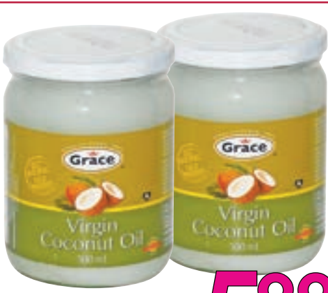
Grace Virgin Coconut Oil 500 ml