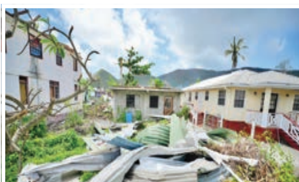
The troops are supporting the rebuilding efforts on the island of Carriacou, severely affected by Hurricane Beryl