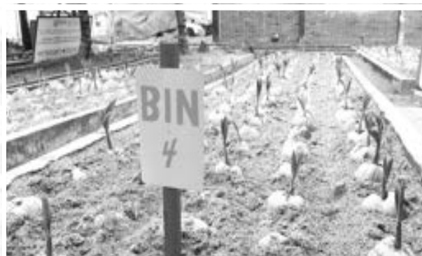
Guyana to import 50,000 more high-yielding coconuts from Costa Rica