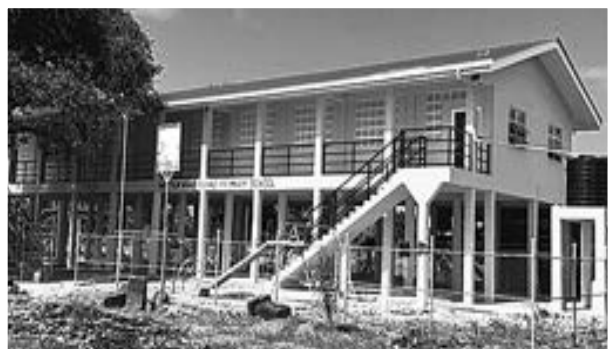
Western Hogg Island Primary School completed

with all the necessary tools. It's more spacious and will undoubtedly make