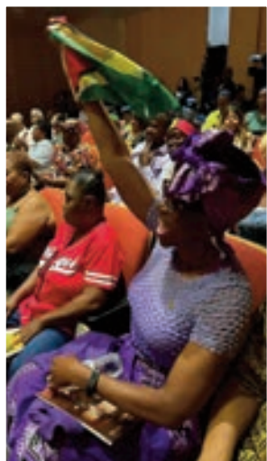
Scene from the Brooklyn Emancipation Day event

was marked by festive activities and shared reflections on the enduring impact of Emancipation Day. It served as a powerful reminder of the community's shared heritage and its commitment to honoring the sacrifices of past generations.