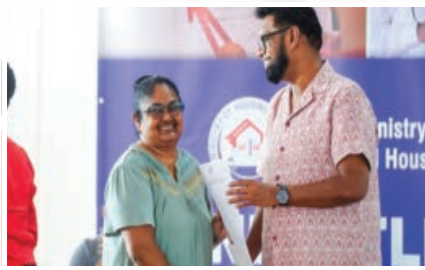
President Ali handing over certificates

Fifty-six families hailing from the in Region Three have officially become landowners after receiving their Certificates of Title. This significant development was made possible due to a commitment by President Ali during a recent outreach to the region.