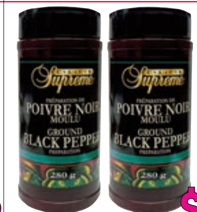
Club Supreme Ground Black Pepper