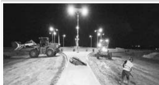
Working the night shift to complete the Schoonord to Crane four-lane highway by the end of the month

Minister within the Ministry of Public Works, Deodat Indar, echoed the President's sentiments, stating that