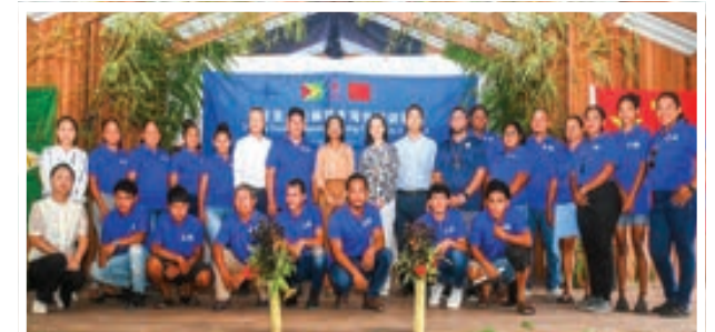
Beneficiaries of the programme pose with the visiting officials and trainers