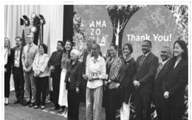
The summit aims to foster sustainable development while safeguarding the rainforest