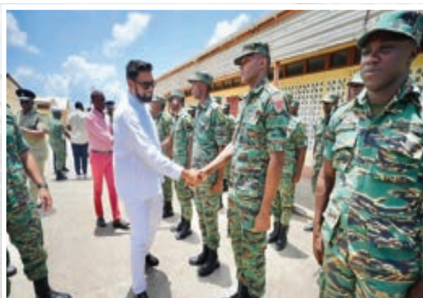
President Ali visiting GDF troops in Grenada

Commander-in-Chief of the Armed Forces, President Dr. Irfaan Ali, visited members of the Guyana Defence Force (GDF) stationed in Grenada to support the rebuilding efforts on the island of Carriacou, severely affected by Hurricane Beryl.