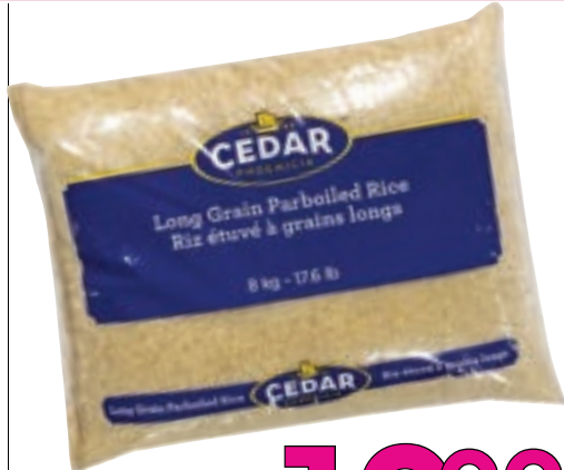
Cedar Parboiled Rice 8 kg