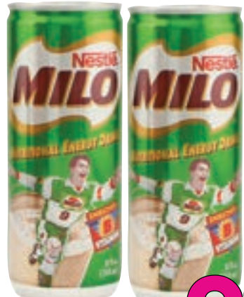
Milo Drink Original 240 ml