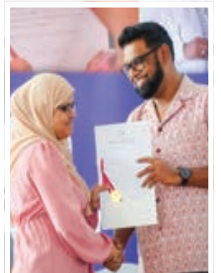
President Ali handing over certificates