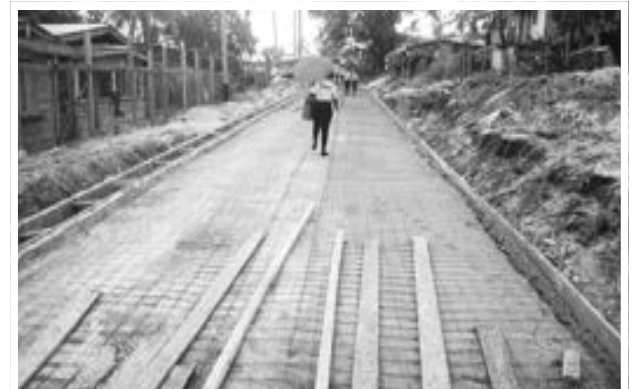
Ongoing Road works in Linden

The minister also highlighted the government's strategy to empower local contractors. “Last year, some contractors lacked the capacity with pavers and equipment, so we engaged smaller contractors to work on concrete roads in sections. This allowed us to involve over 50 contractors in Linden,” he