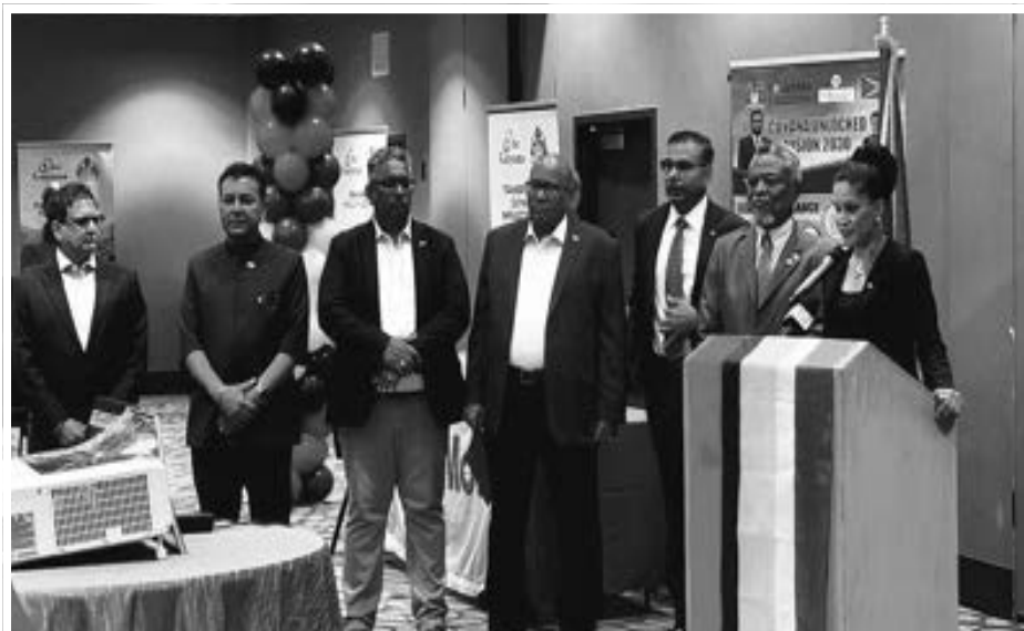
Government and Private Sector representatives at the Diaspora Job Fair

By leveraging the talent and expertise of the Guyanese diaspora, the government aims to accelerate economic development and build a sustainable workforce.