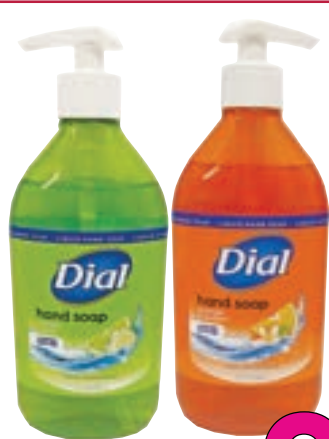
Dial Hand Soap Assorted 385 ml