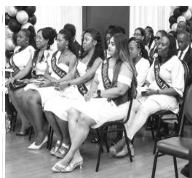
Some of the graduates

Thirty new employees, including inspectors, customer service representatives, internal auditors, and nurses, graduated. They will play a crucial role in strengthening the scheme and protecting the rights of workers.