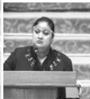
Minister of Education Priya Manickchand underscored the importance of the new Family Violence Bill

The law broadens the definition of abuse to encompass emotional and psychological harm, and it addresses the issue