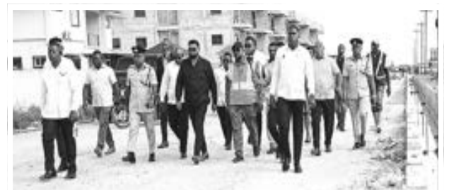
President Ali inspecting ongoing road works on the East Bank of Demerara

"This development is crucial for easing traffic flow and improving the daily commute for thousands of people," President Ali noted.