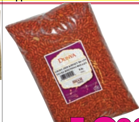
Dunya Red Kidney Beans 8 lb