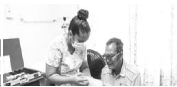
A beneficiary during the eye testing and spectacle exercise

Launched at locations including Dundee Health Centre, Enmore Hope Primary School, and Diamond Health Centre, the