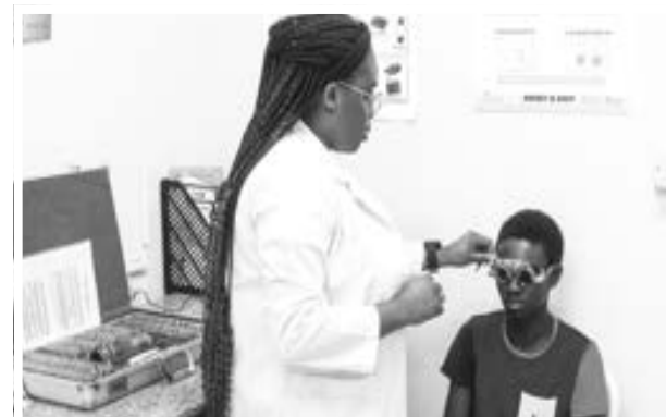
A beneficiary during the eye testing and spectacle exercise

programme offers vouchers worth $2,000 for eye screening and $15,000 for spectacles, targeting individuals