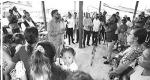
President Ali engaging fisherfolks in Mon Repo

President Ali with the fishermen announced plans to enhance the working conditions for approximately 500 fisherfolk at Mon Repos, along the East Coast Demerara (ECD). During a meeting